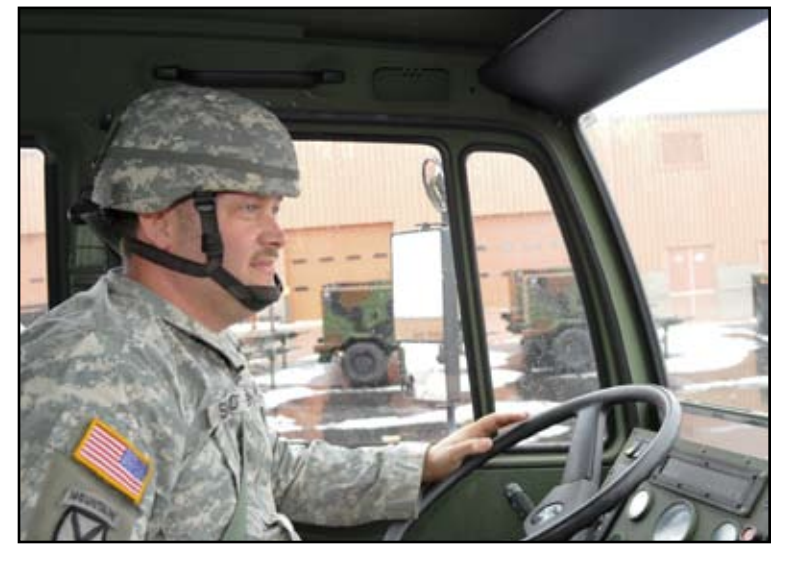
A Staff Sergeant with Det. 1, 1427th Transportation Company takes an LMTV on a test run March 5 at the MATES building on Fort Drum.