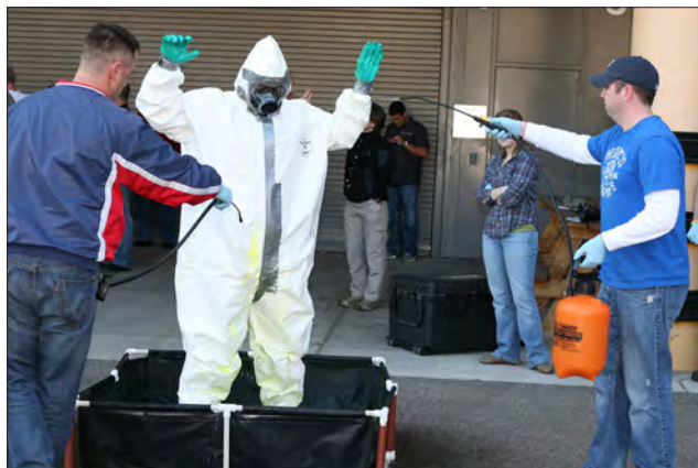
Clan Lab students attempt to decontaminate their teammate during an exercise designed to show the difficulty to remove every trace of contamination.

The culmination of learning for the week is a hands-on meth cook. During this portion of the class, students are instructed by a highly qualified and