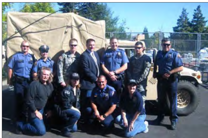
Members of the Portland Police Bureau, Drug Enforcement Administration, and the Oregon National Guard Counterdrug Support Program with a HUMV loaded with unused medication.

This event was an opportunity for the citizens to witness the collaborative efforts between the National Guard CD Program and law enforcement agencies to combat the drug problems in the communities.