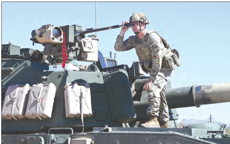
When it comes to impact on Soldier safety and combat effectiveness, the Common Remotely Operated Weapons Station (CROWS) has been one of the more significant systems in the Department of War. U.S. Army Yuma Proving Ground is conducting developmental testing of a low-profile variant that will integrate the system into the M109A7 Paladin self-propelled howitzer and the M992A3 Carrier Ammunition Tracked vehicles.

A gyro-stabilized mount and fully integrated fire control system allow for high-precision targeting and a high probability of a first-burst hit, even while an armored vehicle is on