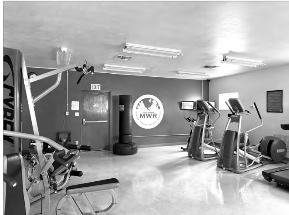
The new additions to the gym on the Kofa Cantonment include a spin bike, punching bag, AB bench and yoga mats. Morale, Welfare, and Recreation plans to host an open-house soon allowing employees to give feedback, see improvements, and learn about sign-in procedures.

Fitness Center posts on its Facebook: Yuma Proving Ground Family and MWR. Alternatively, it has a phone number by calling extension 928-328-2400.