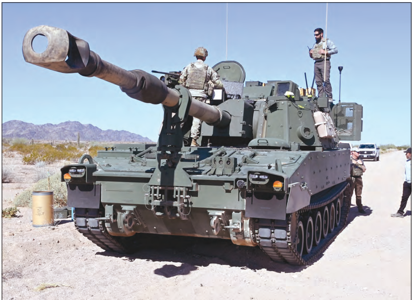
Earlier versions of the CROWS were not feasible in the Paladin, the most potent self-propelled howitzer in the United States' arsenal. Boasting a 155 mm main gun that can fire up to four rounds per minute, components on the platform must be rugged enough to handle enormous amounts of recoil blowback force.

Soldiers from Fort Bliss, Texas' 4th Battalion, 1st Field Artillery Regiment and the Transformation Integration Directorate at Fort Sill,