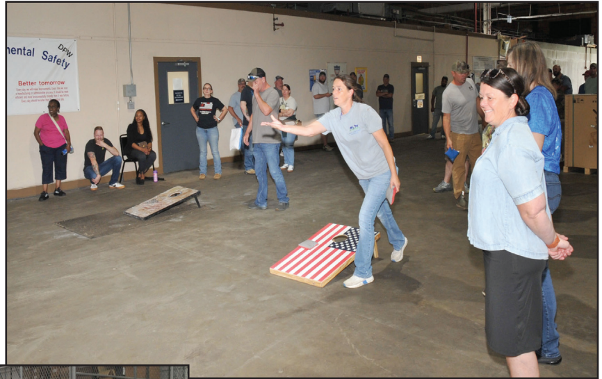
Several team building events including breakfasts and games were held around Pine Bluff Arsenal during Employee Appreciation Day June 17. From photo top left clockwise, the Directorate of Emergency Services, Directorate of Public Works, Directorate of Information Management and the Directorate of Resource Management all participated in some kind of activity during the morning.