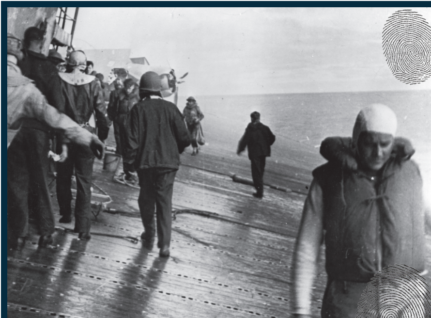
Listing deck of Yorktown, June 1942

With the salvage party which returned to the Yorktown, there was one Medical Officer and six hospital corps[men]. . . This group proceeded with attempts to identify the remains of those dead who were still on board and in the preparation of them for immediate burial. Thirty-five were found, and all but 10 were identified. Finger prints of all were obtained. These men were buried at sea after services [were] conducted by the Captain. When the torpedo attack occurred in mid-afternoon the identifications, finger prints, and valuables of these men, which had been placed on the hangar deck, all slid down the sloping deck and were lost over the side."