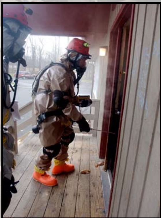
NYNG First Responders check the entrance of this building with Nuclear Biological Chemical detection equipment to ensure it is safe for personnel to enter.

"They [Rockland County HAZMAT] arrived on the scene and went down with meters confirming that there were multiple casualties