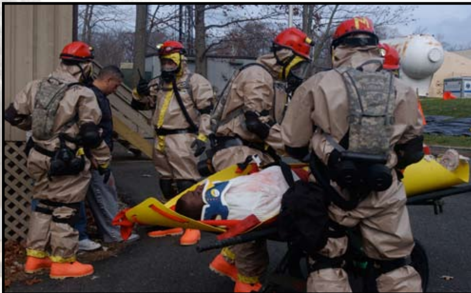
POMONA, NY--New York Army National Guardsmen practice evacuating the victim of a terrorist attack from a contaminated environment at the Rockland County Fire Training Center here on Saturday, Nov. 20. More than 400 members of the New York Army and Air National Guard, along with volunteers of the New York Guard, the state defense force participated in the weekend exercise along with civilian first responders.

More than 400 members of the New York Army and Air National