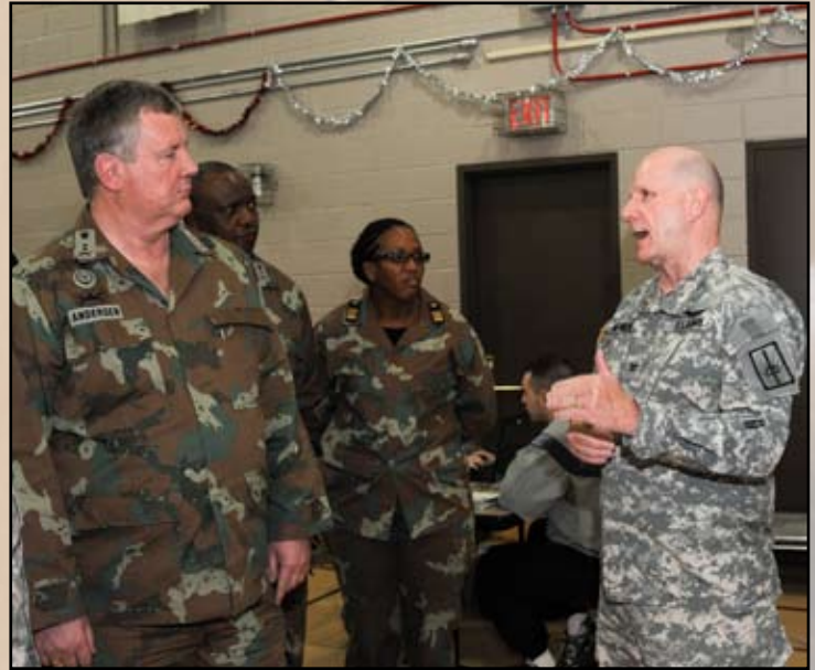
NYARNG Col. Craig Meinking explains NYARNG health check procedures to South African Major General Roy Andersen, the Chief of Defence Reserves for the South African National Defence Force. Representatives from the South African National Defense Forces-Reserve Forces visit the Division of Military and Naval Affairs during annual Soldier Readiness Processing December 4, 2010. The State Partnership Program is a National Guard initiative designed to grow relationships, enhance international security and promote the exchange of free ideas and open doors of cooperation in political, military, economic and social realms.

Any servicemember with glasses or contacts are sent to an extra station to get an exam to update their prescription.