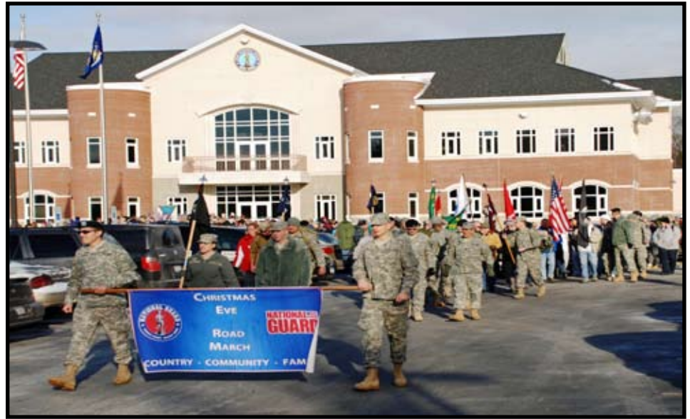
QUEENSBURY, NY-- More than 320 participants head out on the annual Christmas Eve Road March Friday morning Dec. 24