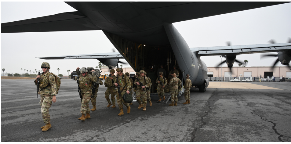
Texas Army National Guard Soldiers with the 72nd Infantry Brigade Combat Team and 71st Troop Command exit a Texas Air National Guard C-130J Super Hercules in McAllen, Texas Jan. 27. Aircrews with the 136th Airlift Wing, TXANG, transported nearly 200 troops down to the southern border in support of Operation Lone Star.