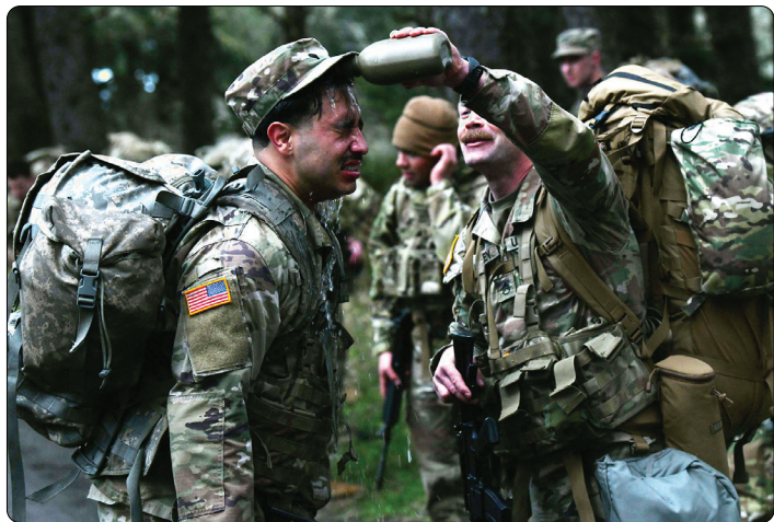
Oregon Army National Guard Soldiers recover from a tear gas attack during an afternoon ruck march after just completing the obstacle course event at Camp Rilea, near Warrenton, Oregon, on March 14, 2025.