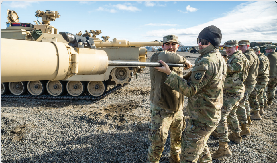
Tankers from Bravo Company, 3rd Battalion, 116th Cavalry Regiment, Oregon Army National Guard, conduct maintenance by cleaning the main gun tube of their M1A2 SEP v2 Abrams tank during an Inactive Duty Training weekend in Umatilla, Oregon, on Feb. 1, 2025.

Guard assumed responsibility for the center in 2017, aiming to create what officials describe as “the best training center in the Army National Guard.” For tank crews, the new course means more frequent training opportunities and better maintenance for their vehicles. “Part of getting our tanks back and increasing our operational readiness for our