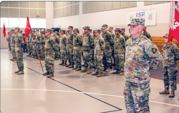
Soldiers from the Oregon National Guard’s 1249th Engineer Battalion stand in formation during a Change of Command Ceremony at the Anderson Readiness Center in Salem, Oregon, Sept. 8, 2024. The battalion is preparing for a year-long mobilization to support security operations along the southern border beginning October 2025.

The 1249th will serve as the command element for units from other state National Guards operating at the border. The mission, coordinated through the Department of Homeland Security in cooperation with the Department of Defense, requires the battalion to deploy personnel with expertise in operations, medical and behavioral health services, and contracting.