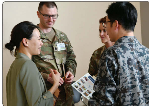
CDWG participants take part in a discussion following a trilateral working session attended by representatives of U.S. Indo-Pacific Command and delegations from Japan and the Republic of Korea on March 6, 2025.