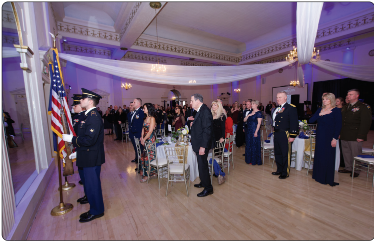
An Oregon Army National Guard Color Guard team posts the colors to start the 2025 Oregon National Guard Military Ball held at the Melody Event Center in Downtown Portland, Oregon, on the evening of Feb. 22, 2025

tonight is a celebration...chance to celebrate us. A time to reflect on our presence, catch up with old friends, and meet some new ones,” he said.