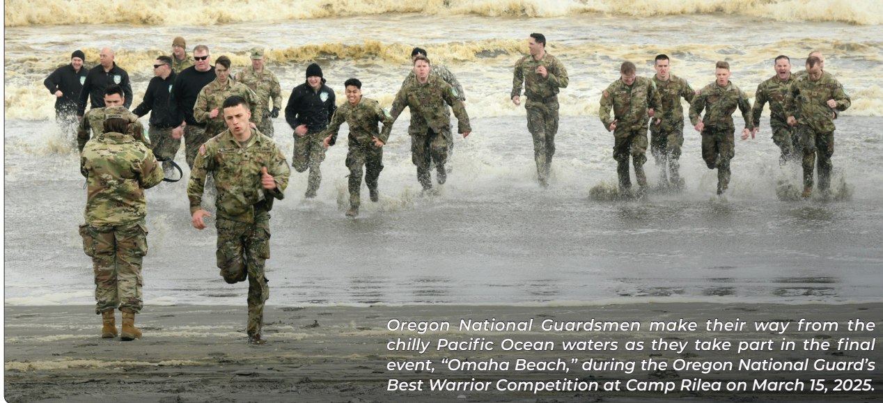
Oregon National Guardsmen make their way from the chilly Pacific Ocean waters as they take part in the final event, "Omaha Beach," during the Oregon National Guard's Best Warrior Competition at Camp Rilea on March 15, 2025.