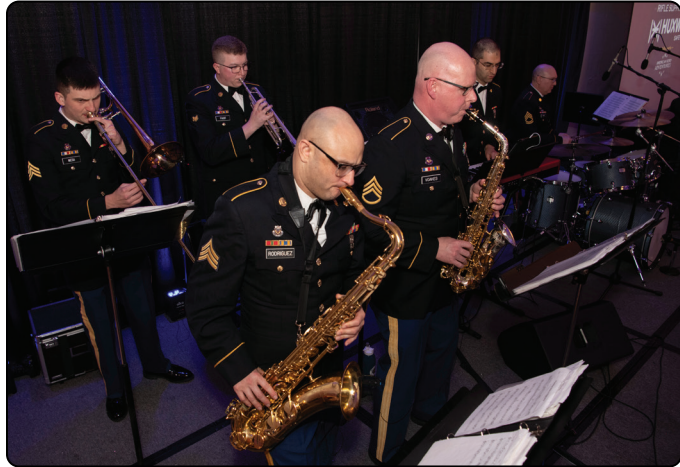
Members of ‘45 Away’, a group of musicians from the 234th Army Band, play cover songs from the 1970s and 80s during the 2025 Oregon National Guard Military Ball held at the Melody Event Center in Downtown Portland, Oregon, on February 22, 2025.