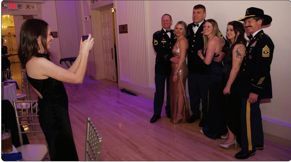
Oregon Guard members spend time enjoying an evening of dinner, music, dance, and camaraderie during the annual Military Ball and pause for a photograph at the Melody Event Center.

“The focus of this year’s ball was to make it one of our key social events for the year – where all of our members, including currently serving members, retirees, and our civilian workforce could gather for one evening,” he said. “With music and good food... this gives everyone a chance to interact with their leaders and co-workers in a comfortable and fun atmosphere.”