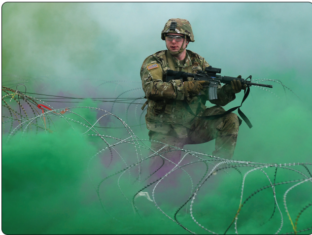
Oregon Army National Guard Soldiers and Airmen take part in the Mogadishu Challenge event at the urban training village at Camp Rilea, near Warrenton, Oregon, on March 15, 2025.

Service members compete in two categories: enlisted Soldiers [E-4 and below] and noncommissioned officers [E-5 to E-7]. Each participant must outperform their peers at the unit level before advancing to the state-level Best Warrior Competition. The overall event reflects the unpredictable nature of a real-world battlefield, as contestants move from station to station without a published schedule. The first day concluded late after a series of fitness tests, a 50-question exam, a written essay, and individual Soldier/Airman boards.