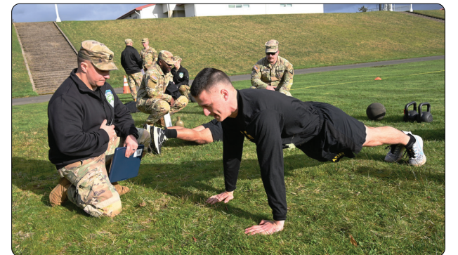
Oregon National Guard service members participate in the Army Combat Fitness Test on March 13, which assesses Soldiers' physical fitness as part of the 2025 Oregon National Guard Best Warrior Competition at Camp Rilea.