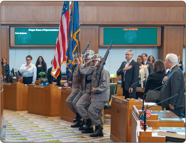
Cadets from the Oregon Youth ChalleNGe Program present the colors in the Oregon State House chamber at the State Capitol on Tuesday, March 18, 2025. The color guard ceremony opened the day’s legislative session for state representatives.