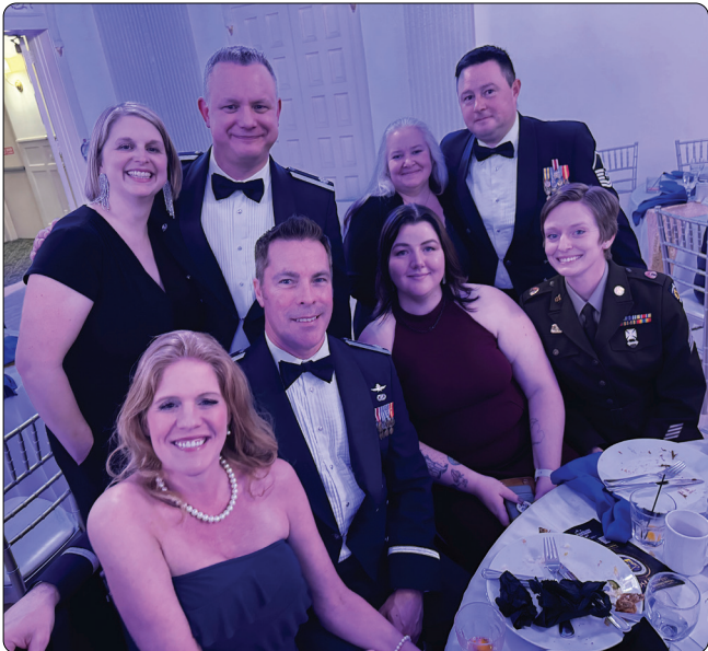
Oregon National Guard members spend time enjoying an evening of dinner, music, dance, and camaraderie during the Oregon National Guard Military Ball, pause for a photograph at the Melody Event Center in Portland, Oregon, on Feb. 22, 2025. The annual Military Ball allows military members and their spouses to enjoy a formal evening to relax, rekindle connections, and make new acquaintances.