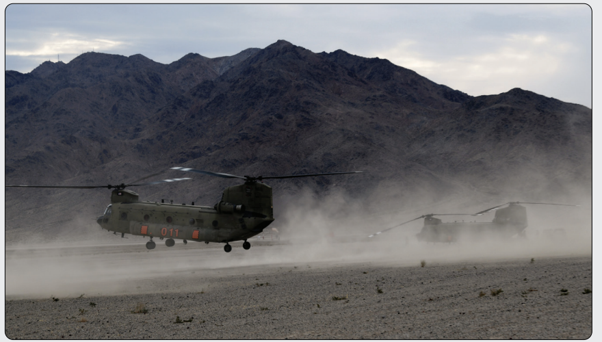
Four Oregon Army National Guard CH-47F Chinook helicopters load up soldiers from the 82nd Airborne Division's Combat Aviation Brigade as they take off for a morning flight on March 11, 2025, at Fort Irwin, California. The five-day training allowed ORARNG crews a chance to provide heavy lift support to the Army Futures Command.

The training they have received during this exercise has been valuable in that they have been delivering actual cargo and not having to simulate certain aspects of the training mission. The crew gets to experience the weight and all the other aspects of lifting cargo and passengers to infill Landing Zone positions all around different locations inside the training center.