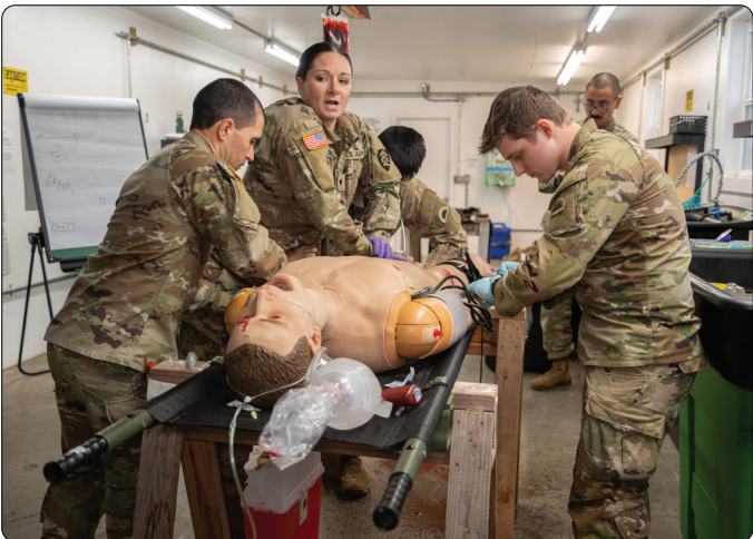
Oregon Army National Guardsmen perform medical treatment on simulated casualties during a field training exercise on Jan. 30, 2025.