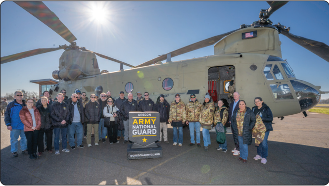
Local education and community leaders stand in front of a CH-47 Chinook helicopter during an Employer Support of the Guard and Reserve (ESGR) Boss Lift event at Aurora Airport, Oregon, Feb. 28, 2025.