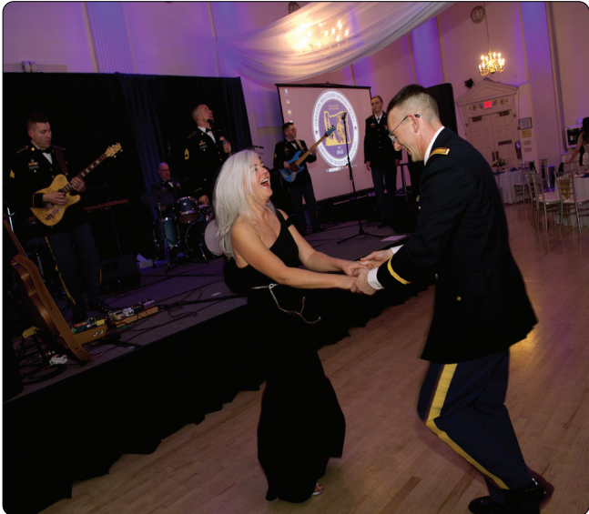
Couples enjoy the music of the 234th Army Band during the annual Oregon National Guard Military Ball held in Downtown Portland on Feb. 22, 2025. The Military Ball allows military members and their spouses to enjoy a formal evening to relax, rekindle connections, and make new acquaintances.