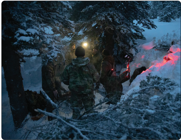
Oregon Army National Guard Soldiers with 3rd Battalion, 116th Cavalry Regiment, conduct cold weather survival training into the night at Swampy Lakes Sno-Park, Bend, Oregon, on Jan. 4, 2025.

The two-day drill weekend had a dual mission: apply skills to survive the night while hosting thirteen volunteers with the ‘Guard For A Day’ program. The GFAD program allows people interested in the guard the opportunity to shadow service members before officially enlisting in the military.