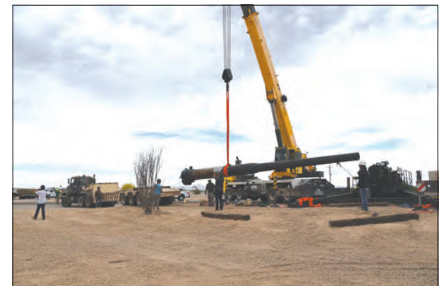
On April 14, crews removed the second M1 240mm howitzer that has stood since 1963 at the corner of Highway 95 and Imperial Dam Road.