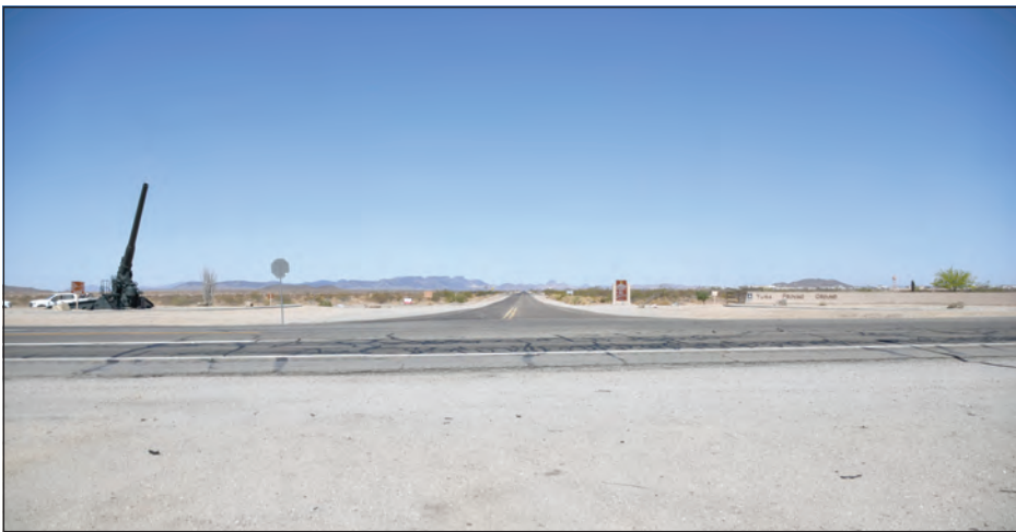
Motorists driving along Highway 95 may notice something is missing. Crew temporarily moved Yuma Proving Ground's (YPG) iconic Big Guns to make way for road improvements.