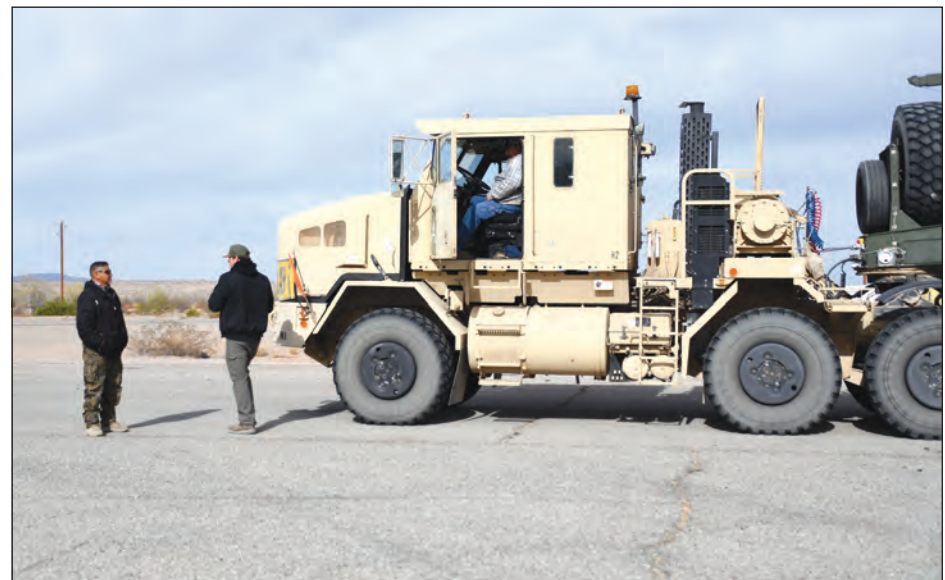
Test Vehicle Operators Clayton Wall and Jaime Quinones each hold more than 25 licenses. Each Test Vehicle Operator is trained specifically for the vehicle by the manufacturer and must get a license for each type of vehicle they operate.

it passes it goes to the Solider. So, we know we are doing something for the Soldiers. It's safe for them to use," remarked Quinones.