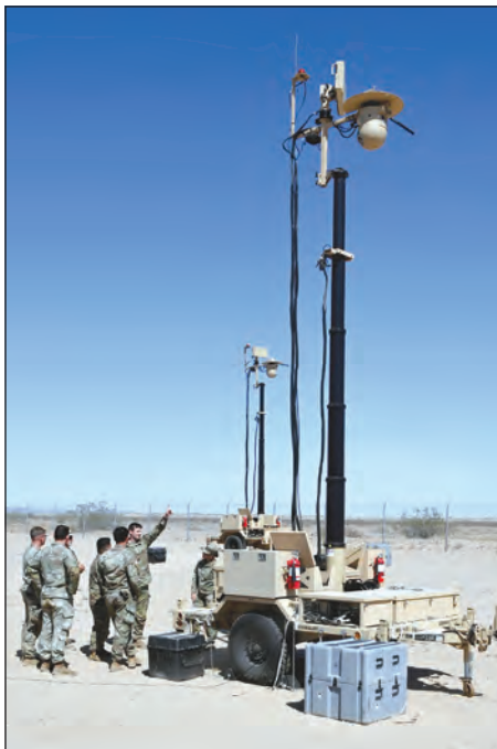
The Ground Based Operational Surveillance System (Expeditionary) is a multi-spectral sensor and persistent surveillance system that underwent developmental testing at Yuma Proving Ground in years past.