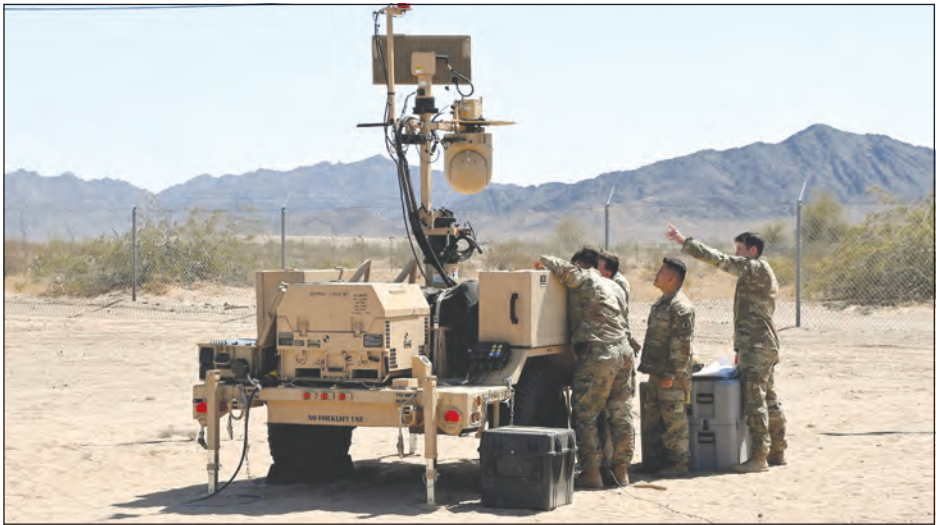
Yuma Proving Ground’s Training and Exercise Management Office is facilitating training for Soldiers involved in Joint Task Force Southern Border. Here, Soldiers from the 759th Military Police Battalion at Fort Carson, Colo. train on the Ground Based Operational Surveillance System (Expeditionary).