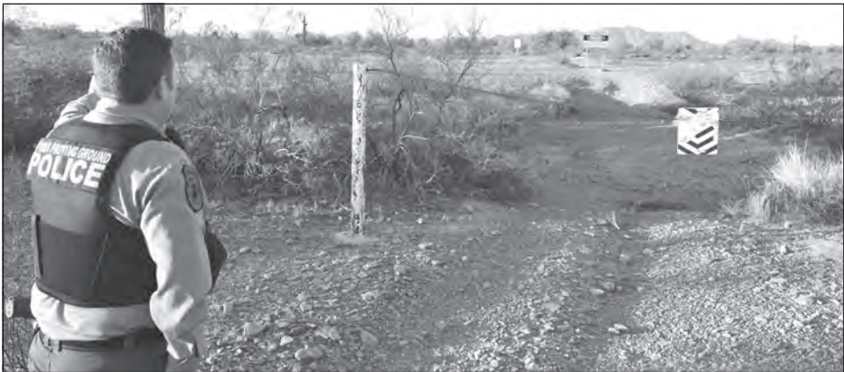
Beginning May 1, 2025, the Yuma Proving Ground (YPG) Police will issue Central Violations Bureau citations, which have financial penalties associated with them. This means additional consequences for people cited for speeding, illegal dumping, or trespassing on YPG’s test ranges.

Individuals cited for a traffic infraction on post still face the possibility of their on-post driving privileges being suspended or revoked by the YPG commander in