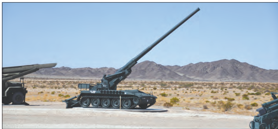
Crews moved the Big Gun formerly on the north side of Imperial Dam Road to the Wahner Brooks Historical Exhibit, which is accessible to the public outside of YPG's Visitor Control Center.

The Arizona Department of Transportation plans to start the project in the fall of 2025 and estimates it will take 14 months to complete. The cannon is expected to return to prominent display once road construction is complete.