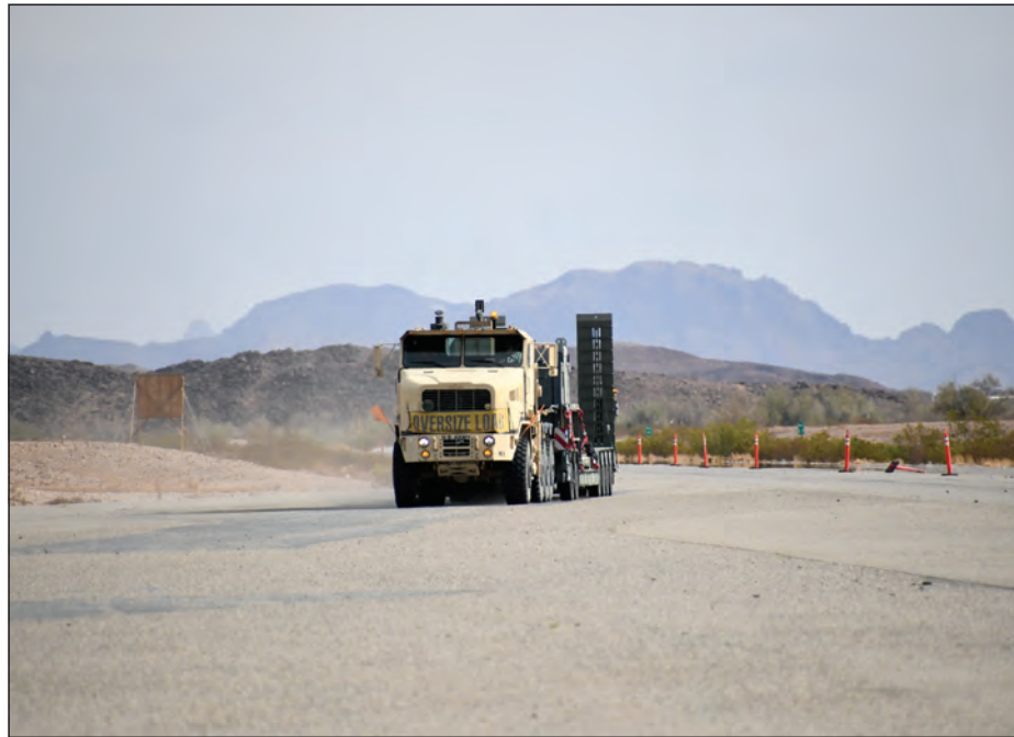
One method used to assess the capability of combat vehicles is to drive them, and that is the mission of the Test Vehicle Operators (TVOs). TVOs drive the vehicles on paved, sand and gravel courses. There are steep elevations, washboard roads, potholes and bumps. They drive through sand slopes, dust and mud courses, and roads with vertical steps and gaps. They perform braking, acceleration, steering and handling tests, and evasive maneuvers.

The term drive is used lightly, as these are not casual drives on regular roads. YTC Test Vehicle Operators drive the vehicles on paved, sand and gravel courses. There are steep elevations, washboard roads, potholes and bumps. They drive through sand slopes, dust and mud courses, and roads with vertical steps and gaps. They perform braking, acceleration, steering and handling tests, and evasive maneuvers. Engineers need