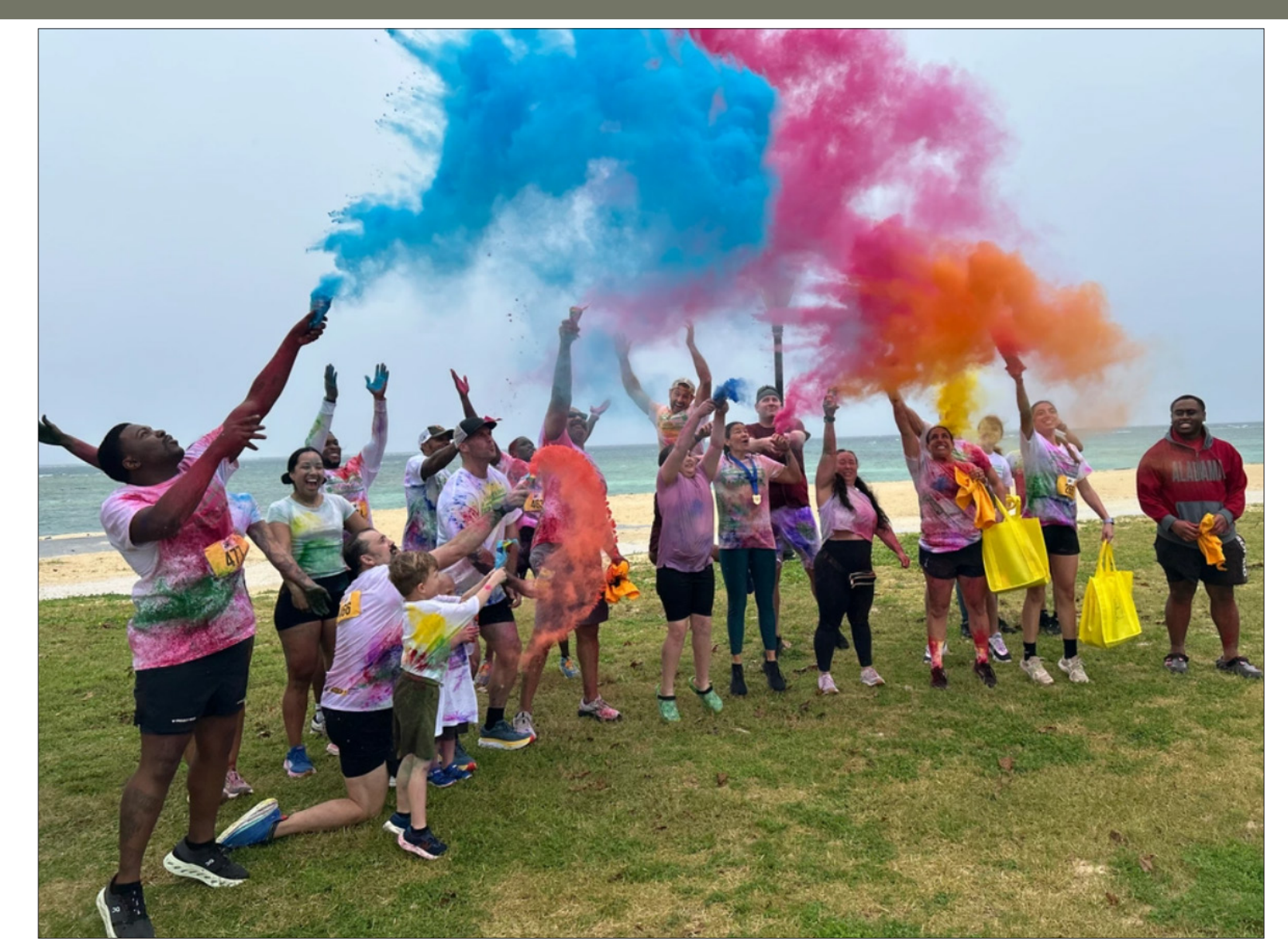
U.S. Army Garrison Okinawa Kicks Off Army Emergency Relief Campaign With Color Run

OKINAWA, Japan—Runners and walkers celebrated after braving rainy weather to take part in the Army Emergency Relief 5K Color Run at Torii Station, Okinawa, Japan, on March 15. The race provided an opportunity for participants to enjoy a colorful experience while raising awareness for AER. The annual AER campaign focuses on informing the Army community about available emergency financial assistance and resources.