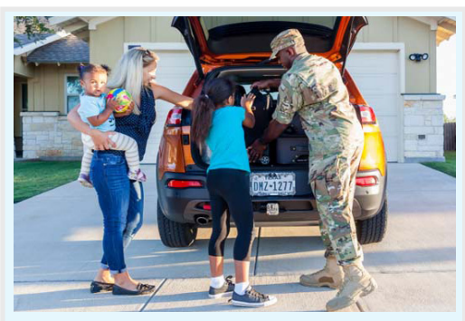
Army Support for Special Moves

More information is available for Soldiers and Families on the Directorate of Prevention, Resilience and Readiness website at Programs and Capabilities.