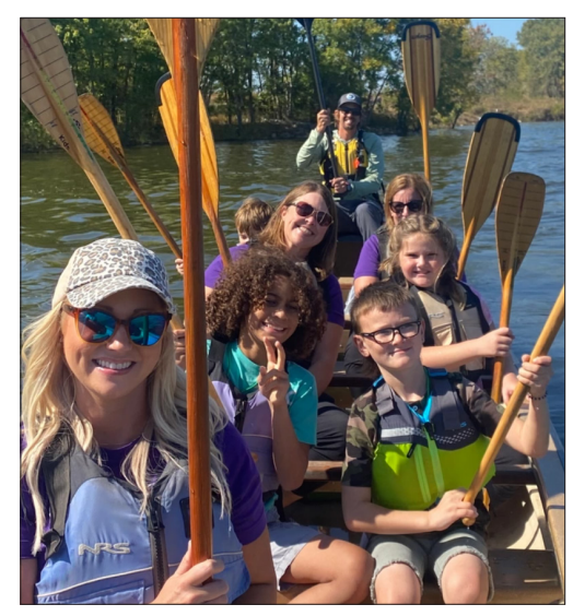
Army Morale, Welfare and Recreation supports quality of life and readiness by providing recreational resources and activities to the Army community.

Activities offered through MWR aim to strengthen the community by helping to reduce risk factors for harmful behaviors. Risk reduction often involves