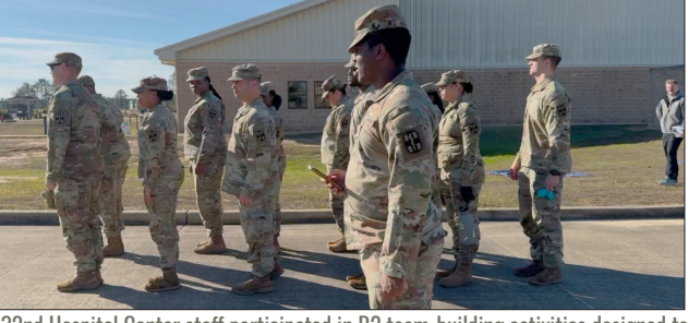
32nd Hospital Center staff participated in R2 team-building activities designed to improve communication and overcome operational challenges.

"You can increase your sense of confidence and self-efficacy by being on the same team as someone who is more experienced and successful," she said.