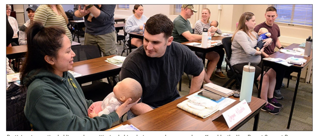
Participants practice holding and repositioning babies during a newborn care class offered by the New Parent Support Program.

The program is available regardless of rank or service branch, meaning that Soldiers of all backgrounds can benefit from this important support system. The NPSP is designed to provide free resources, from pregnancy through the early years of a child's life, ensuring that Families have the guidance they need during this transformative time. Since military Families often face financial constraints, especially when one parent may be on parental leave or on