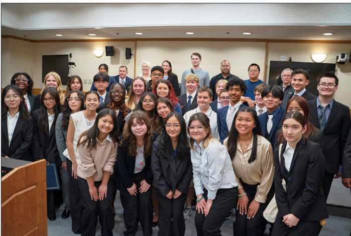
High School participants pose alongside their attorney coaches and advisors marking the end of the 2025 Mock Trial competition.