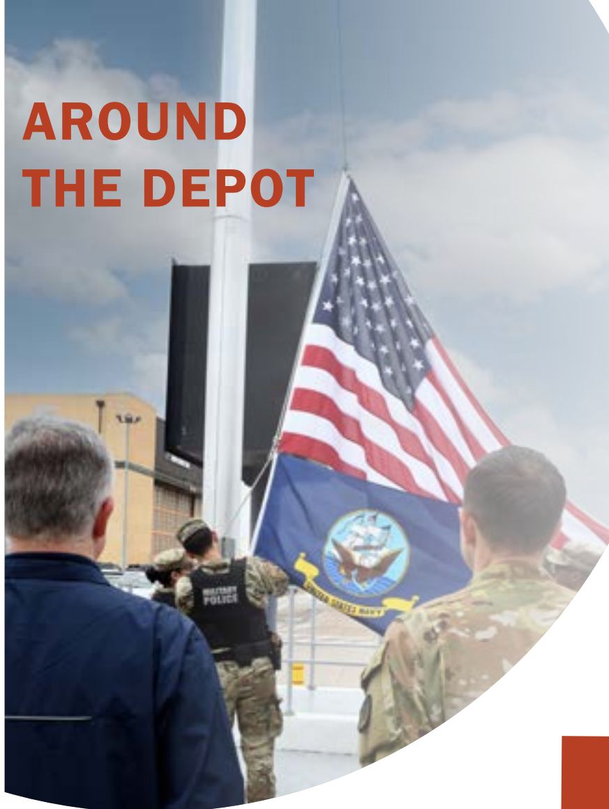
Above: Due the outcome of the Army/Navy football, the Depot made good on friendly agreement by raising the Navy flag at CCAD headquarters for 24 hours.

W e are the most formidable military and most deadly combat force the world has ever seen because of our solidarity and common goal with other Army organizations and our sister services.