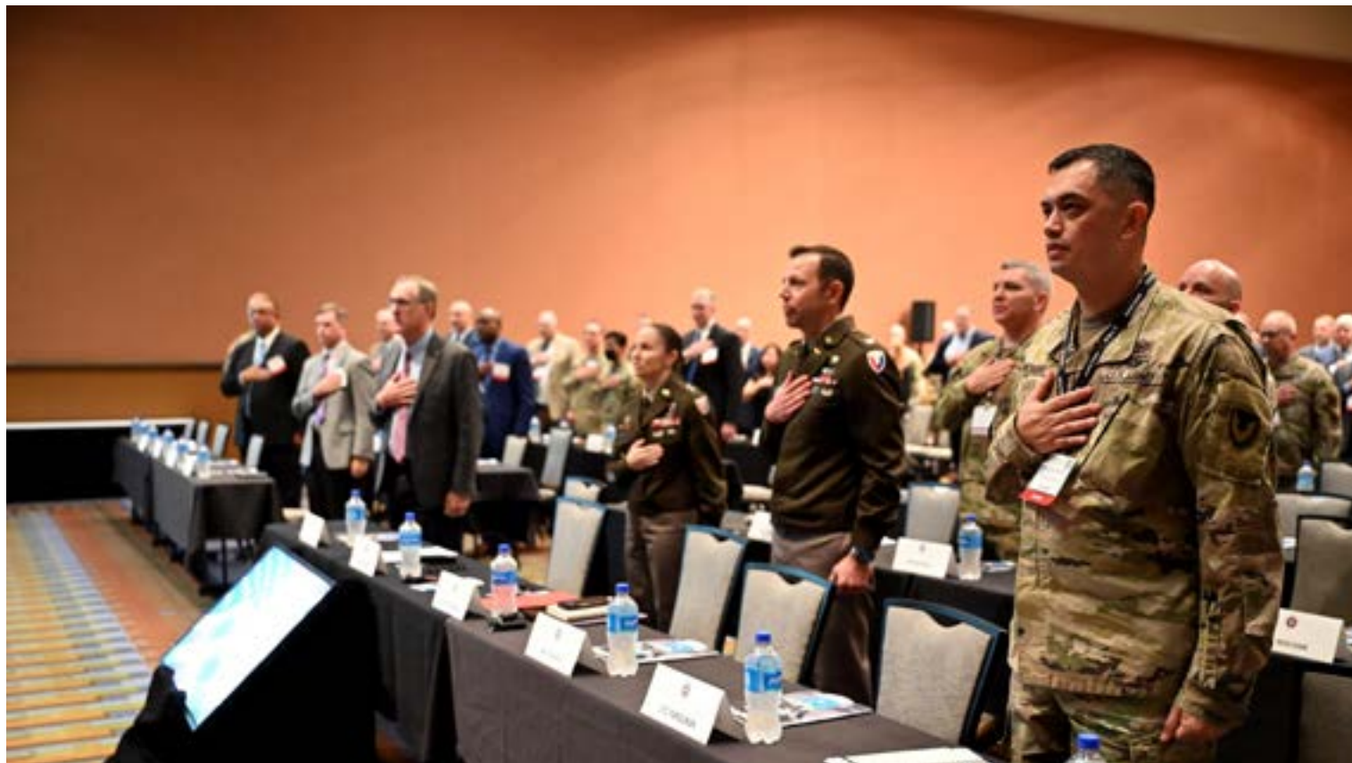
The forum started with the Pledge of Allegiance

at CCAD. Each of you play an essential role in keeping our military strong and our nation is safer because of your work for over 60 years, CCAD has answered the nation's call, ensuring that when our soldiers need aircraft, they're ready for the fight,"