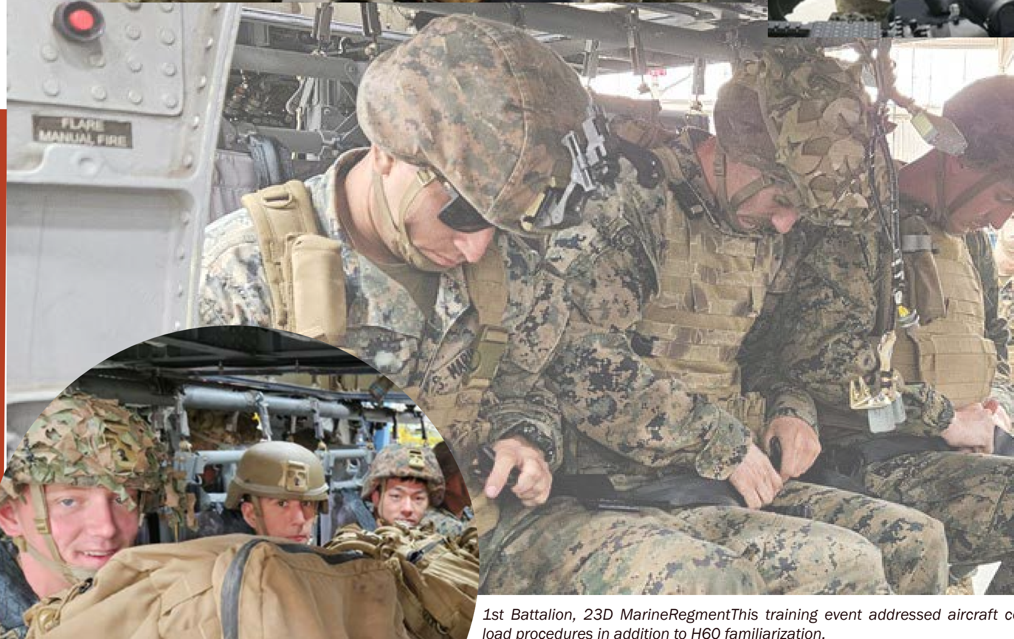
1st Battalion, 23D MarineRegmentThis training event addressed aircraft cold load procedures in addition to H60 familiarization.