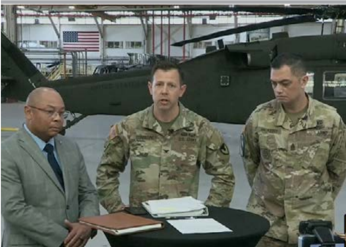
The C-Suite during a virtual 'ADDRESS TO THE WORKFORCE'.