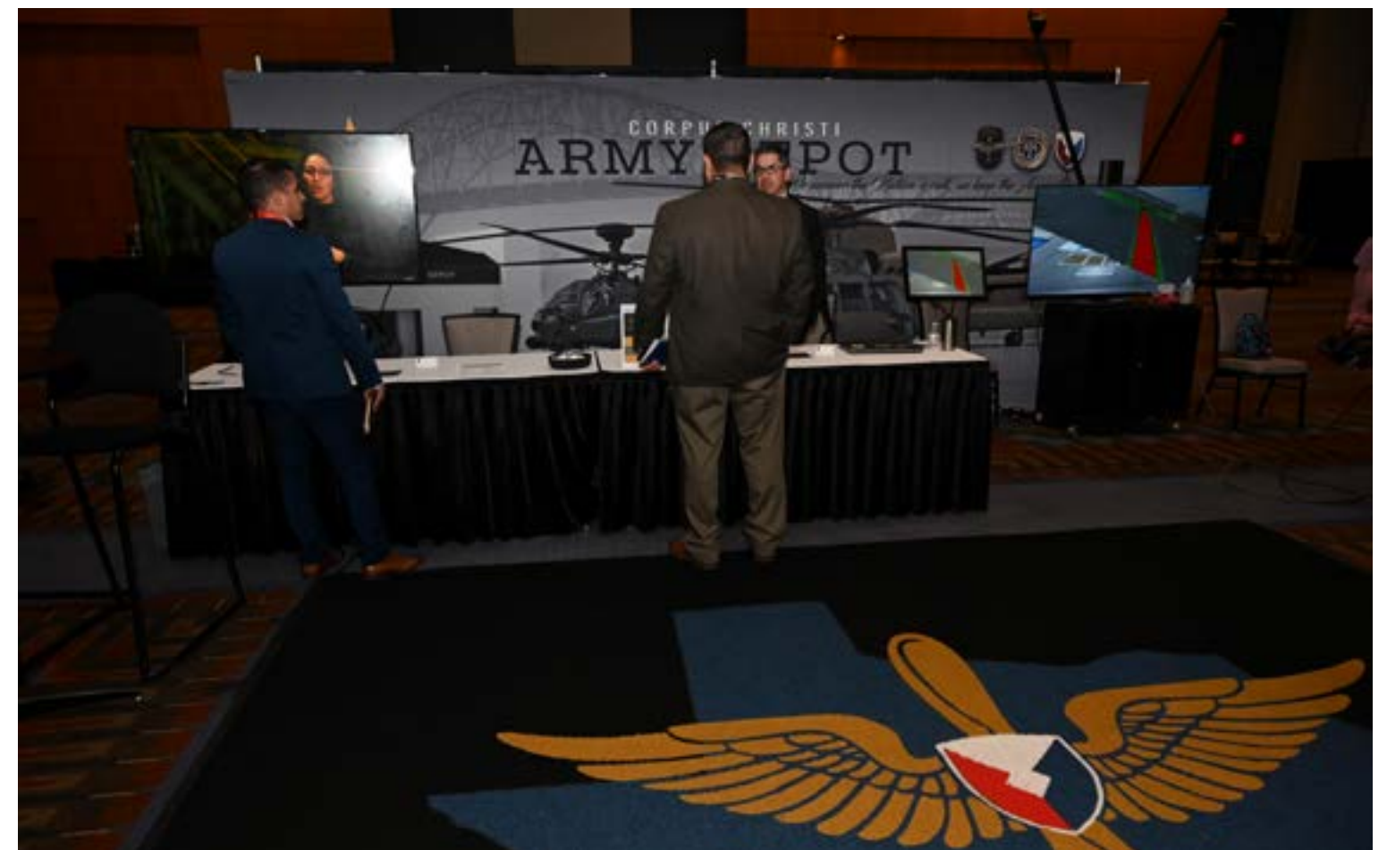
CCADers from various directorates manned the CCAD booth talking with attendees

The concluding panel discussion centered on the need for additional parts to sustain the enduring fleet, alongside the aspiration for open-source software to combine data from sources such as the logistics modernization program.