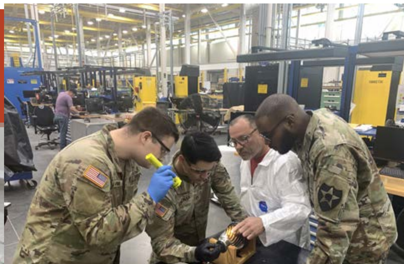
2nd Combat Aviation Brigade engage in valuable training at the depot.

W e are the most formidable military and most deadly combat force the world has ever seen because of our solidarity and common goal with other Army organizations and our sister services.