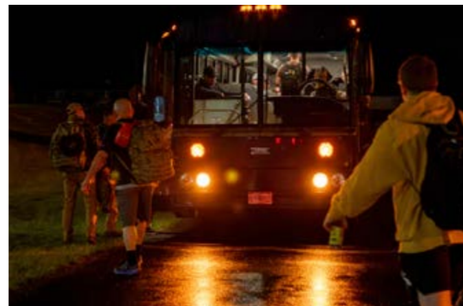
167th Airlift Wing Airmen board a bus at the Martinsburg, West Virginia unit, April 4, 2025. The Airmen were departing Shepherd Field for a six-month overseas deployment. Approximately 130 167th AW Airmen are deploying in several to overseas locations this spring.