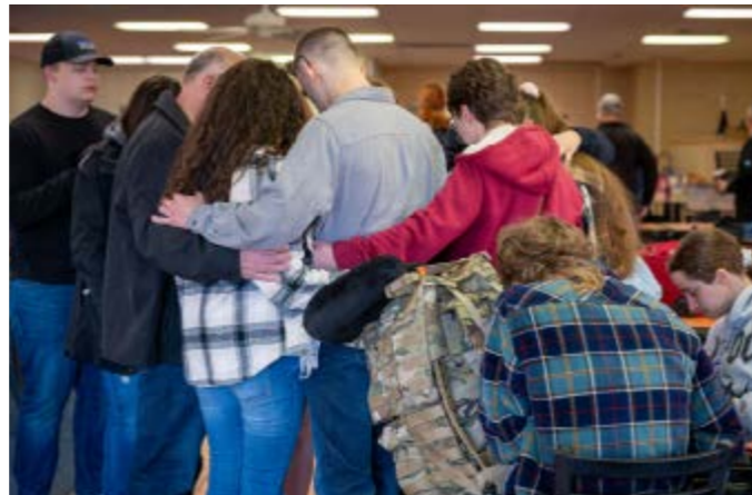
Family and friends of a deploying 167th Airlift Wing member gather for a prayer before his departure from Shepherd Field, Martinsburg, West Virginia, March 23, 2025. Approximately 130 167th AW Airmen are deploying to overseas locations this spring.

The Air Force's new deployment construct, Air Force Force Generation (AFFORGEN), offers a more structured and predictable deployment cycle, with the goal of ensuring long-term sustainable readiness for the high-end fight. 🐾