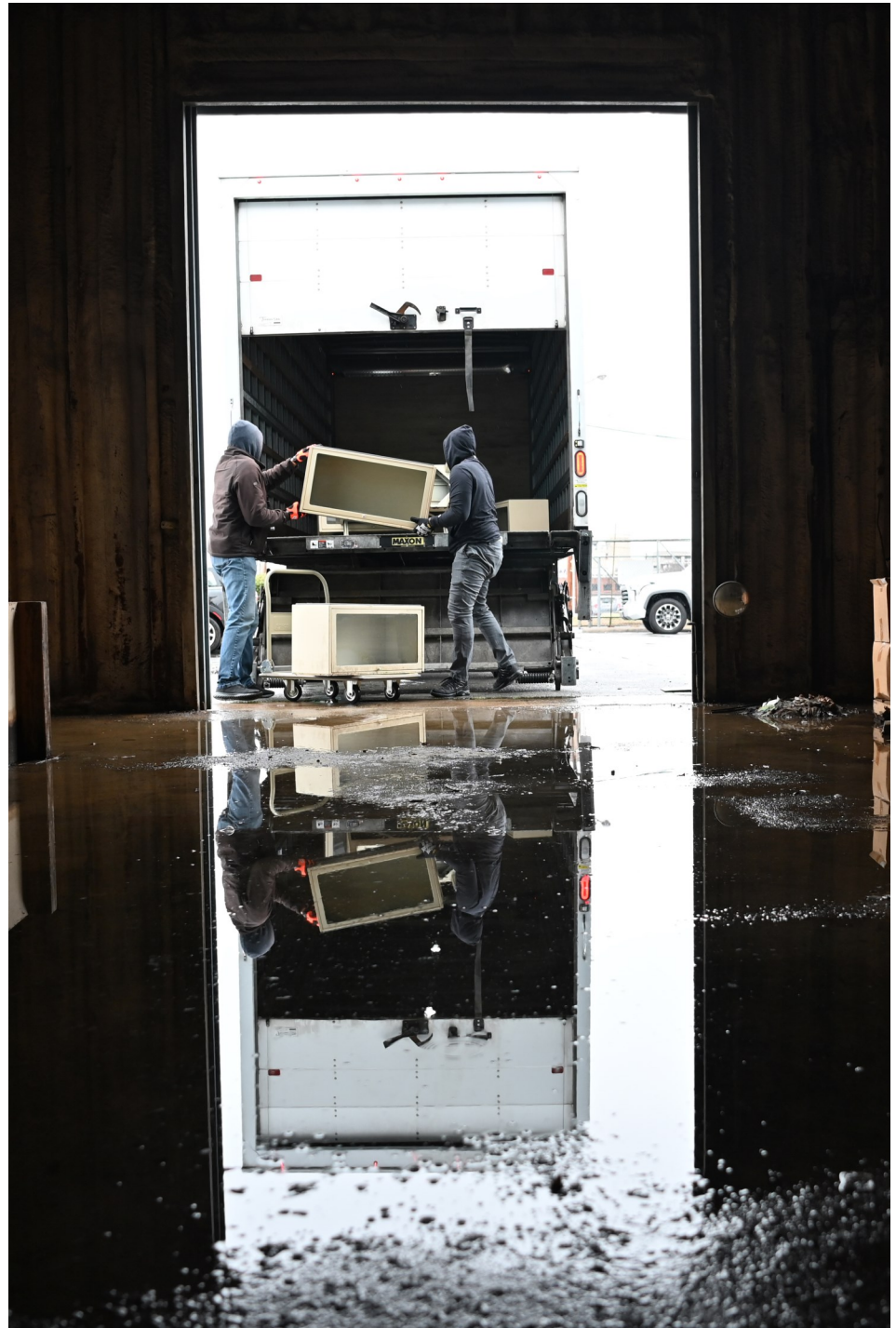
The Little Rock District logistics team removes excess property from a flooded warehouse.

"We are close knit here in the office. I enjoy assisting and helping people in our district with property accountability. I