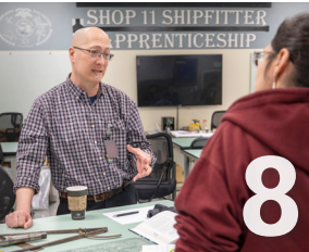
8 Knowledge Fair helps highlight apprenticeships