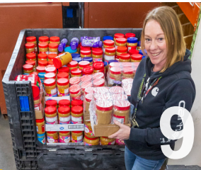
9 Friendly competition helps feed local families

A Code 700, Lifting and Handling, team conducts load testing on shipyard floating crane YD-259 along Pier 3 at PSNS & IMF, March 13-14, 2025.