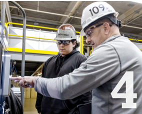
4 New IT initiative aims to ease electronics access