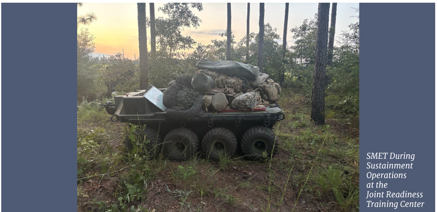
SMET During Sustainment Operations at the Joint Readiness Training Center