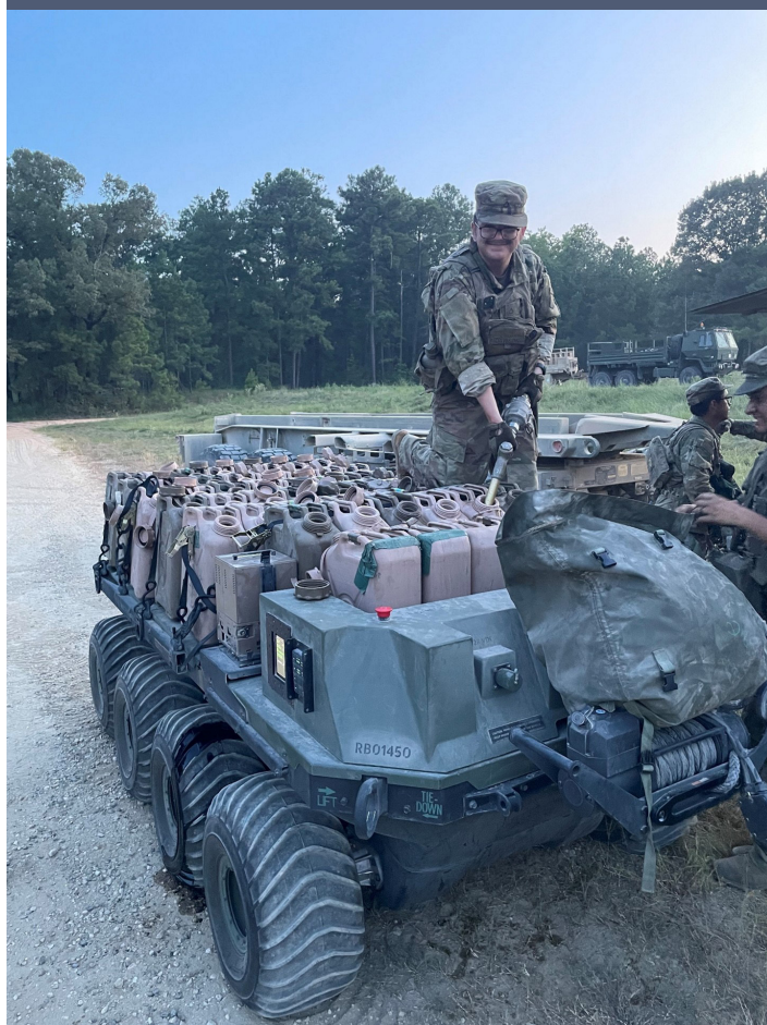
SMET During Sustainment Operations at the Joint Readiness Training Center