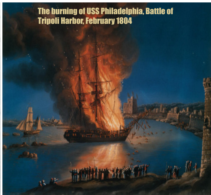
The burning of USS Philadelphia, Battle of Tripoli Harbor, February 1804