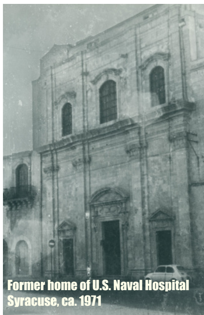
Former home of U.S. Naval Hospital Syracuse, ca. 1971