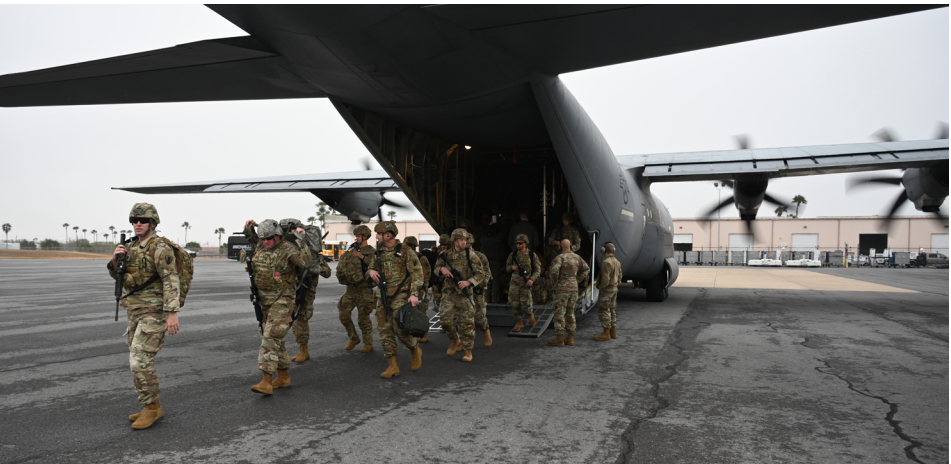
Texas Army National Guard Soldiers from the 72nd Infantry Brigade Combat Team and 71st Troop Command exit a Texas Air National Guard C-130J Super Hercules at McAllen International Airport, Jan. 27. Aircrews from the 136th Airlift Wing, TXANG, transported nearly 200 troops down to the southern border in support of Operation Lone Star.

The acting secretary of defense has directed the National Guard Bureau to provide immediate support for presidential executive orders on protecting the territorial integrity of the United States. In support of U.S. Northern Command, the Department of Defense’s operational lead, the National Guard is “Always Ready, Always There” and is urgently working to fully accomplish the objectives of the presidential executive orders.