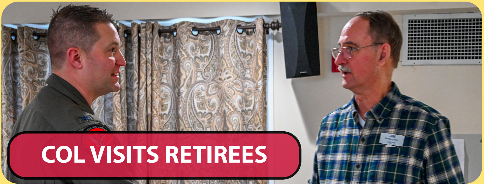
COL VISITS RETIREES