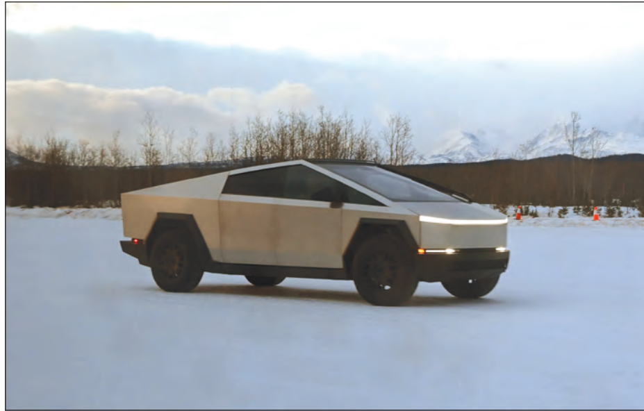
Arctic Regions Test Center, located at Fort Greely, Alaska, has conducted rigorous tests of the Stryker combat vehicle and M109A7 Paladin self-propelled howitzer, both of which utilized ARTC's Mobility Test Complex as part of their testing. ARTC's automotive test track also accommodates multiple customers from private industry, something it has done since its start in 2004.

Among other platforms, the test center, located at Fort Greely, Alaska, has conducted rigorous tests of the Stryker combat vehicle and M109A7 Paladin self-propelled howitzer, both of which utilized ARTC's Mobility Test Complex as part of their testing. Concurrent with this military testing, ARTC's automotive test track accommodates multiple customers