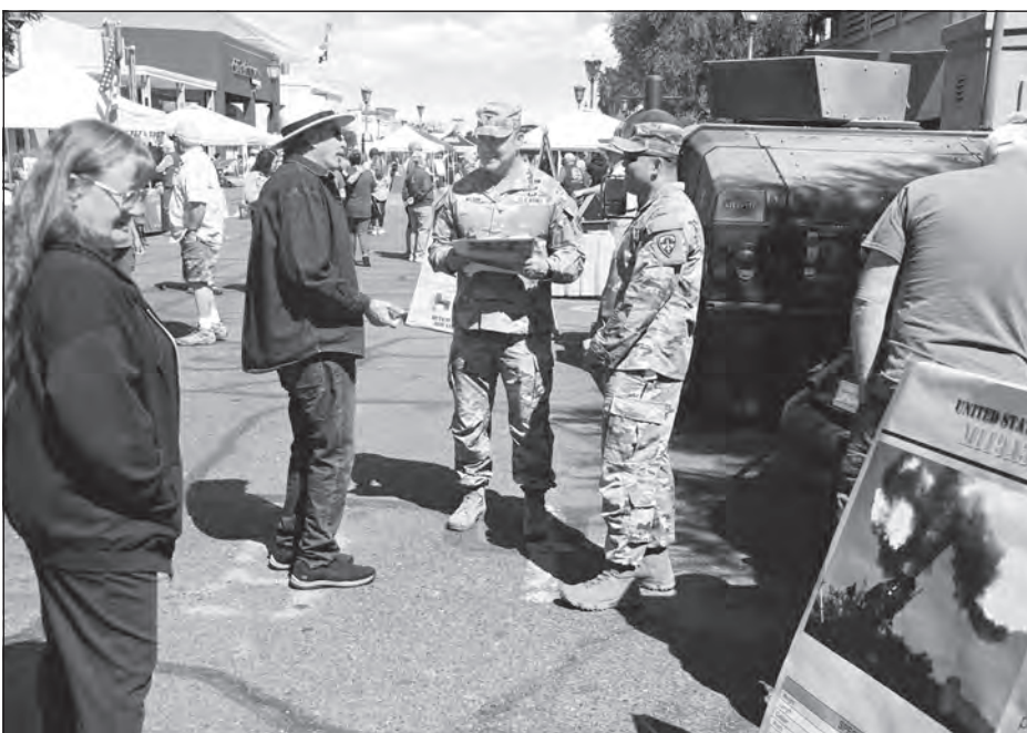
During Military Appreciation Day (MAD) in Downtown Yuma, event goers will have the opportunity to meet YPG's leaders and Airborne Test Force Soldiers, learn about its mission and check out static displays as shown in this photo from 2024.

Community members can also mark their calendar for June 14, 2025, when the U.S. Army celebrates its 250th Birthday. More details of that event will be released as plans are set.