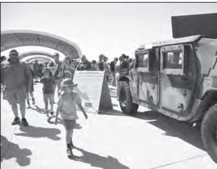
U.S. Army Proving Ground's display at the MCAS-Yuma Airshow includes static displays and Soldiers with the Airborne Test Force as shown in these photos from the 2024 event.