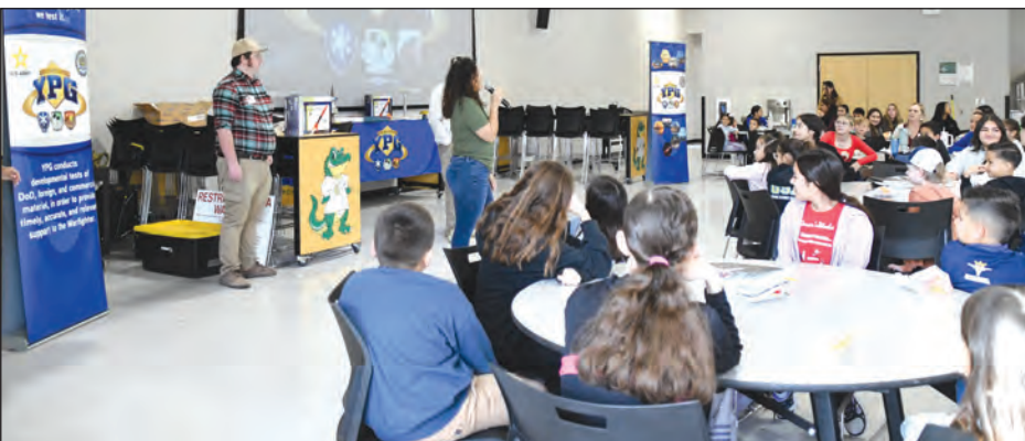
Members of Yuma Proving Ground's S1 Workforce Development team and engineers visited Gowan Science Academy, on the morning of Feb. 11, 2025, to talk rockets. YPG puts emphasis on reaching out to students and teaching them about YPG's mission and exposing them to the world of science, technology, engineering and mathematics in hopes they choose a career in STEM.