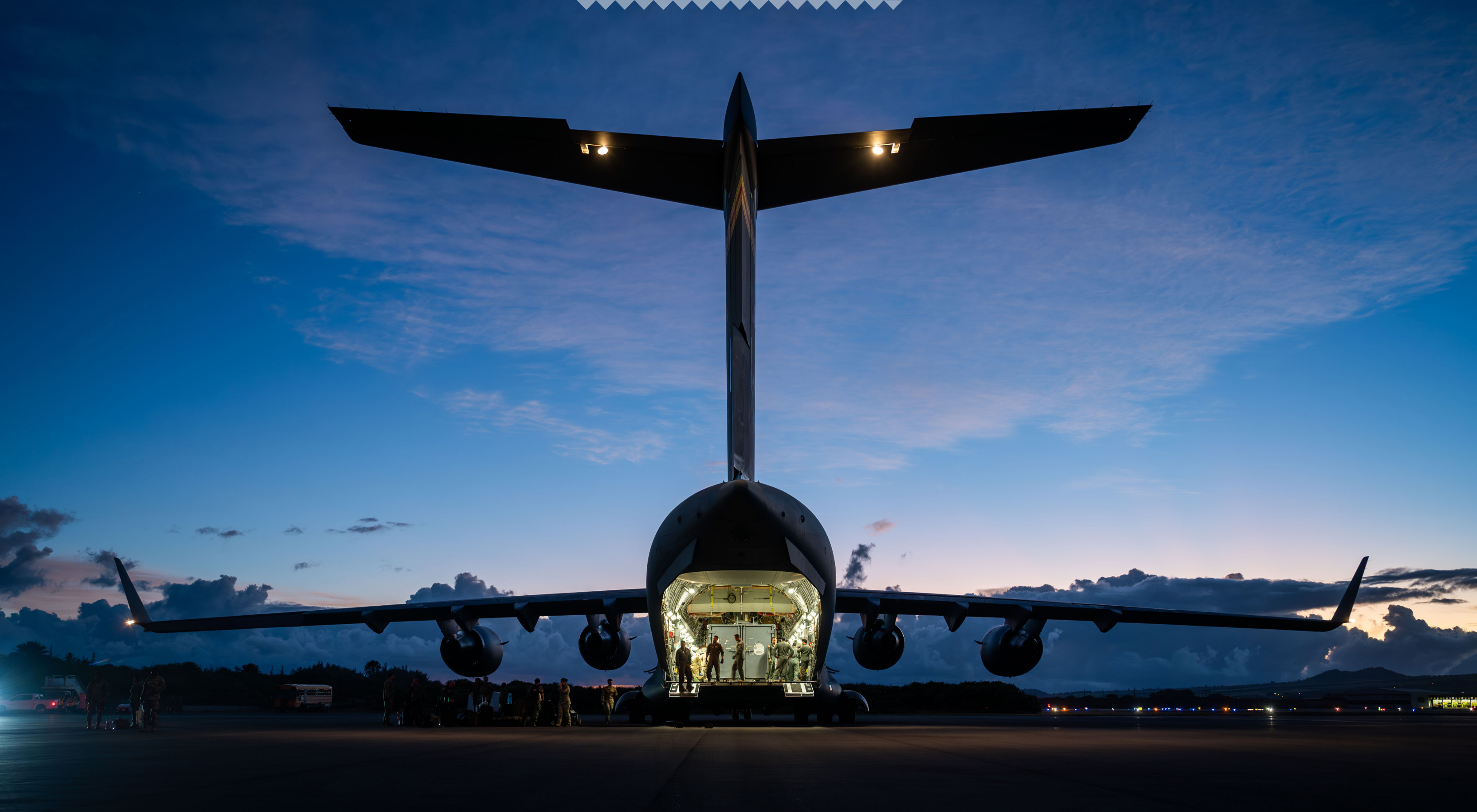
U.S. Airmen from the 15th Wing and Hawaii Air National Guard, unload equipment from a U.S. Air Force C-17 Globemaster III during the Joint Pacific Multinational Readiness Center (JPMRC) exercise at Kahului Airport, Hawaii Oct. 5, 2024.