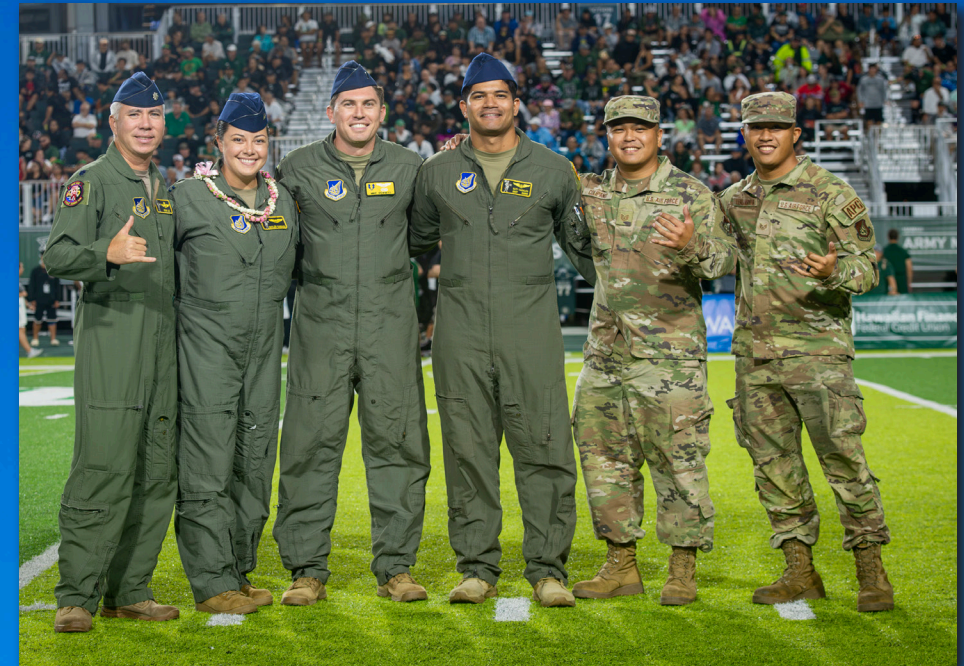
Aircrew from the 203rd Air Refueling Squadron and maintainers from the 154th Aircraft Maintenance Squadron gathered at Aloha Stadium after their flyover, joining the community to honor Veterans of the U.S. Armed Forces.