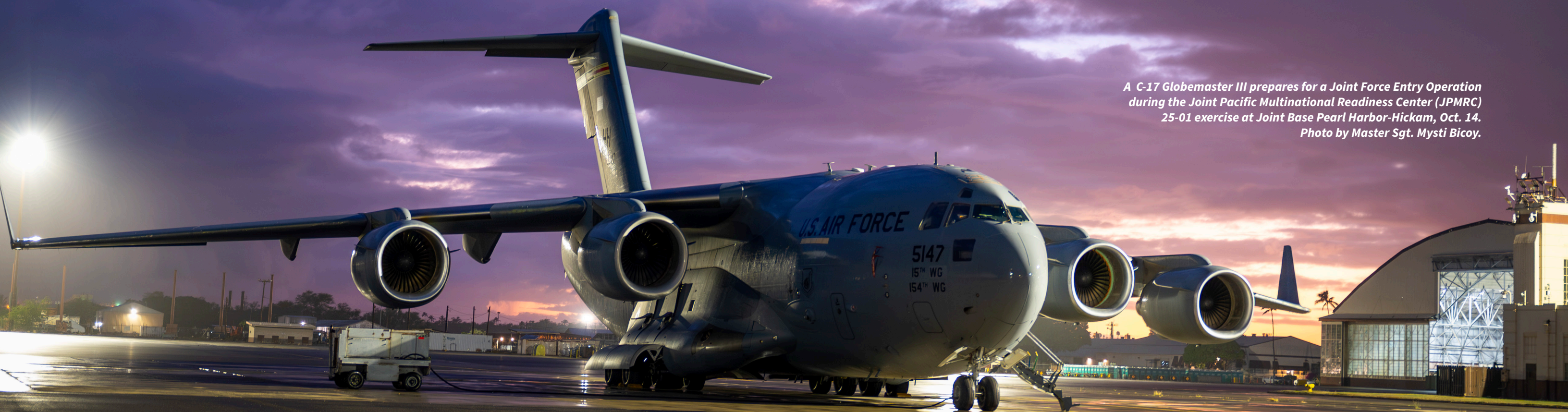
A C-17 Globemaster III prepares for a Joint Force Entry Operation during the Joint Pacific Multinational Readiness Center (JPMRC) 25-01 exercise at Joint Base Pearl Harbor-Hickam, Oct. 14.