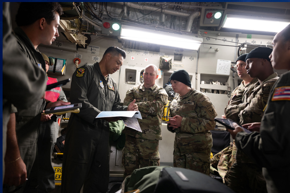
U.S. Air National Guard Aircrew from the 204th Airlift Squadron plan an airdrop mission with U.S. Army Soldiers from the 2nd Infantry Brigade, 11th Airborne Division onboard an Air Force C-17 Globemaster III during the Joint Pacific Multinational Readiness Center (JPMRC) exercise at Joint Base Elmendorf-Richardson, Alaska Oct. 6, 2024.