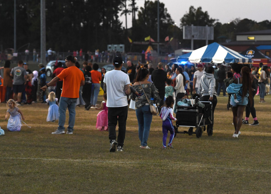
(Above) Families arrive at the Youth Services Sports Complex, Oct. 25 for the Child and Youth Services Fall Festival. More than 1,600 members of the Fort Jackson community attended the event.