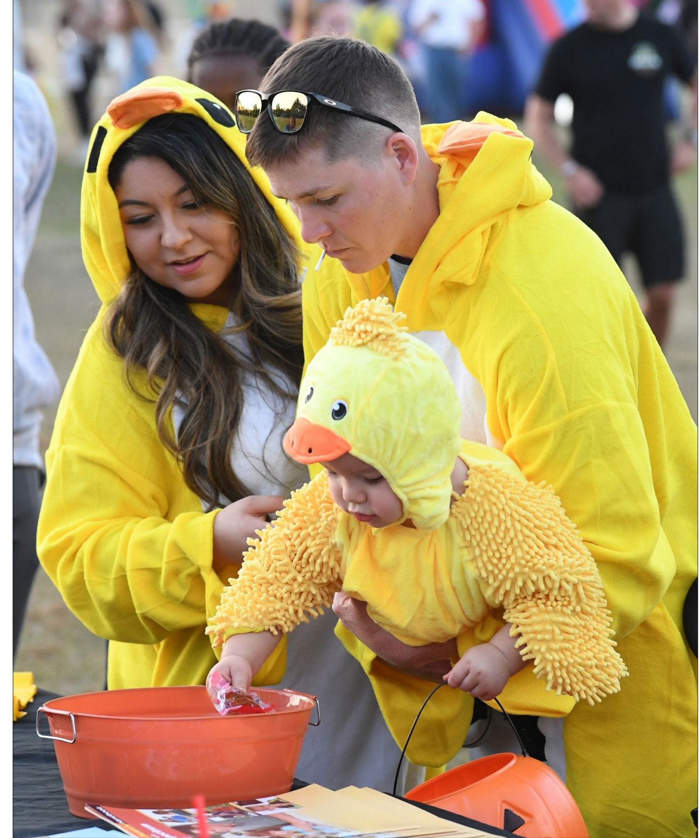
Festival patrons reach out to get treats during the Child and Youth Services Fall Festival, Oct. 25.