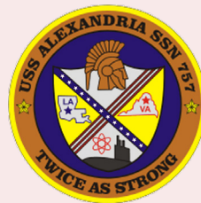
USS Alexandria (SSN 757)