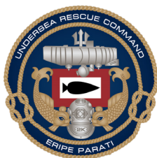
Undersea Rescue Command (URC)