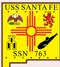
USS Santa Fe (SSN 763)