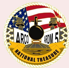
Floating Dry Dock ARCO (ARDM 5)