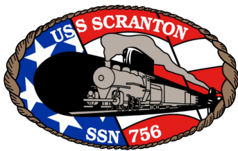
USS Scranton (SSN 756)