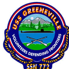
USS Greenville (SSN 772)