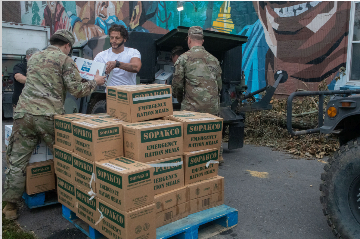
U.S. Army soldiers with the 130th Maneuver Enhancement Brigade and 113th Sustainment Brigade deliver meals and water to the Western Carolina Rescue Ministries in Asheville, North Carolina, Oct. 3, 2024. The North Carolina National Guard deploys military capabilities in support of State authorities in order to protect the lives and properties of fellow Citizens.