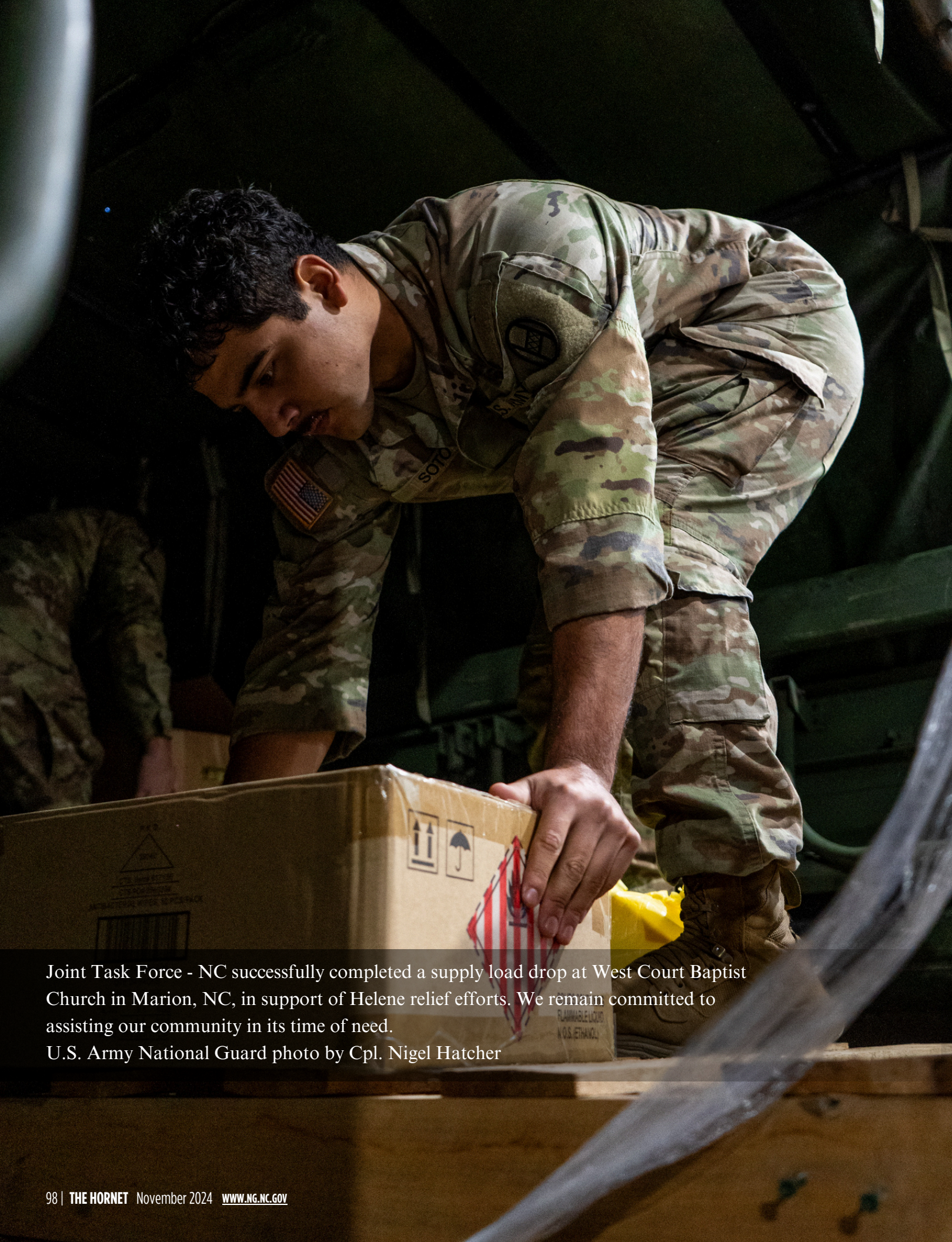
Joint Task Force - NC successfully completed a supply load drop at West Court Baptist Church in Marion, NC, in support of Helene relief efforts. We remain committed to assisting our community in its time of need.