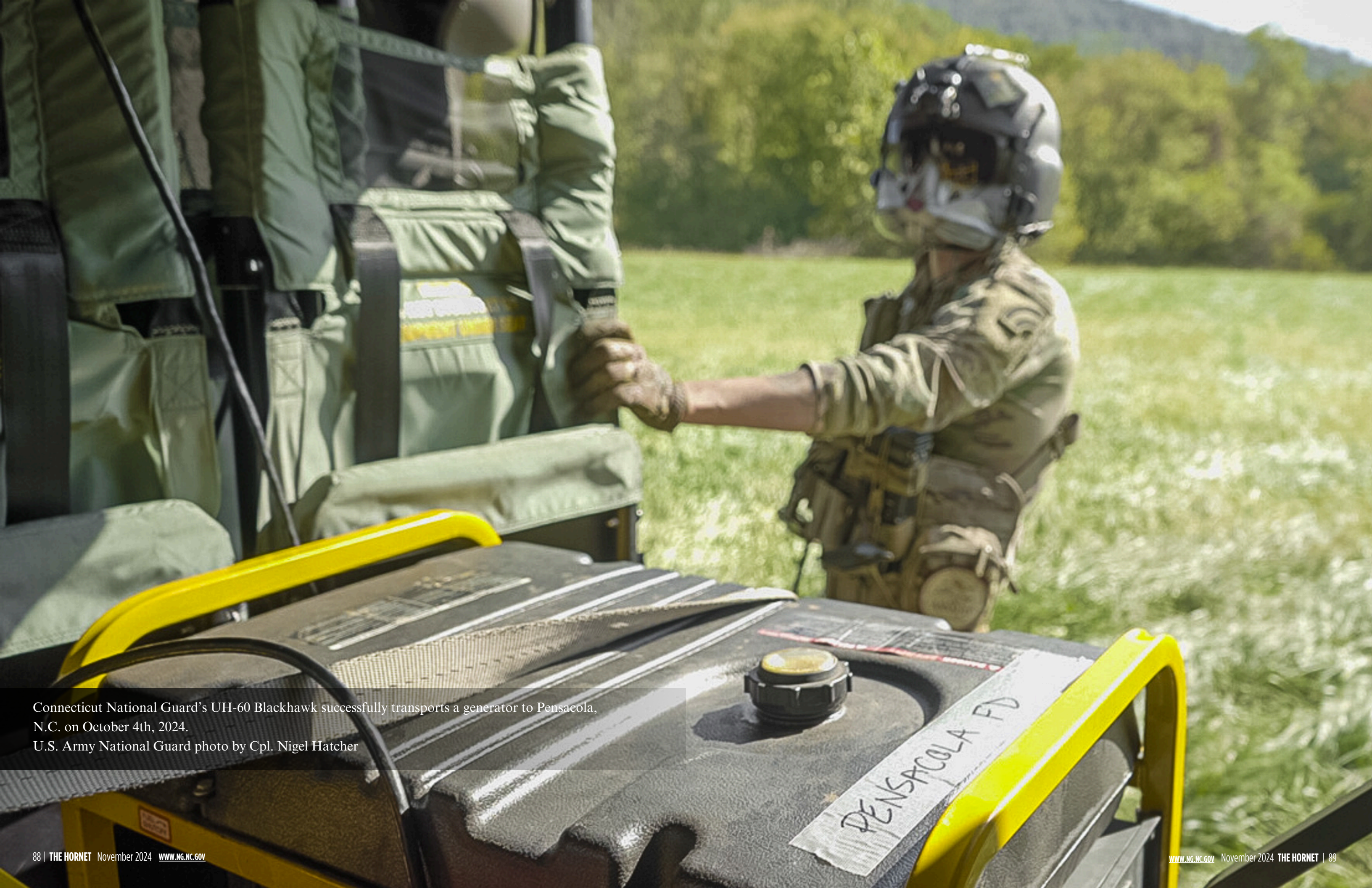
Connecticut National Guard's UH-60 Blackhawk successfully transports a generator to Pensacola, N.C. on October 4th, 2024.