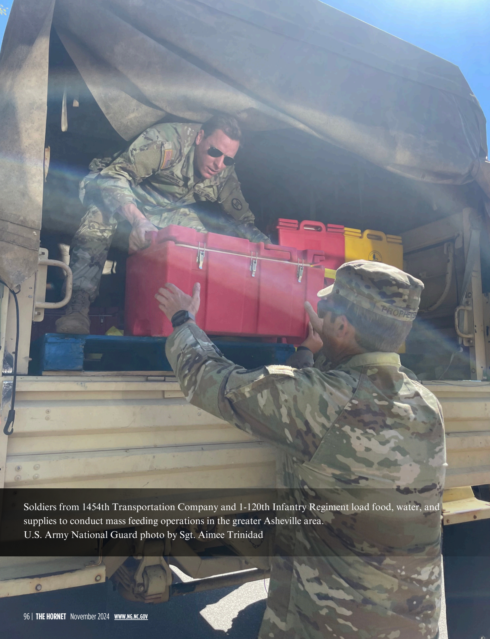
Soldiers from 1454th Transportation Company and 1-120th Infantry Regiment load food, water, and supplies to conduct mass feeding operations in the greater Asheville area.