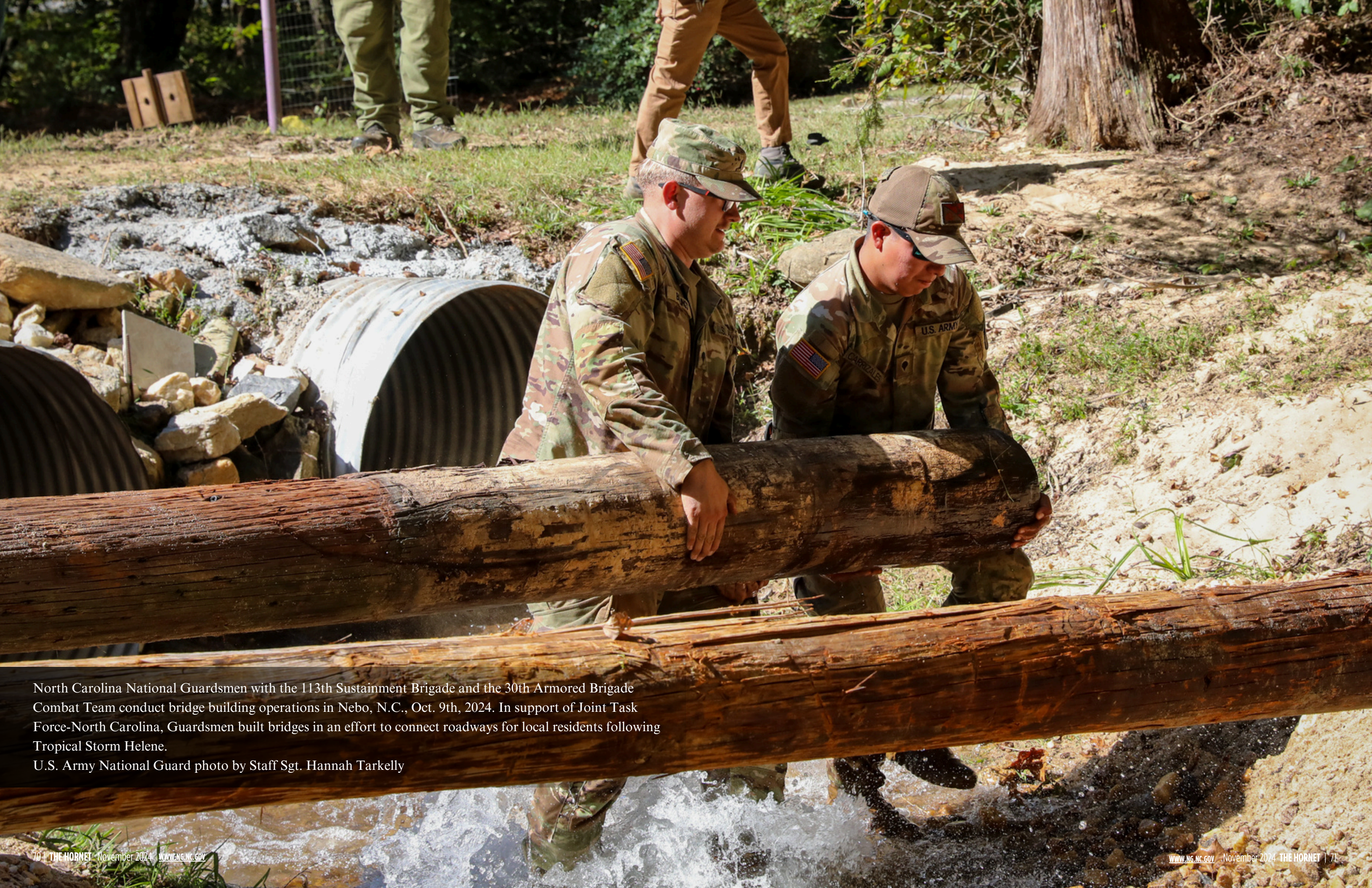
North Carolina National Guardsmen with the 113th Sustainment Brigade and the 30th Armored Brigade Combat Team conduct bridge building operations in Nebo, N.C., Oct. 9th, 2024. In support of Joint Task Force-North Carolina, Guardsmen built bridges in an effort to connect roadways for local residents following Tropical Storm Helene.