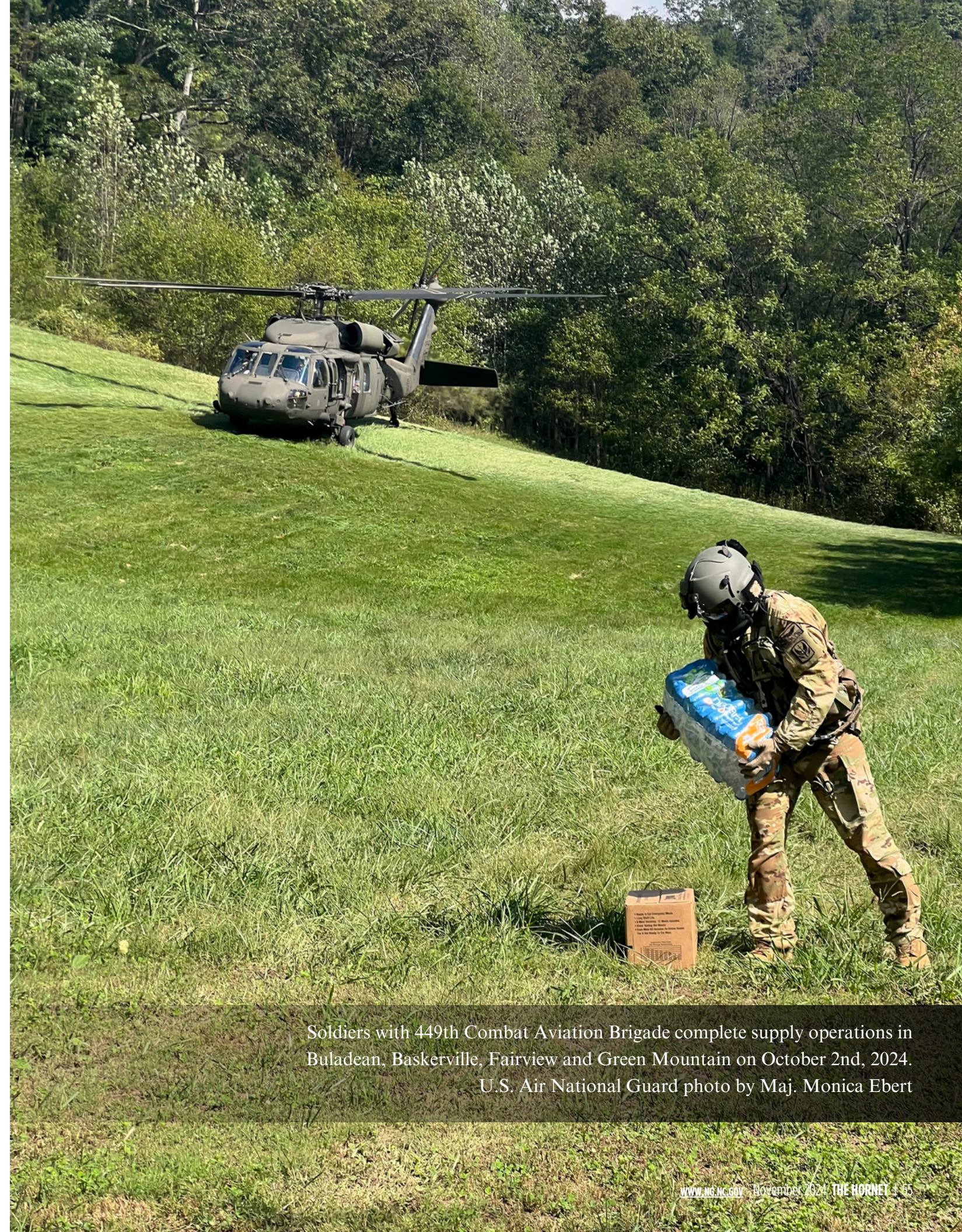
Soldiers with 449th Combat Aviation Brigade complete supply operations in Buladean, Baskerville, Fairview and Green Mountain on October 2nd, 2024.