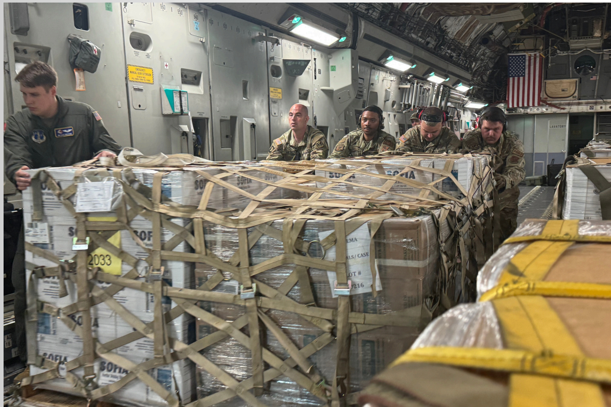
U.S. Air Force Airmen and U.S. Army Soldiers deliver 80,000 pounds of food and water to a logistics hub in Asheville, North Carolina. The pallets will be broken down by Soldiers and Airmen from the 113th Sustainment Brigade, 30th Armored Brigade Combat Team, 145th Airlift Wing, 449th Combat Aviation Brigade, 130th Maneuver Enhancement Brigade delivered with CH-47 Chinooks by the 82nd Airborne Division.