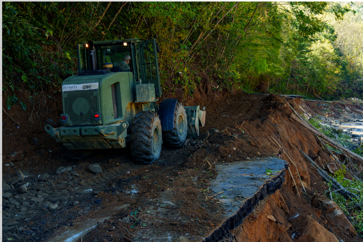
North Carolina National Guard soldiers reinforce a temporary dirt roadway with recovered river rocks in Yancey County North Carolina, Oct. 10, 2024. Joint Task Force North Carolina has been working 24 hours a day, across a dozen counties to get North Carolinians the help they need.