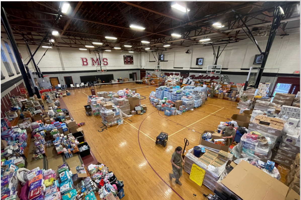
Joint Task Force NC continues to deliver essentials to those hardest hit by Tropical Storm Helene. Here's a glimpse from Mitchell County.