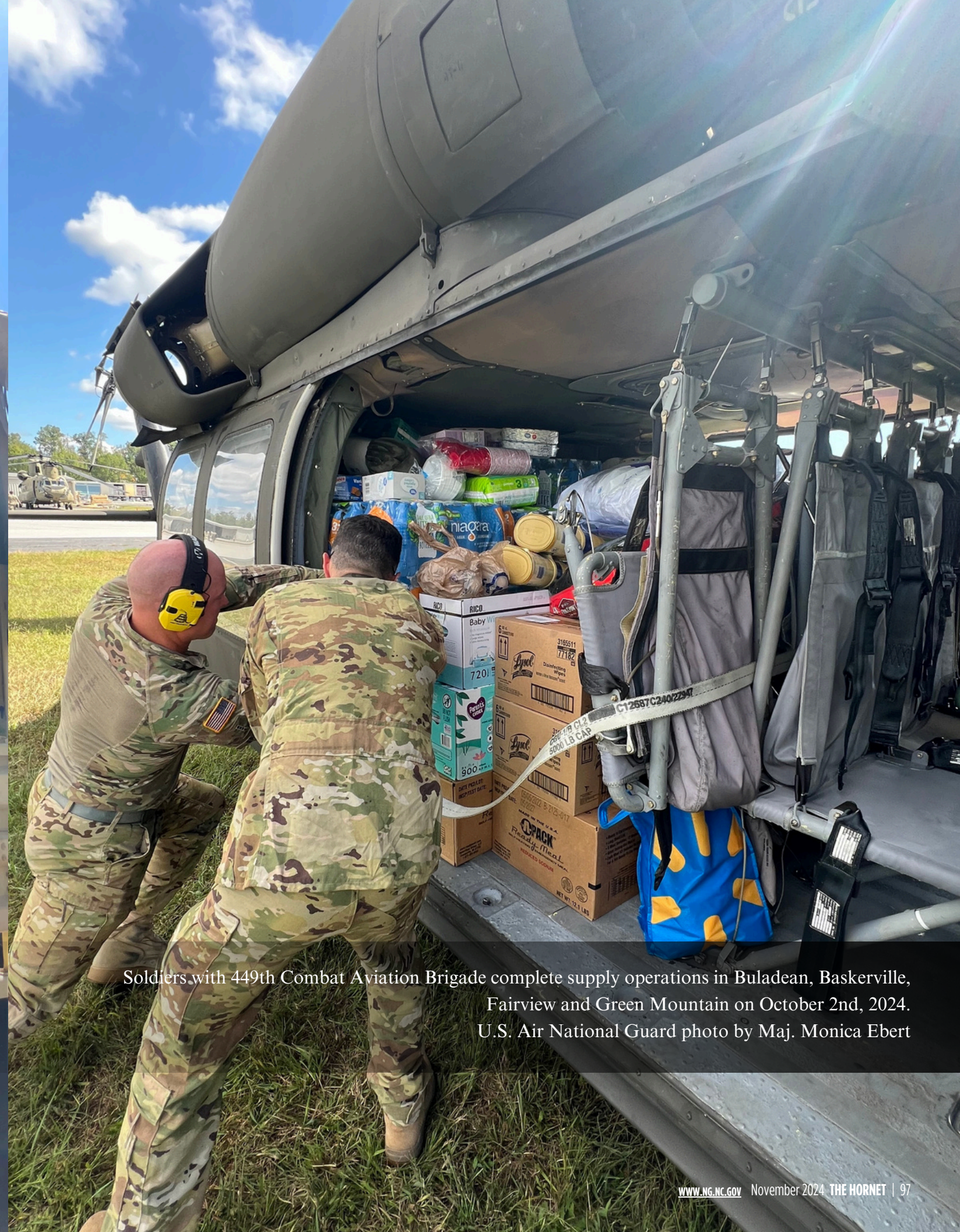
Soldiers with 449th Combat Aviation Brigade complete supply operations in Buladean, Baskerville, Fairview and Green Mountain on October 2nd, 2024.