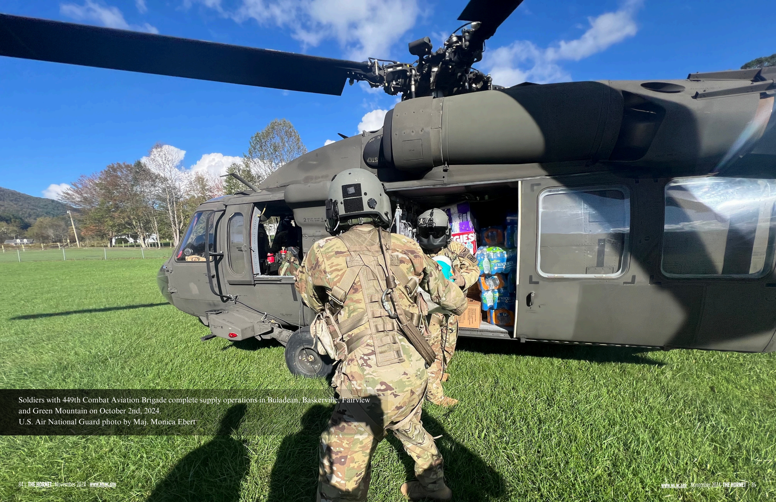
Soldiers with 449th Combat Aviation Brigade complete supply operations in Buladean, Baskerville, Fairview and Green Mountain on October 2nd, 2024.