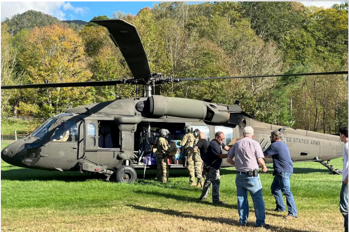
Soldiers with 449th Combat Aviation Brigade complete supply operations in Buladean, Baskerville, Fairview and Green Mountain on October 2nd, 2024.