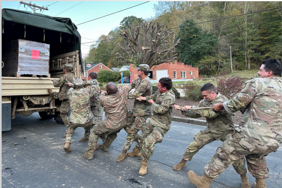
Watauga County operations are in full swing to address the impacts of Helene.