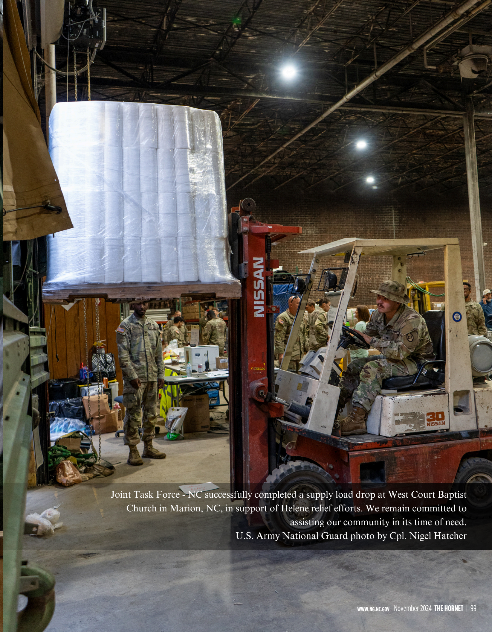
Joint Task Force - NC successfully completed a supply load drop at West Court Baptist Church in Marion, NC, in support of Helene relief efforts. We remain committed to assisting our community in its time of need.