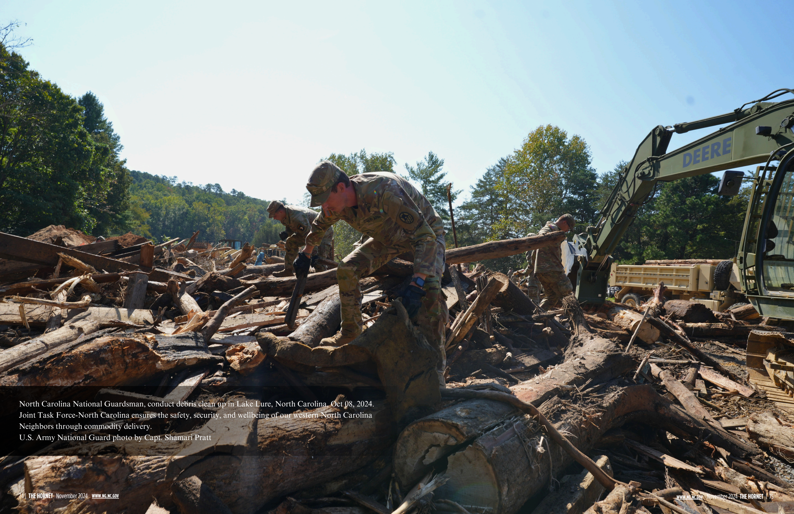
North Carolina National Guardsman, conduct debris clean up in Lake Lure, North Carolina. Oct 08, 2024. Joint Task Force-North Carolina ensures the safety, security, and wellbeing of our western North Carolina Neighbors through commodity delivery.