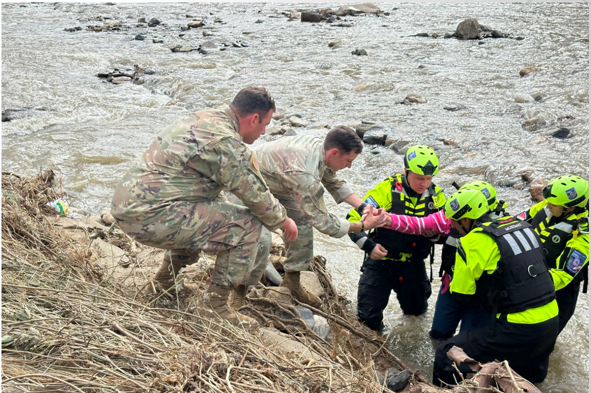
Soldiers from 1-120th Infantry Regiment and 130th Maneuver Enhancement Brigade help with a Swiftwater rescue in Polk county.