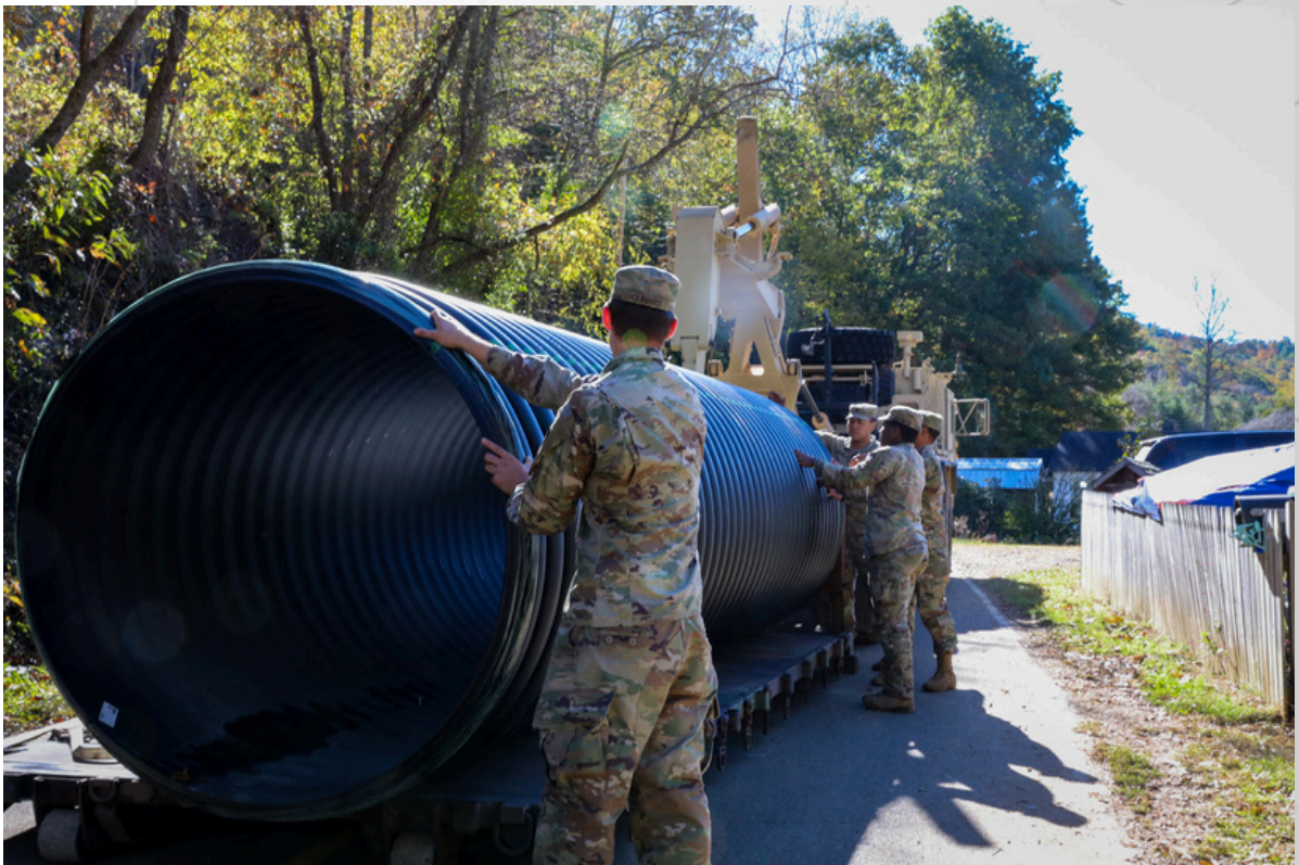
North Carolina National Guardsmen, assigned to the 130th Maneuver Enhancement Brigade, used culverts to restore roadways for local residents in Burnsville, N.C., Oct. 19th, 2024. Joint Task Force-North Carolina deployed military capabilities in support of Tropical Storm Helene relief efforts.