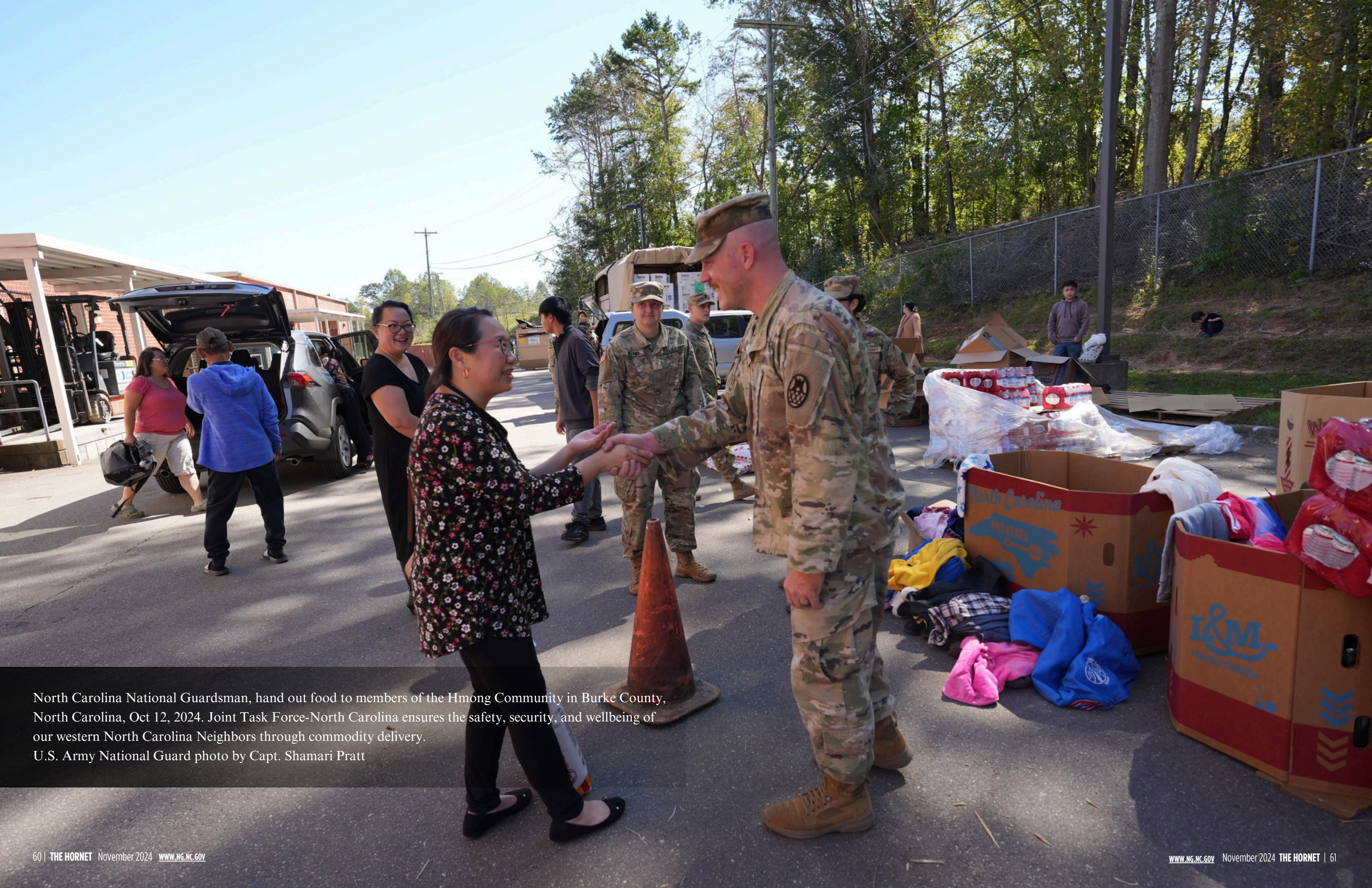
North Carolina National Guardsman, hand out food to members of the Hmong Community in Burke County, North Carolina, Oct 12, 2024. Joint Task Force-North Carolina ensures the safety, security, and wellbeing of our western North Carolina Neighbors through commodity delivery.