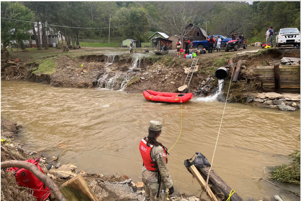
Soldiers from 151st Combat Engineer Company and 881st Engineer Support Company, part of Joint Task Force - NC, successfully complete a search and rescue mission in support of Helene relief in Western North Carolina.