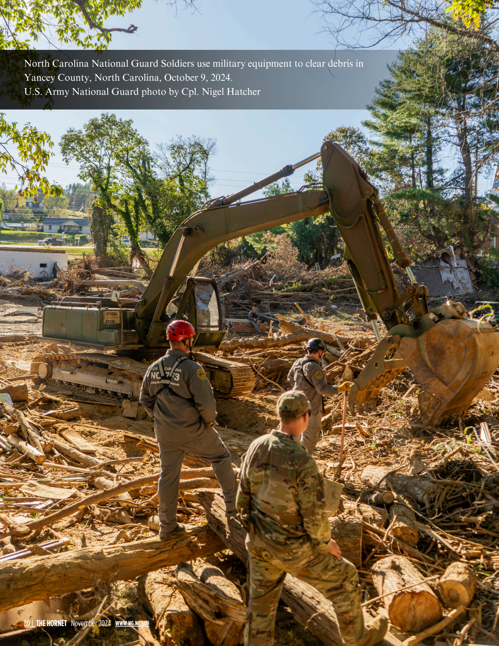
North Carolina National Guard Soldiers use military equipment to clear debris in Yancey County, North Carolina, October 9, 2024.