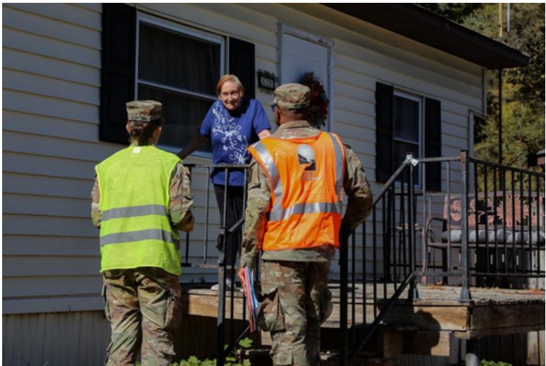
North Carolina National Guardsmen, assigned to the 113th Sustainment Brigade, knock on doors to assess community needs and provide resources in Waynesville, N.C., Oct. 14th, 2024. Joint Task Force-North Carolina deployed military capabilities in support of Tropical Storm Helene relief efforts.