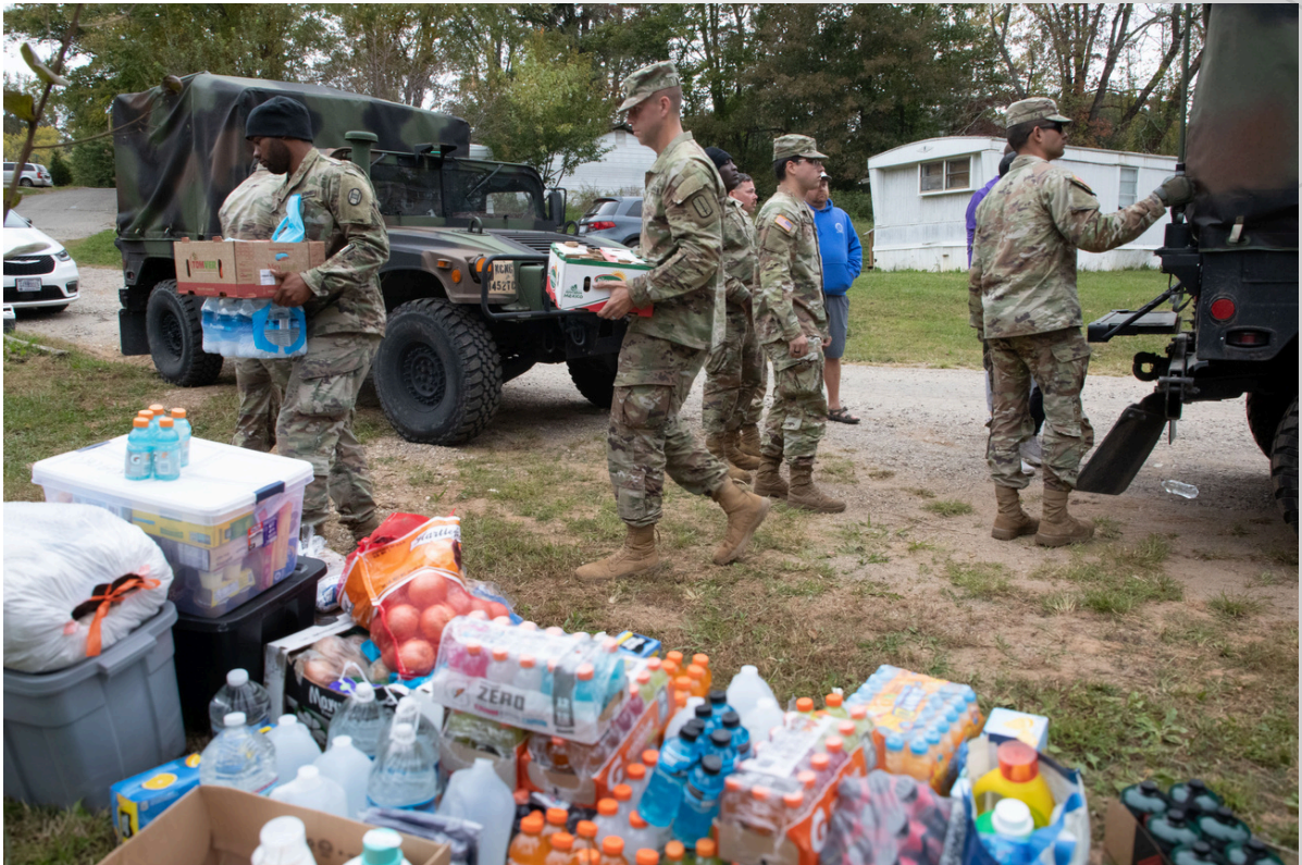
U.S. Army Soldiers with the 30th Armored Brigade Combat Team and 113th Sustainment Brigade drop off supplies to a small community in Alexander, North Carolina, Oct. 15, 2024. Joint Task Force-North Carolina ensures the safety, security, and wellbeing of our western North Carolina Neighbors through community outreach.