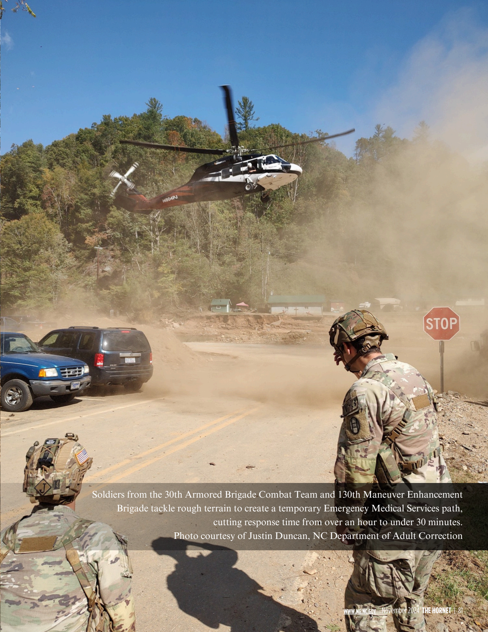
Soldiers from the 30th Armored Brigade Combat Team and 130th Maneuver Enhancement Brigade tackle rough terrain to create a temporary Emergency Medical Services path, cutting response time from over an hour to under 30 minutes.