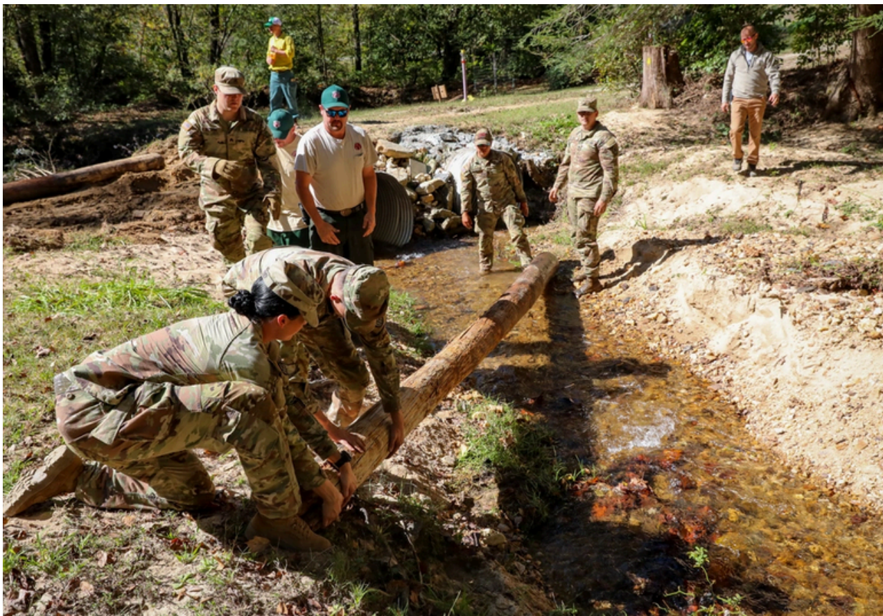
North Carolina National Guardsmen with the 113th Sustainment Brigade and the 30th Armored Brigade Combat Team conduct bridge building operations in Nebo, N.C., Oct. 9th, 2024. In support of Joint Task Force-North Carolina, Guardsmen built bridges in an effort to connect roadways for local residents following Tropical Storm Helene.