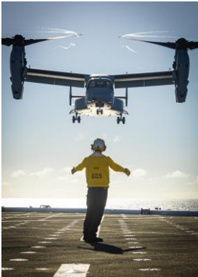
A U.S. Navy Sailor attached to the Expeditionary Sea Base (ESB) 6 USS John L. Canley uses hand and arm signals to guide a U.S. Marine Corps MV-22B Osprey during a deck landing qualification training on the ship as part of exercise Warrior Voyage, off the coast of the island of O’ahu, Hawaii, Oct. 10, 2024. Exercise Warrior Voyage is a group-level training event. More Imagery