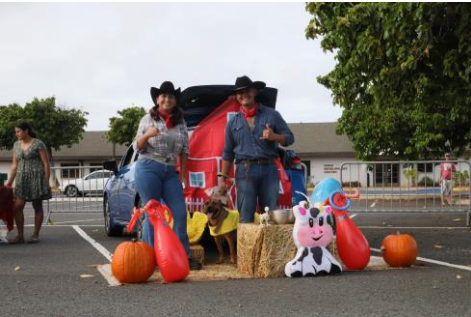
Families attend a Marine Aircraft Group 24, 1st Marine Aircraft Wing, "Trunk or Treat" event at Marine Corps Base Hawaii, Oct. 25, 2024.