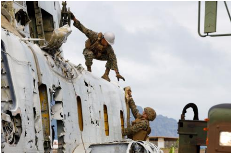
U.S. Marines with Wing Support Squadron (MWSS) 174, Marine Aircraft Group 24, 1st Marine Aircraft Wing attach straps to a crane during salvage and recovery training. More Imagery