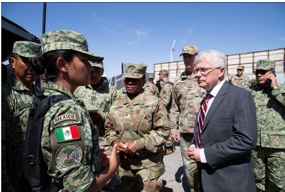
Exercise Fuerzas Amigas 2024 is an annual disaster-response exercise between the U.S. and Mexican militaries held from June 24-28 to strengthen partnerships and increase operational compatibility in the event of a cross-border humanitarian crisis. American Soldiers from the U.S. military's premier Chemical, Biological, Radiological, Nuclear, Explosives (CBRNE) command participated in a bilateral exercise with the Mexican Army in Cuidad Juarez, Mexico, June 24 - 28.

CUIDAD JUAREZ, Mexico – American Soldiers from the U.S. Department of Defense's premier Chemical, Biological, Radiological, Nuclear, Explosives (CBRNE) command participated in a bilateral exercise with the Mexican Army in Cuidad Juarez, Mexico, June 24 - 28.