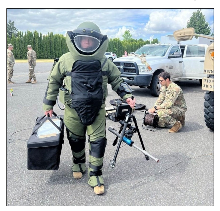
U.S. Army Explosive Ordnance Disposal technicians trained to confront and defeat explosive Unmanned Aerial Systems during an interagency exercise on Joint Base Lewis-McChord, Washington. EOD technicians from the 707th Ordnance Company (EOD) "Thunderbirds" and 787th Ordnance Company (EOD) "Sasquatches" worked together to render safe the simulated explosive payload on a drone during Operation Cascade Defense.

JOINT BASE LEWIS-MCCHORD, Wash. – U.S. Army Explosive Ordnance Disposal technicians trained to confront and defeat explosive Unmanned Aerial Systems during an I Corps-hosted interagency exercise at McChord Airfield on Joint Base Lewis-McChord, Washington.