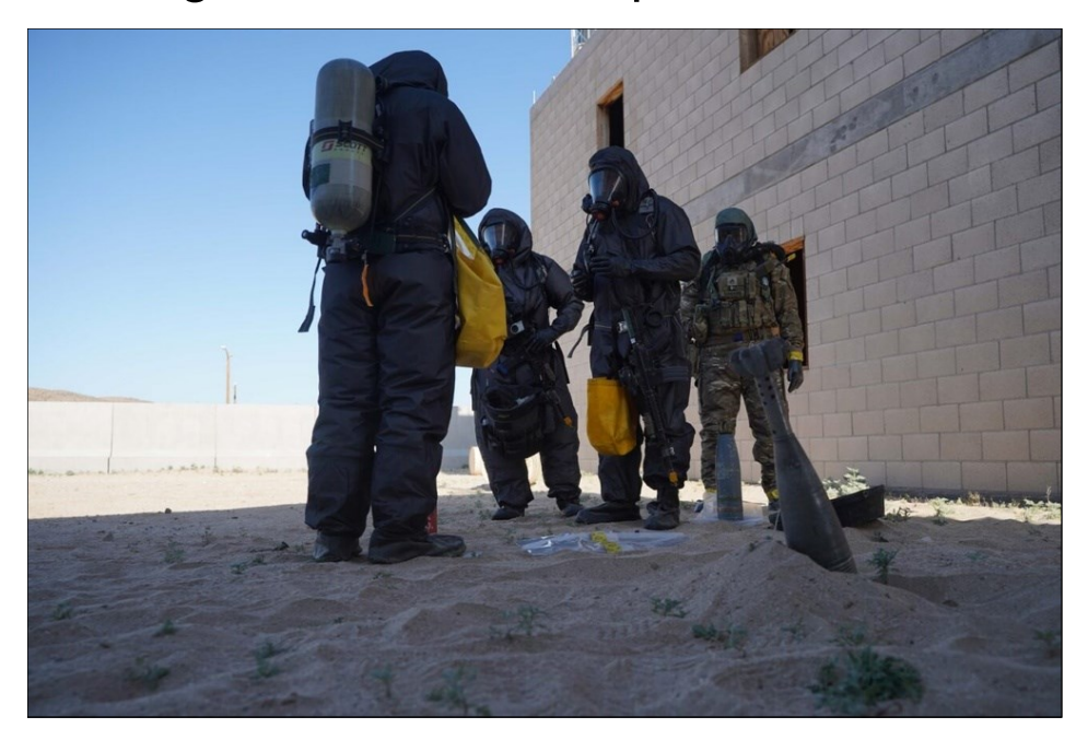
U.S. Soldiers assigned to 110 Chemical Battalion, 48th Chemical Brigade, supporting 1st Stryker Brigade Combat Team, 2nd Infantry Division, conduct hazardous material operations during rotation 24-07 at the National Training Center on Fort Irwin, California, May 3.