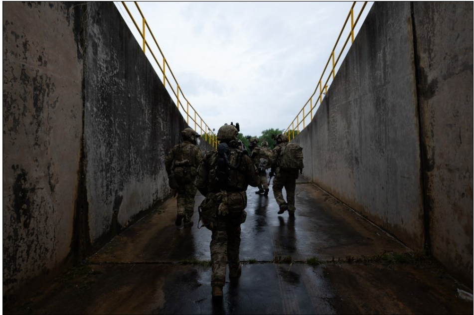
U.S. Army Nuclear Disablement Team Soldiers and Army Rangers seized and exploited an underground nuclear facility during a training exercise. Nuclear Disablement Team 1 trained with Army Rangers from the 75th Ranger Regiment during operations under simulated fire at the decommissioned pulse radiation facility, June 6.

ABERDEEN PROVING GROUND, Md. – Nuclear Disablement Team Soldiers and Army Rangers seized and exploited an underground nuclear facility during a training exercise.