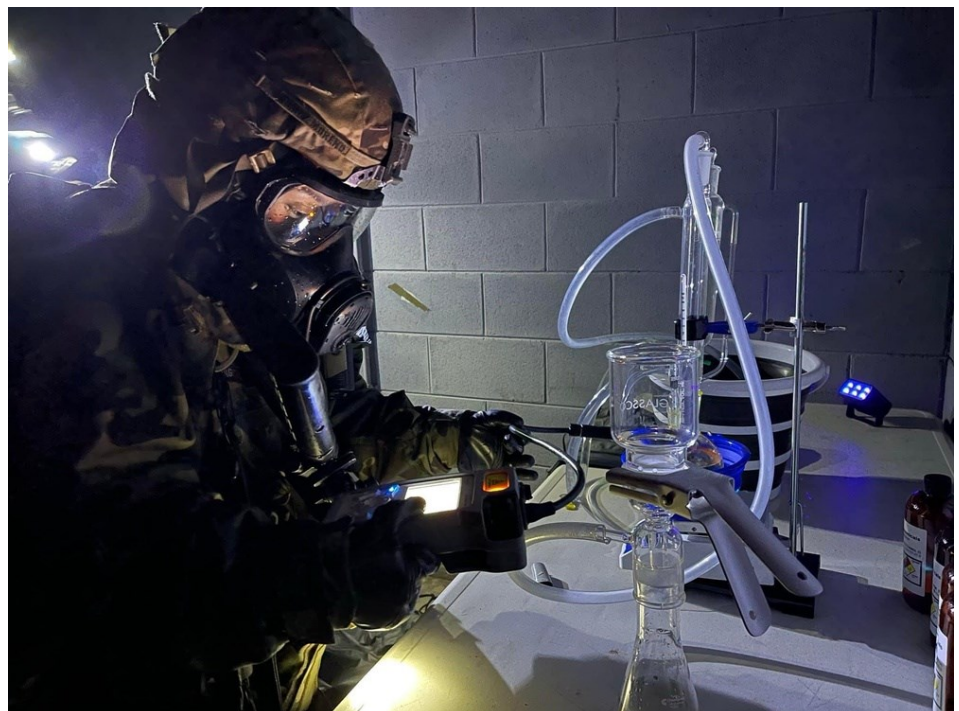
American Soldiers from the 59th Chemical, Biological, Radiological, Nuclear (CBRN) Company (Hazardous Response) "Mountain Dragons" are bolstering the Republic of Korea-U.S. Alliance combined defense posture during a rotational deployment near the Korean Demilitarized Zone.

CAMP HUMPHREYS, South Korea – The U.S. military's premier deployable and multifunctional Chemical, Biological, Radiological, Nuclear, Explosives (CBRNE) command participated in Ulchi Freedom Shield (UFS) 24 in South Korea, Aug. 19 - 29.