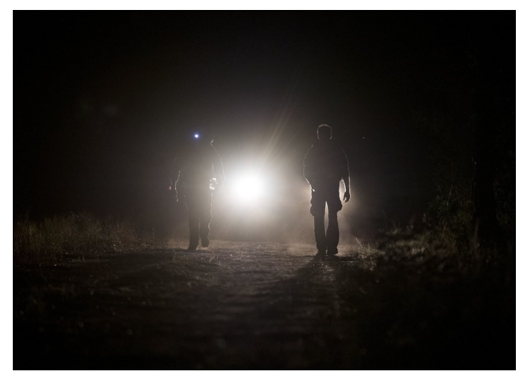
U.S. Army Soldiers with the 7th Special Forces Group participate in a ruck march during the annual Best ODA Competition at Eglin Air Force Base, Florida, Sept. 9, 2020. The 7th Special Forces Group's mission is to organize, equip and train forces for deployment to conduct worldwide special operations and support regional combatant commanders, American ambassadors and other agencies in more than 30 countries.

NDTs directly contribute to the nation's strategic deter-