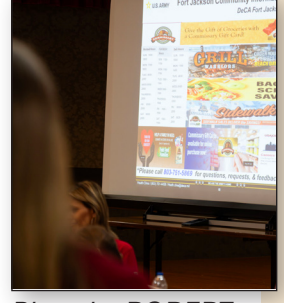
events.