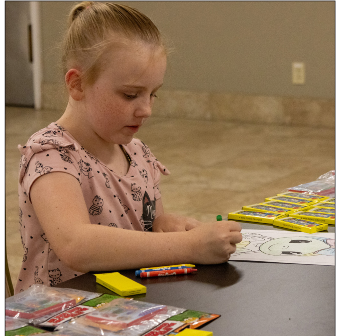
(left photo) Military family enjoy the activities at the End of Summer Bash at James L. Day conference center, which included coloring pages (above photo), at Marine Corps Logistics Base Barstow, California, August 2.