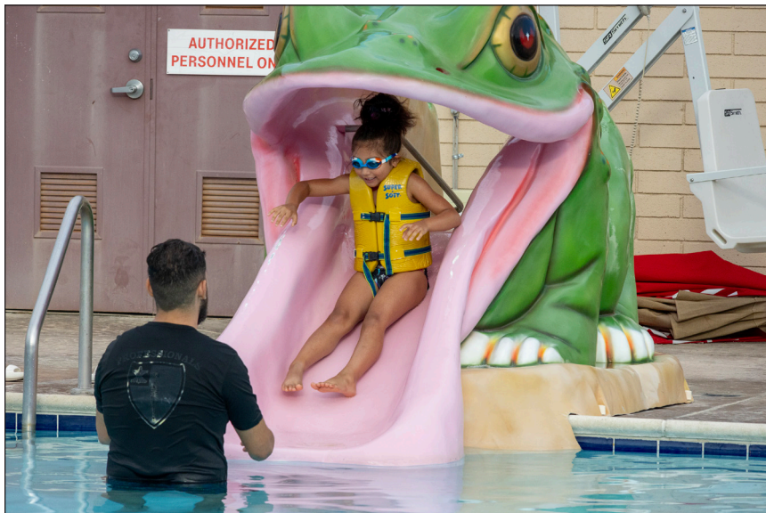
A military family plays on the frog slide at the Oasis Pool aboard Marine Corps Logistics Base Barstow, California, August 2. During the End of Summer Bash, the pool was open for families and personnel.