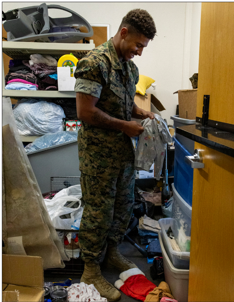
A Marine from the Single Marine Program sorts through donations and helps organize the donation storeroom at the Navy-Marine Corps Relief Society thrift store aboard Marine Corps Logistics Base Barstow, California, August 8.