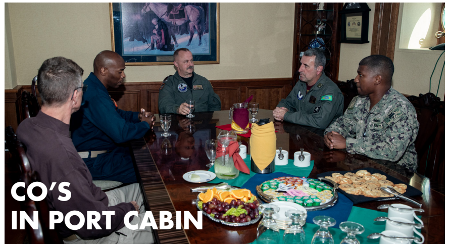
CO'S IN PORT CABIN