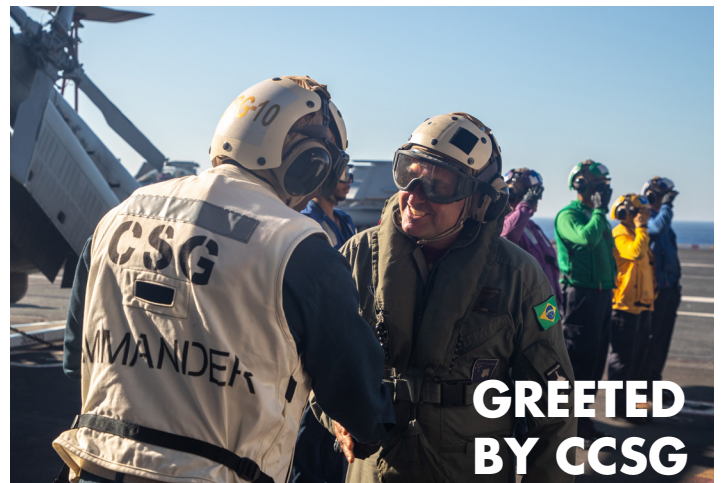
GREETED BY CCSG