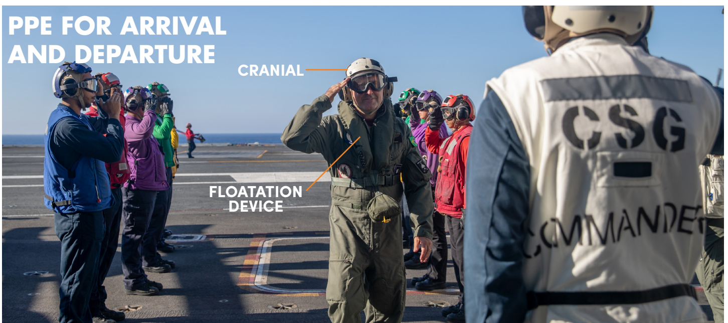
PPE FOR ARRIVAL AND DEPARTURE