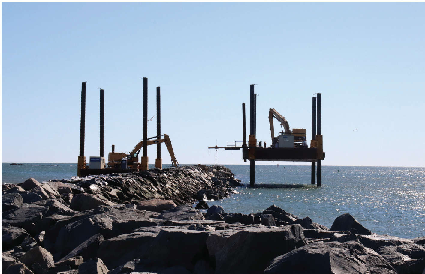
Repair work at the Hampton Harbor North Jetty is ongoing.