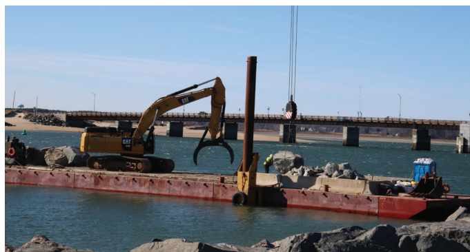
Contractor Lucianos Excavation moving armor stone for placement on the North Jetty.

Construction methods to repair the North Jetty are both land and water-based. A majority of the work is being