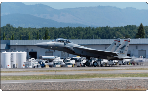
A USAF F-15 EX Eagle II, tail number 008 touches performance goes, down at the Portland Air National Guard Base, Oregon on June 5, 2024, making history as the first EX aircraft to be delivered to an operational unit.

Upon shutting down the engines, Conner and Wigton were greeted with cheers and applause. The significance of the historic moment was not lost on them.