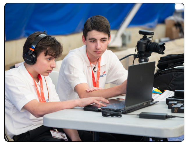
Oregon students begin to create a news story as part of their assignment during the 2024 SkillsUSA Oregon State Conference, held at Knife River Training center in Albany, Oregon from April 18-19, 2024.