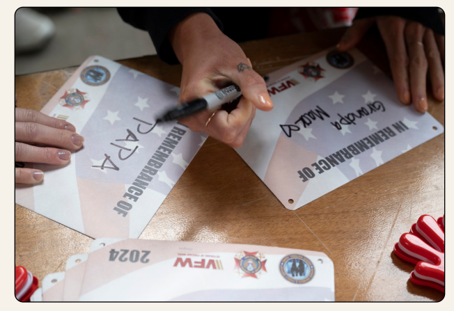
Participants in the 2024 Run to Remember write the names of loved ones who gave the ultimate sacrifice on race bibs to wear during the 5-kilometer race.