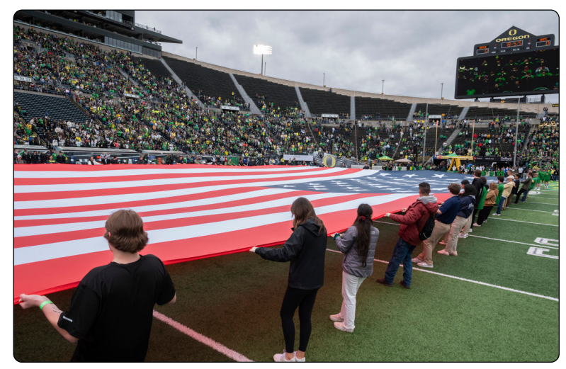
Members of the Army, Navy, Air Force, Marine Corp, National Guard and ROTC students hold a large American Flag during the National Anthem during the University of Oregon Spring Football Game.

Over 125 members of the University of Oregon Football team greet service members from the Army, Navy, Air Force, Marine Corp, National Guard and ROTC students take part in an End of Game Exchange between following the University of Oregon Spring Game, on April 27, 2024 at Autzen Stadium in Eugene, Oregon.