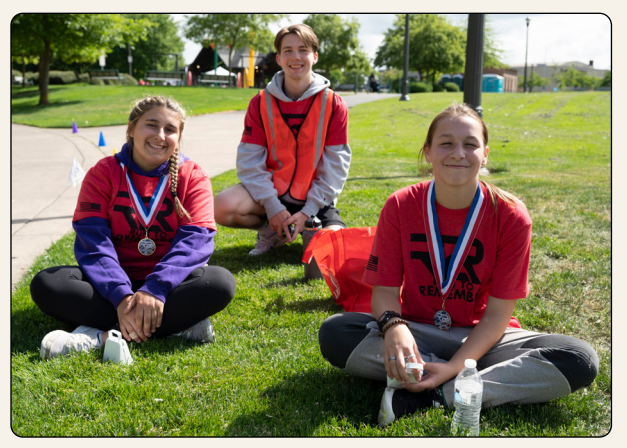
Oregon National Guard's Teen Panel program volunteers during the 2024 Run to Remember helping participants during the 5-kilometer race stay on course.

Runners and walkers participating in the Oregon National Guard's 2024 Run to Remember 5-kilometer race move towards the finish line on May 18, at Riverfront Park, in Salem.