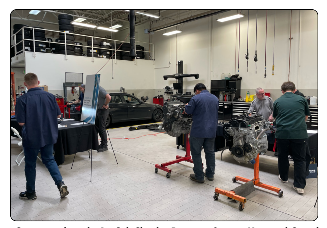
Students take part in the automotive competition during the 2024 SkillsUSA Oregon State Conference held at Knife River Training cen-

in classroom accomplished through a variety of skill sets in personal, workplace, technical and academics, which is integrated into the classroom curriculum.