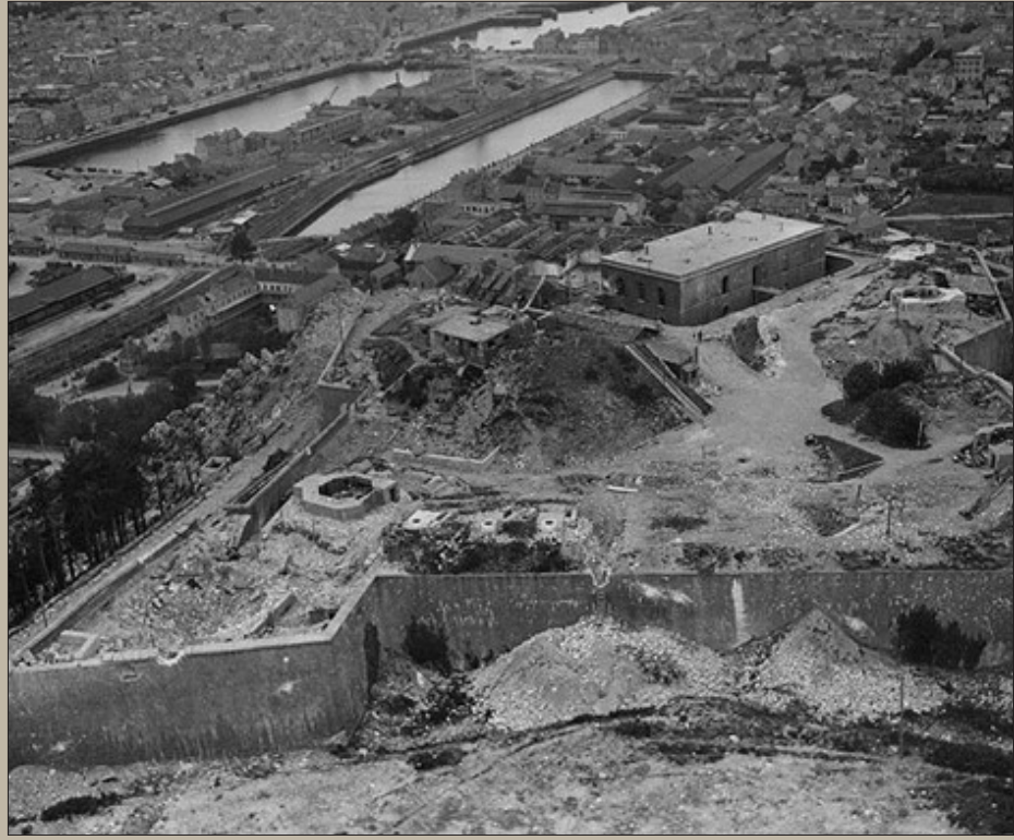
The ruins of Fort du Roule in the foreground with a portion of Cherbourg's severely damaged docks in the background. It would take weeks to clear and make the port operational.

Fort Jackson has renamed numerous roads and streets on post that were named after Confederate leaders, battles and units. This effort is part of the efforts to rename Department of Defense installations, streets, buildings and ships that featured names commemorating the Confederacy. But do you know the significance of the new names?