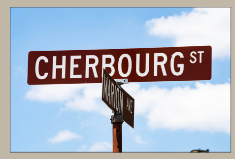
By FIELDING FREED Basic Combat Training Museum

Capitalizing on the success of the Allied D-Day landings into France depended on forward momentum. Forward momentum in turn depended on a steady supply of men and supplies flowing into the Cherbourg, or Cotentin, Peninsula where the landings took place. The ingenious deployment of two artificial harbors, known as Mulberries, by the British Admiralty enabled a rapid delivery of supplies from England, but they were meant to be a temporary measure.