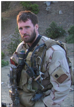
Navy Lt. Michael Murphy

“Despite the intensity of the firefight and suffering grave gunshot wounds himself, Murphy is credited with risking his own life to save the lives of his teammates,” the Navy’s Medal of Honor site stated. “Murphy, intent on making contact with headquarters, but realizing this would be impossible in the extreme terrain where they were fighting, unhesitatingly and with complete disregard for his own life moved into the open, where he could gain a better position to transmit a call to get help for his men.”