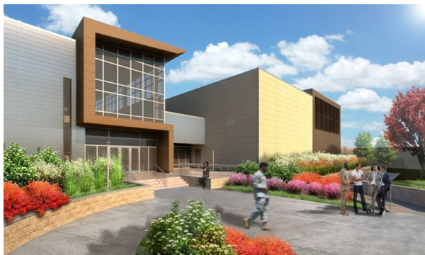
Render of the Nolan building

The MIRC CG participated in a ribbon cutting ceremony for Intelligence and Security Command's Nolan building located on Fort Belvoir, Va.