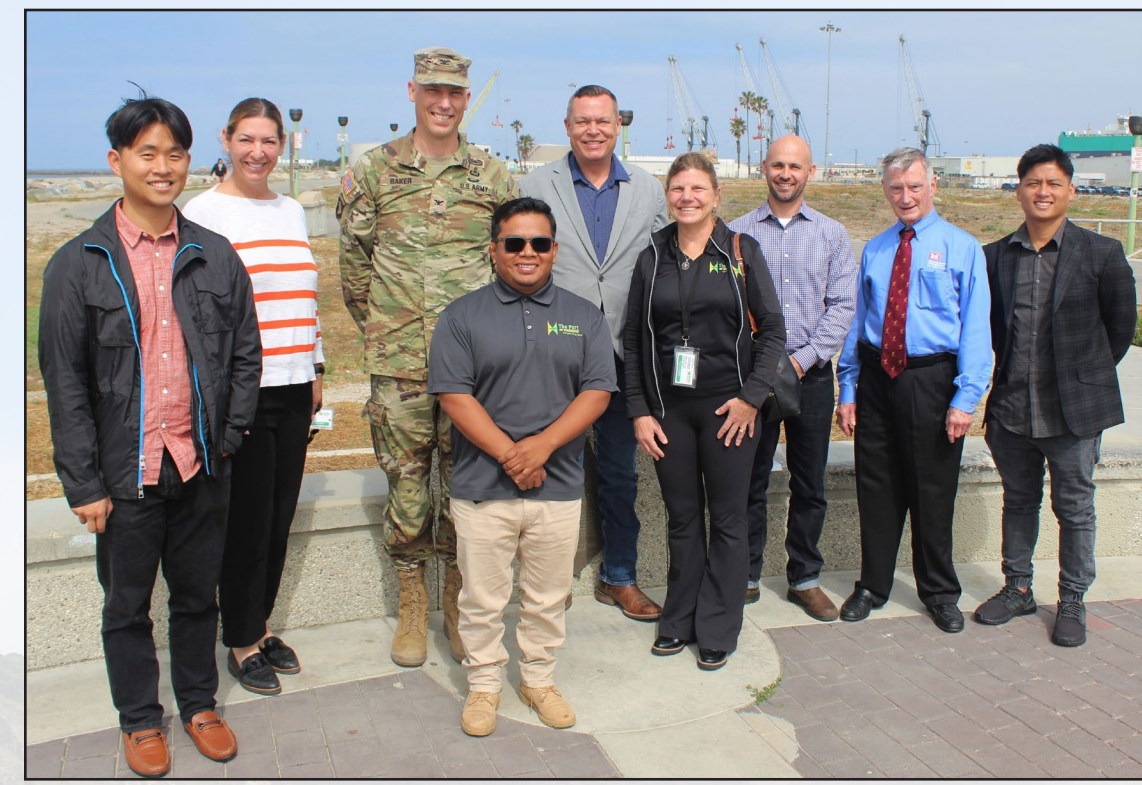
The U.S. Army Corps of Engineers Los Angeles District command team and Port of Hueneme executives and representatives meet in the Oxnard Harbor District before touring potential dredging projects along the coast June 3 in Port Hueneme, California. The Port of Hueneme is the name of port, and "Port Hueneme" is the city in which the port resides. The Port of Hueneme is included in the Oxnard Harbor District, which is the fifth largest importer of refrigerated goods and the sixth largest vehicle importer/exporter in the U.S.

The Port San Luis Harbor boat tour took the team around Hartford Pier, or Pier 3, where the LA District completed a breakwater repair project October 2023. Pier 3 was confrom the previous three days.