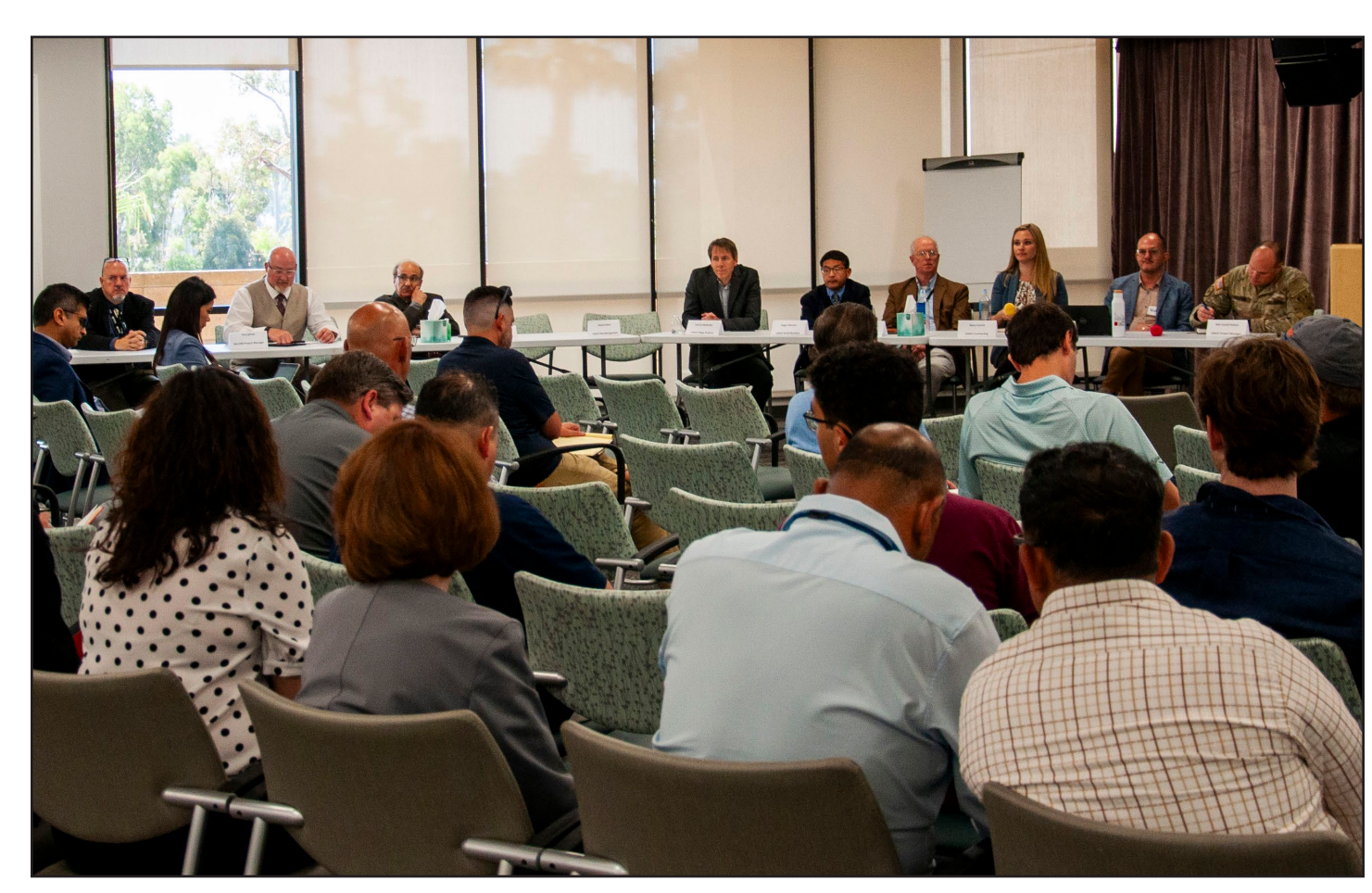
Representatives of the U.S. Army Corps of Engineers facilitate the June 20 Industry Day at the Veterans Affairs Greater Los Angeles Healthcare System, Los Angeles.