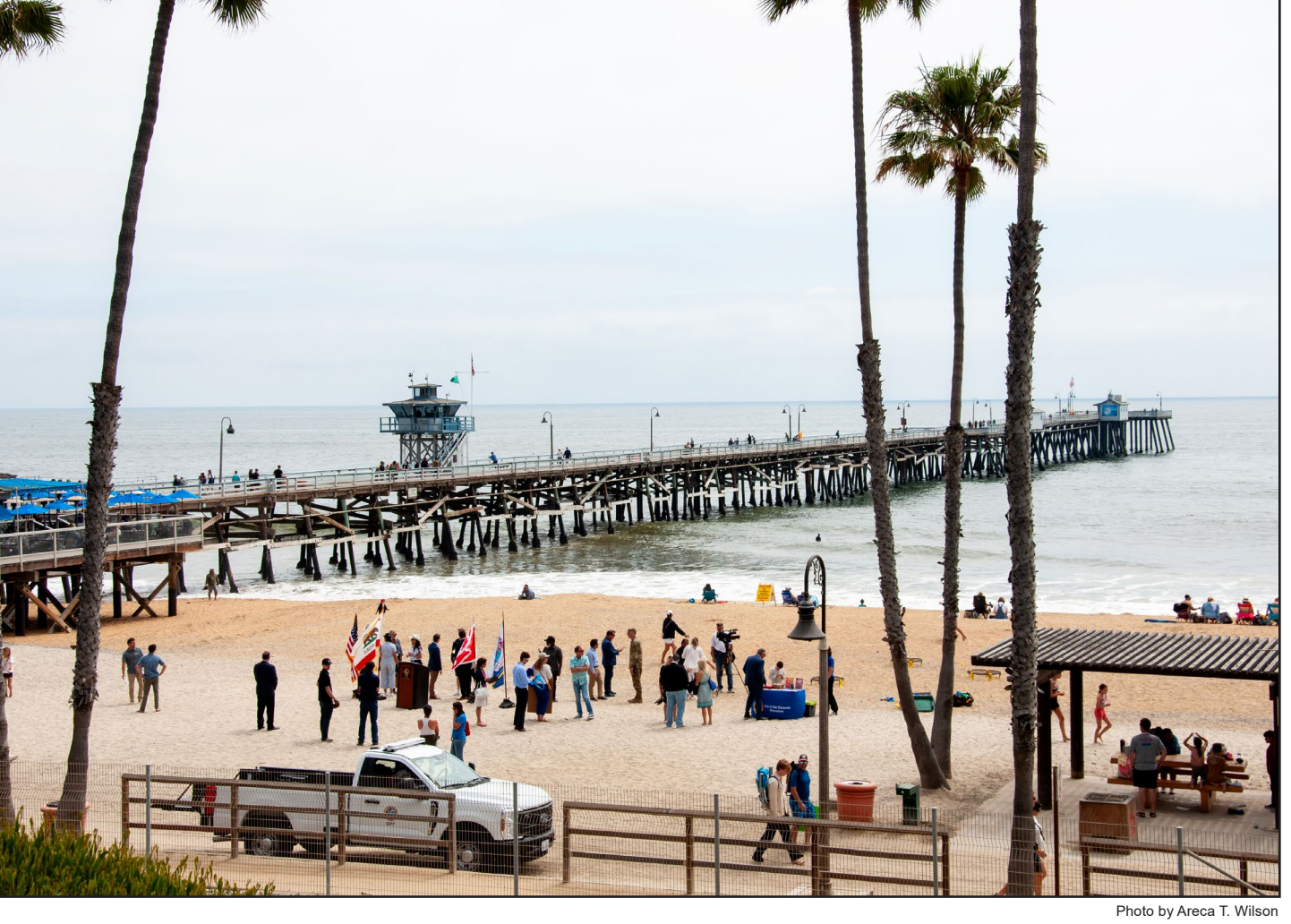
Community members and representatives from various city, state and federal agencies attend a ribbon-cutting ceremony to celebrate the completion of Phase One of the San Clemente Beach Nourishment project May 31 in San Clemente, Calif. As part of the project, renourishment will occur every six years, on average, for eight additional nourishments.

To learn more about the LA District's programs and projects, visit www.spl.usace. army.mil