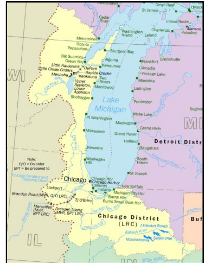
Chicago District Boundaries