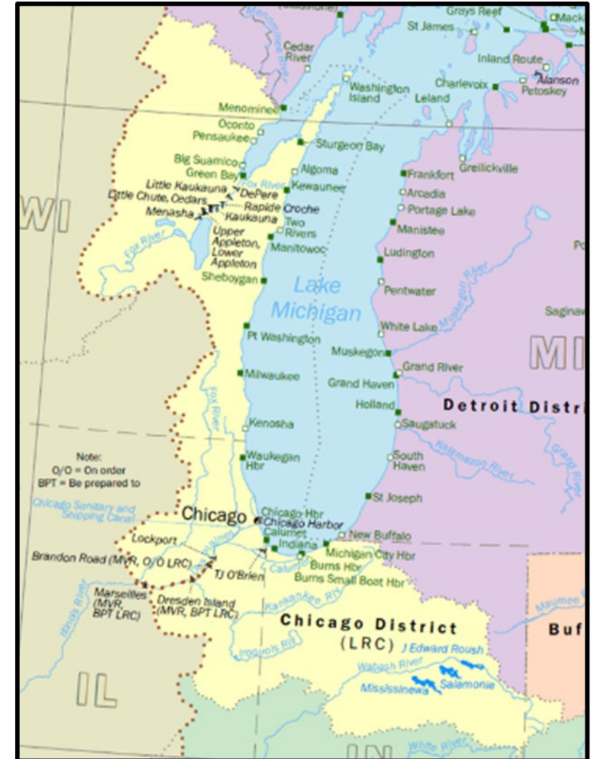
Chicago District Boundaries