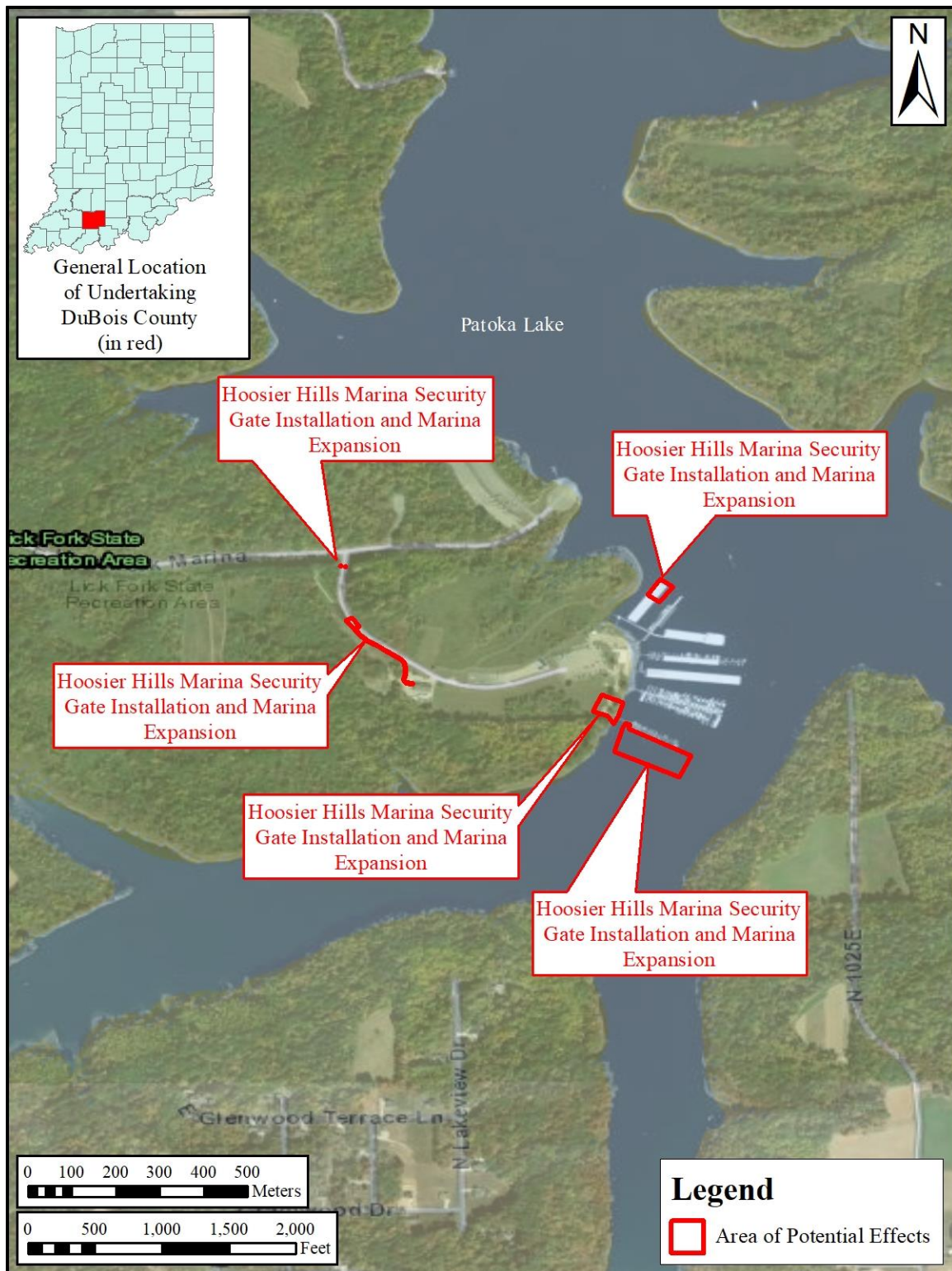
Enclosure 8. Aerial map showing the location of Hoosier Hills Marina security gate installation and marina expansion at Patoka Lake (Undertaking 4).