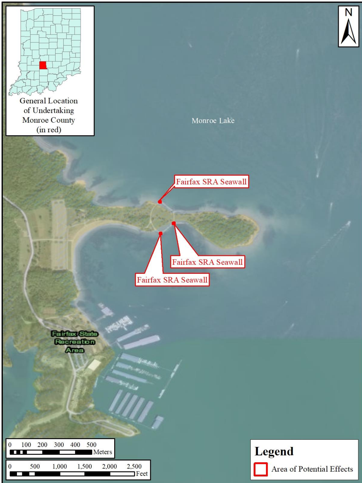
Enclosure 9. Aerial map showing the locations of the Fairfax SRA Seawall Project (Undertaking 5).