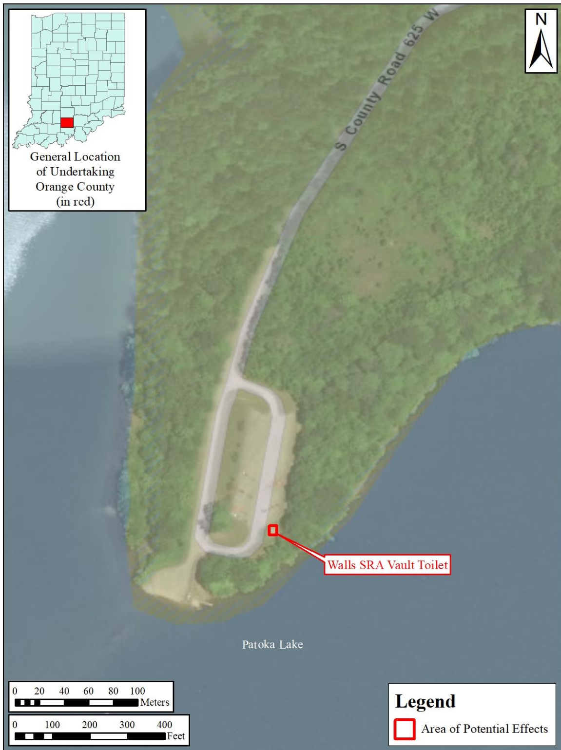
Enclosure 5. Aerial map showing the location of the vault toilet at Walls SRA to be replaced (Undertaking 2).