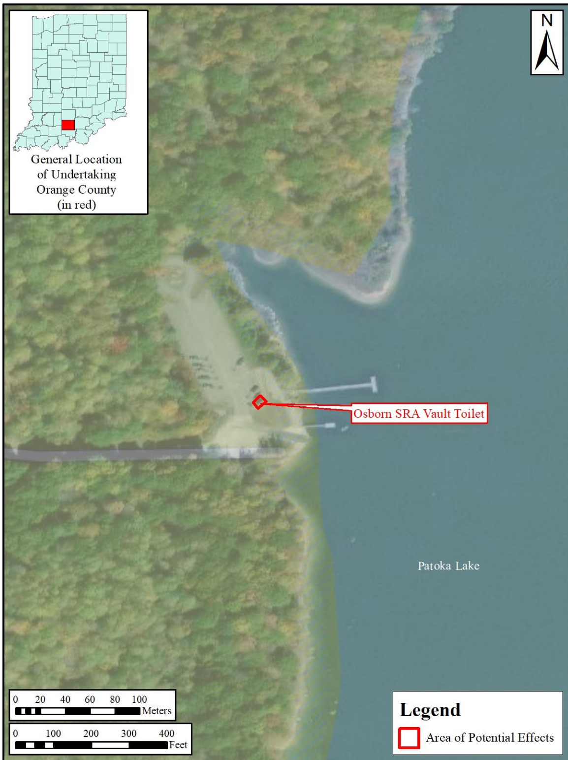
Enclosure 4. Aerial map showing the location of the vault toilet at Osborn SRA to be replaced (Undertaking 2).