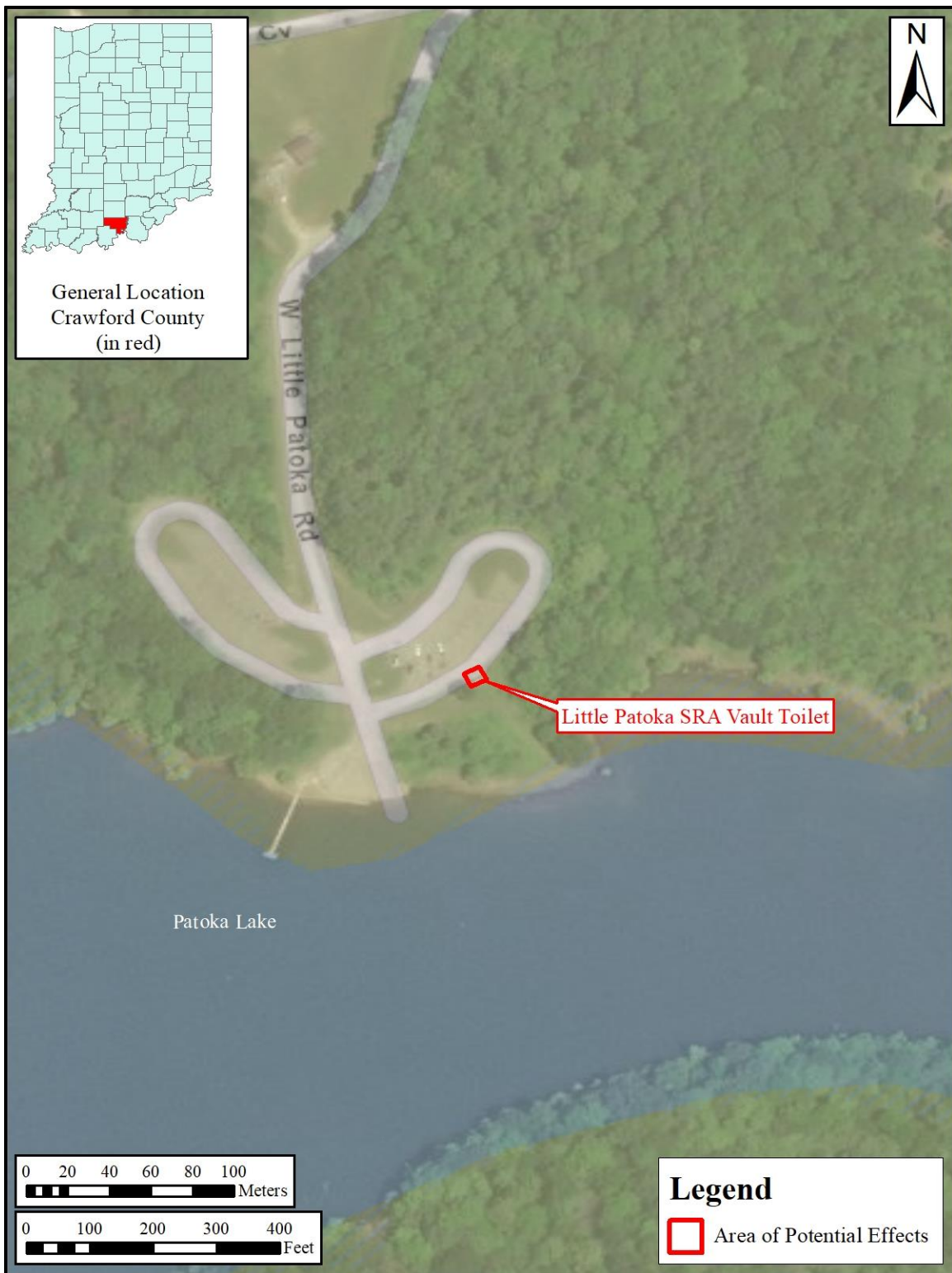
Enclosure 6. Aerial map showing the location of the vault toilet at Little Patoka SRA to be replaced (Undertaking 2).