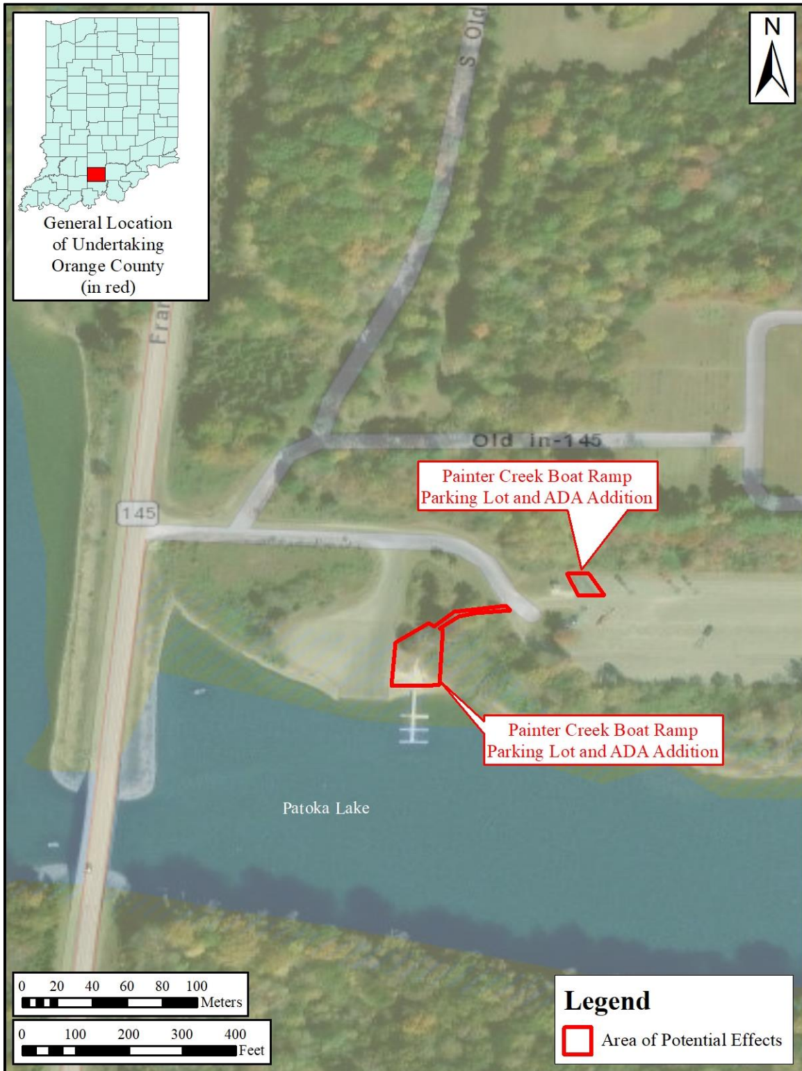
Enclosure 7. Aerial map showing the location of the parking lot and American with Disabilities Act additions to Painter Creek Boat Ramp at Patoka Lake (Undertaking 3).