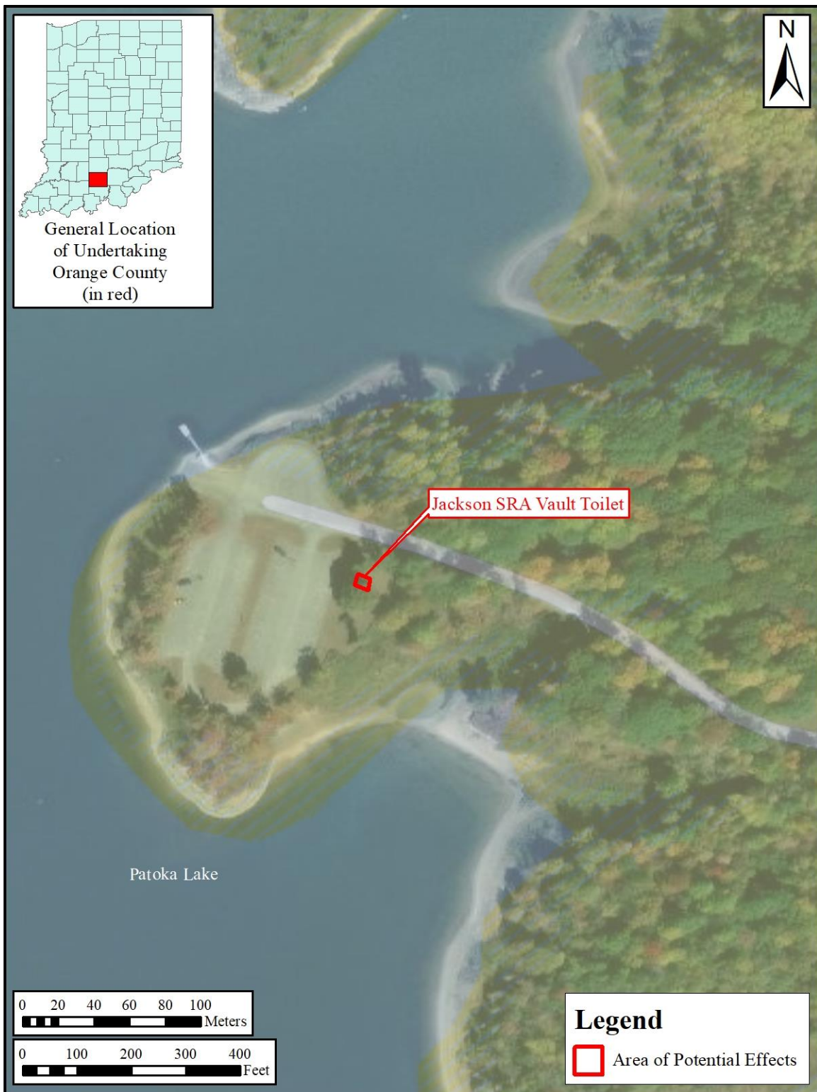
Enclosure 3. Aerial map showing the location of the vault toilet at Jackson SRA to be replaced (Undertaking 2).