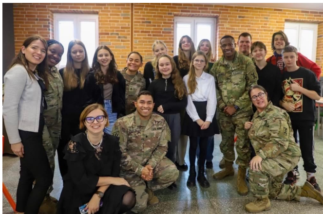
U.S. Army Soldiers assigned to the 3rd Division Sustainment Brigade's Task Force Provider, currently deployed to Powidz, Poland, attend a dedication event for a trade school addition to the general education school in Wloszakowice, Nov. 10, 2023. The recently refurbished portion of the school was dedicated to Polish military veterans of overseas deployments in a ceremony corresponding with the Polish national independence day, which occurs on Nov. 11, the same date as Veterans Day in the U.S.