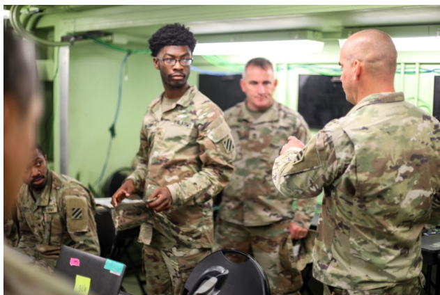
U.S. Army Soldiers assigned to the support operations of the 3rd Division Sustainment Brigade, 3rd Infantry Division, relocate their headquarters to a tactical operations center during a command post exercise at Forward Operating Site Powidz, Poland, Nov. 3, 2023.

With understanding that training is essential,