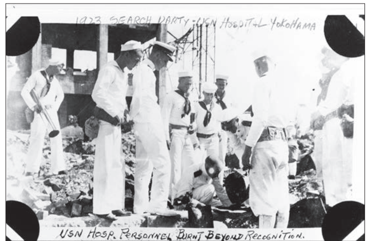
A Navy Chaplain ministers to the dead, burned beyond recognition in the ruins of the U.S. Naval Hospital at Yokohama, Japan. He was part of an Asiatic Fleet search and recovery party sent to the hospital site after the earthquake.

The U.S. Army in the Philippines also got an order to get mobilized, and not only military vessels but also merchant ships delivered relief supplies, including 3,000 beds, 150 tons of medical supplies, 750 tons of food and a medical support force to Japan by Sept. 5.