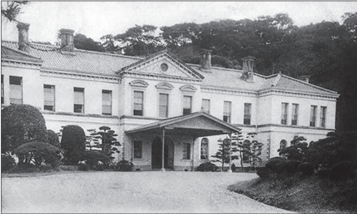
The first headquarters building of the IJN Yokosuka District, which collapsed during the Great Kanto Earthquake of 1923.

the Navy headquarters in the Kanto area from Yokohama to Yokosuka. The building made of bricks completely collapsed during the earthquake. The current C-1 building standing in its place is the second one rebuilt after the quake in 1926, just 7 months after its groundbreaking.