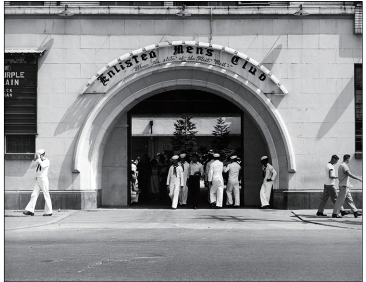
Entrance to the Enlisted Men's Club at the Yokosuka Naval Base, Japan, July 23, 1956.

The current gate, along with Club Alliance and the Visitor Control Center, was built during a three-year construction project which began in 1980, morphing the base into what we recognize today.