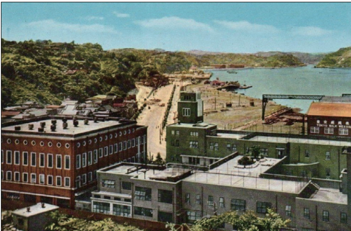
Yokosuka City from back of the EM Club, 1946.

“The world’s largest enlisted club: houses several eating places, discos, cocktail lounges, NEX retail