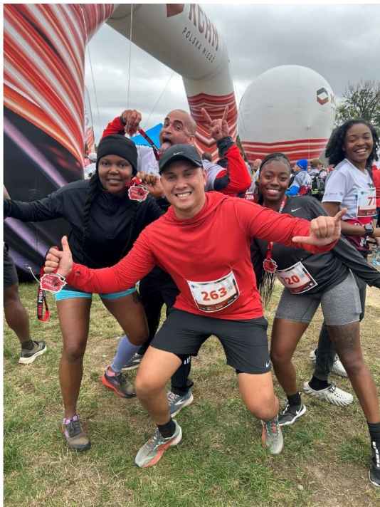
Above: Task Force Provider Soldiers deployed at Powidz, Poland, join the Polish Freedom Run 5K, 10K and Nordic Walk in Glogow, Oct. 7, 2023. The race was organized by the Polish military and law enforcement and was held on a motor cross track.

Transformation is about changing the way we organize, equip and fight as part of the future Army, training to conduct multi-domain operations on the battlefields of today and tomorrow and sustaining the "Hammer of America's Contingency Corps," the 3rd Infantry Division. Current and future readiness requires modernization and the 3rd DSB is on a path that develops, implements, and deploys new capabilities and assists the development of new doctrine that will help sustain units across any battlefield.