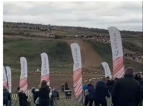
Task Force Provider Soldiers deployed at Powidz, Poland, join the Polish Freedom Run 5K, 10K and Nordic Walk in Glogow, Oct. 7, 2023. The strenuous race was organized by the Polish military and law enforcement and was held on a motor cross track.

Investing in personal development and growth is necessary for living a meaningful and satisfying life. By prioritizing spiritual practices, self-care, and pursuing our passions, we can achieve a healthy balance that nurtures our well-being. Let us acknowledge the value of social support and prioritize our personal growth to lead a fulfilling life.