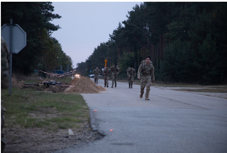
Left: U.S. Army Soldiers assigned to Task Force Provider and Task Force Grizzly participate in the Norwegian Foot March at the airfield in Powidz, Poland, on Oct. 12, 2023. More than 200 active duty and reserve Soldiers participated in the military endurance test. The participants march or run an 18.6-mile-long route, carrying a rucksack of 24 pounds or more. In 1915, the Norwegian army held a test of marching endurance for their soldiers. The tactical goal was to be able to move larger units of troops over a distance swiftly and efficiently in a manner that enabled them to be prepared for combat even after the strenuous march.