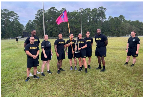
Left: Provider Soldiers of B Company, 87th Division Sustainment Support Battalion take the “Fittest Hellraiser” trophy for the month. Right: Soldiers of the 287th Quartermaster Company held a field feeding academy where teams get the most out of their mobile kitchens to prepare dishes for votes of the best.

Please check out the events available for Soldiers and Families here at Fort Stewart and Hunter Army Airfield! Heart of the Rock! To Hell and Back!