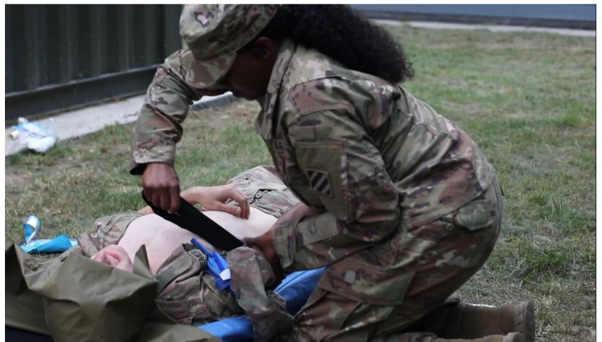
Above: Task Force Provider Soldiers conducted Tactical Combat Casualty Care training from Sept. 18 to 22, 2023, on Powidz, Poland. TCCC prepares troops to efficiently provide immediate medical care in a combat environment.

Right: Provider 6 and 7 visit Soldiers of the 24th Ordnance Company, near Ramstein Air Base, Germany, Oct. 2, 2023. The 24th Ordnance Company Soldiers deployed to Europe in June to support training and operations with U.S. and allied forces to enhance military interoperability and contingency response capabilities.