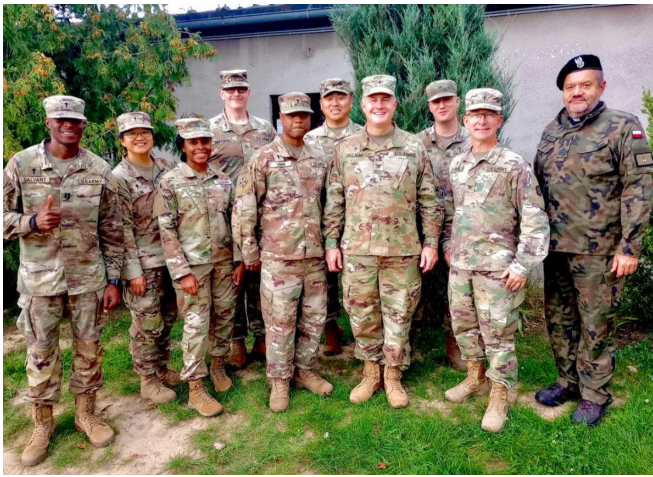
U.S. Army unit ministry team Soldiers assigned to the 3rd Infantry Division's 3rd Division Sustainment Brigade and 3rd Combat Aviation Brigade, the 21st Theater Sustainment Command and the V Corps pose for a photo with the Armed Force Branch Dean Polish Navy on forward base Powidz, Poland, Sept. 13, 2023.