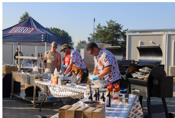
Volunteer Traeger chefs cook barbecue for Powidz military community members during a Patriot Day event at the forward operating site in Poland, Sept. 8, 2023.