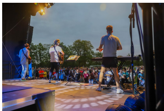
Task Force Provider, Task Force Grizzly and Task Force Empire enjoy a concert put on by the Army Morale, Welfare and Recreation program with a performance by the group AJR in Powidz, Poland, Sept. 4, 2023.