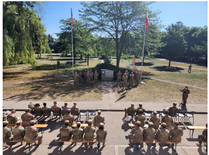
Members of the Powidz Military Community observe the transfer of authority ceremony between the outgoing 68th Division Sustainment Support Battalion and the incoming 787th Combat Sustainment Support Battalion on Forward Operating Site Powidz, Poland, July 9, 2023.