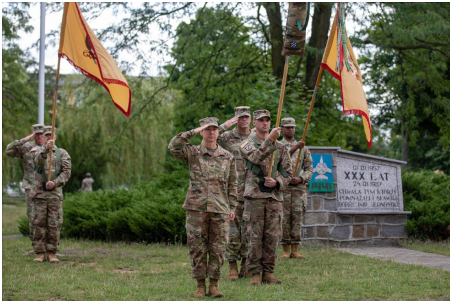
U.S. Army Soldiers assigned to 3rd Division Sustainment Brigade, 3rd Infantry Division, conduct the brigade transfer of authority ceremony on Powidz, Poland, Aug. 6, 2023.

The Corps and subordinate units support U.S. Army Europe and Africa Command, which manages a balanced mix of both permanent and rotational forces to provide ready, combat-credible land forces to deter, and, if necessary, defeat aggression from any potential adversary in Europe and Africa.