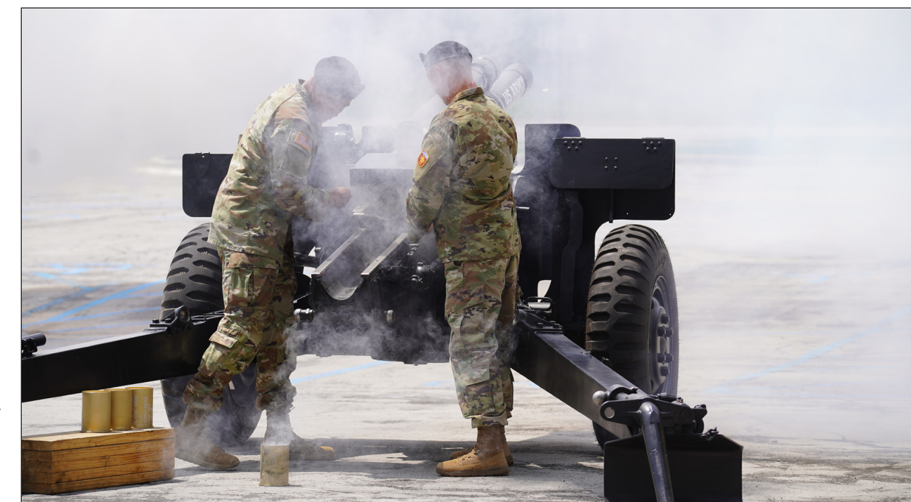
Members of the Michigan Army National Guard's 199th Field Artillery Salute Battery fire a howitzer.

A flight crew assigned to U.S. Navy Helicopter Sea Combat Squadron 8, prepares a MH-60S Seahawk for liftoff from Amedee Army Airfield, Aug. 9, as part of expeditionary base operations training for four units from the U.S. Navy, Marines, and Air National Guard, Aug. 7-11, at Sierra Army Depot.