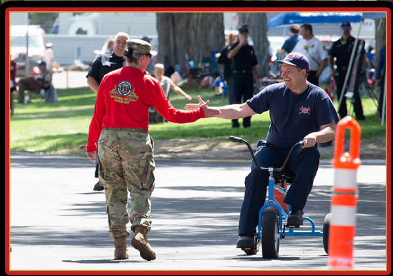
Employee Appreciation Day - Page 7