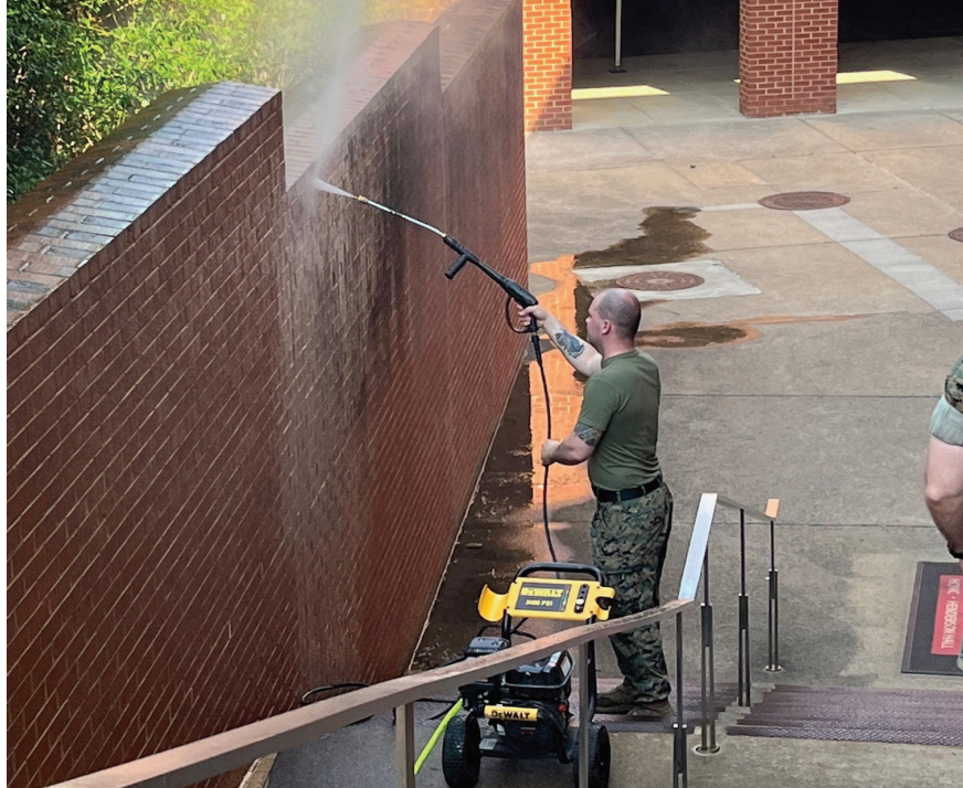
Marine Sgt. Isaiah Fox power washes grime off a wall April 21 at Henderson Hall campus of Joint Base Myer-Henderson Hall during the final day of the Single Marines Program Days of Service.

Organizations seeking volunteers can reach out to Ethan Coddington, at 703-220-1001 or ethan.coddington@usmc-mccs.org . For Marines interested in volunteering, visit the Henderson Hall events page on Eventbrite.