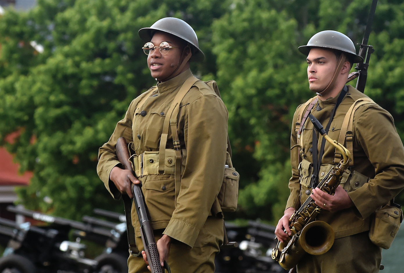
Soldiers with the 3d U.S. Infantry Regiment (The Old Guard) portray the “Harlem Hellfighters” of the 369th Infantry Regiment, New York Army National Guard in a vignette on the 369th’s World War I service as part of the Military District of Washington’s “Twilight Tattoo” May 3 at Joint Base Myer-Henderson Hall.