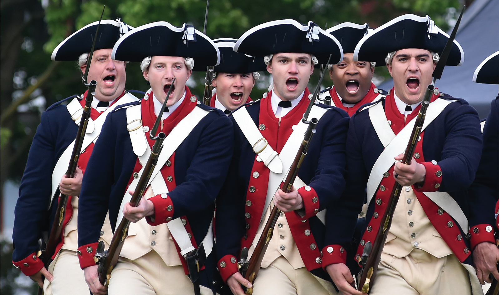
Soldiers with the 3d U.S. Infantry Regiment (The Old Guard) perform a bayonet charge as part of the Military District of Washington's "Twilight Tattoo" May 3 at Joint Base Myer-Henderson Hall.