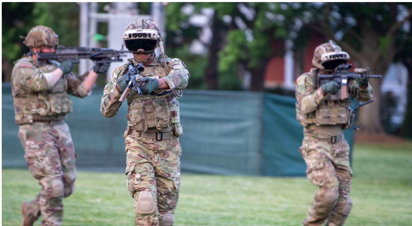
U.S. Soldiers assigned to the 3d U.S. Infantry Regiment (The Old Guard), perform at Twilight Tattoo May 24 at Joint Base Myer-Henderson Hall.