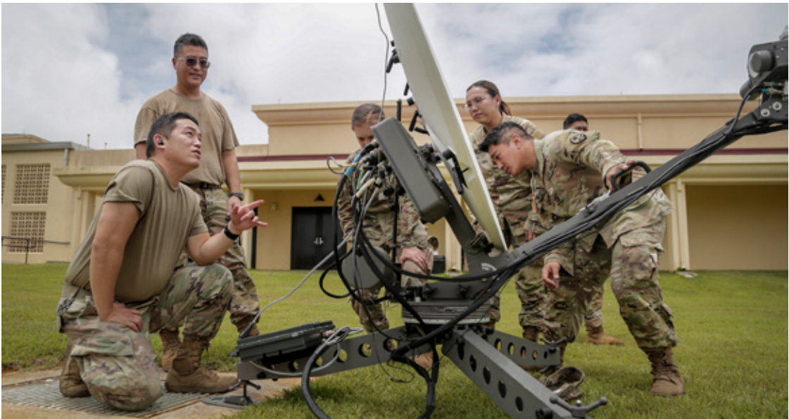
Airmen of the 154th Communications Squadron, assist members of the Guam National Guard with emergency communications equipment following Typhoon Mawar in Barrigada May 28. The Category 4 storm brought torrential rains and winds of up to 150 mph, temporarily degrading internet and cellphone service on the island.