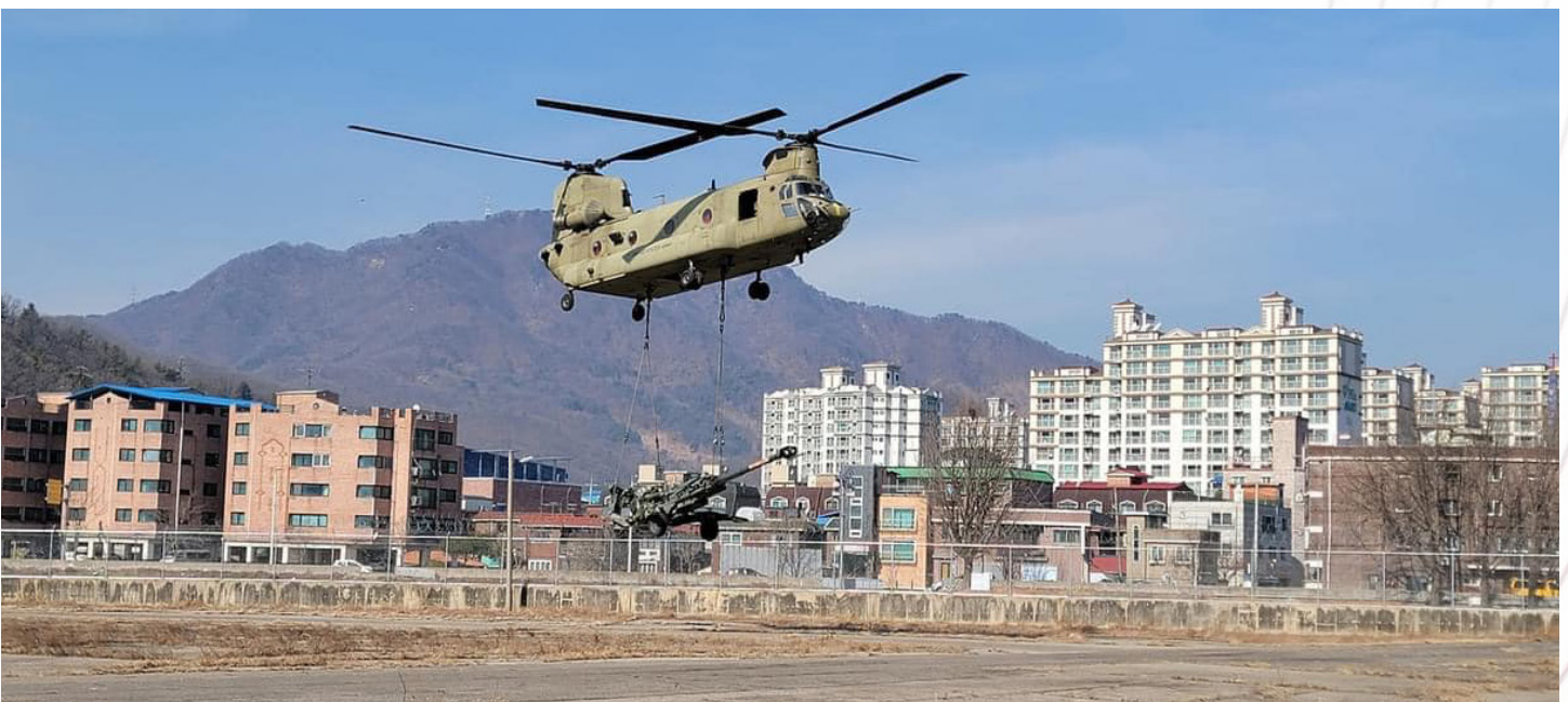
A CH-47 Chinook helicopter from the 2nd Combat Aviation Brigade, 2nd Infantry Division/ROK-U.S. Combined Division sling loads a howitzer in the Republic of Korea in February 2023. The ability to operate in various types of terrain, from rural to urban environments, is crucial to success in Korea and for maintaining a free and open Indo-Pacific Region.