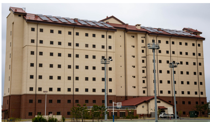
Buildings used by Eighth Army personnel across South Korea are some of the newest in the Department of Defense. These Leadership in Energy and Environmental Design-certified buildings ensure working and living conditions meet high standards for personnel, and help conserve resources.