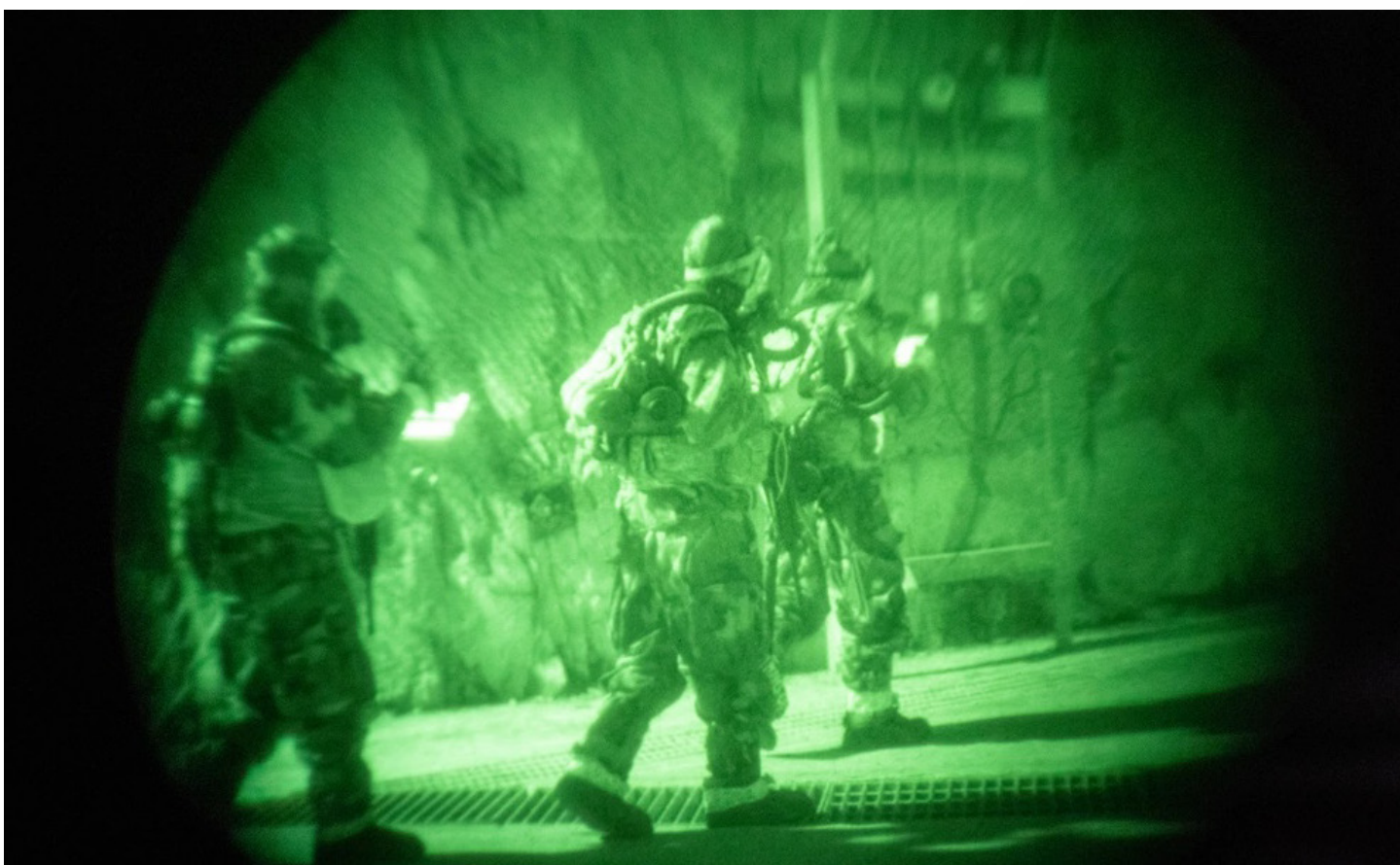
Soldiers assigned to the 2nd Infantry Division practice securing an underground facility in chemical protective equipment at night. Among Eighth Army's manifold mission set is the requirement to secure suspected weapons of mass destruction sites.