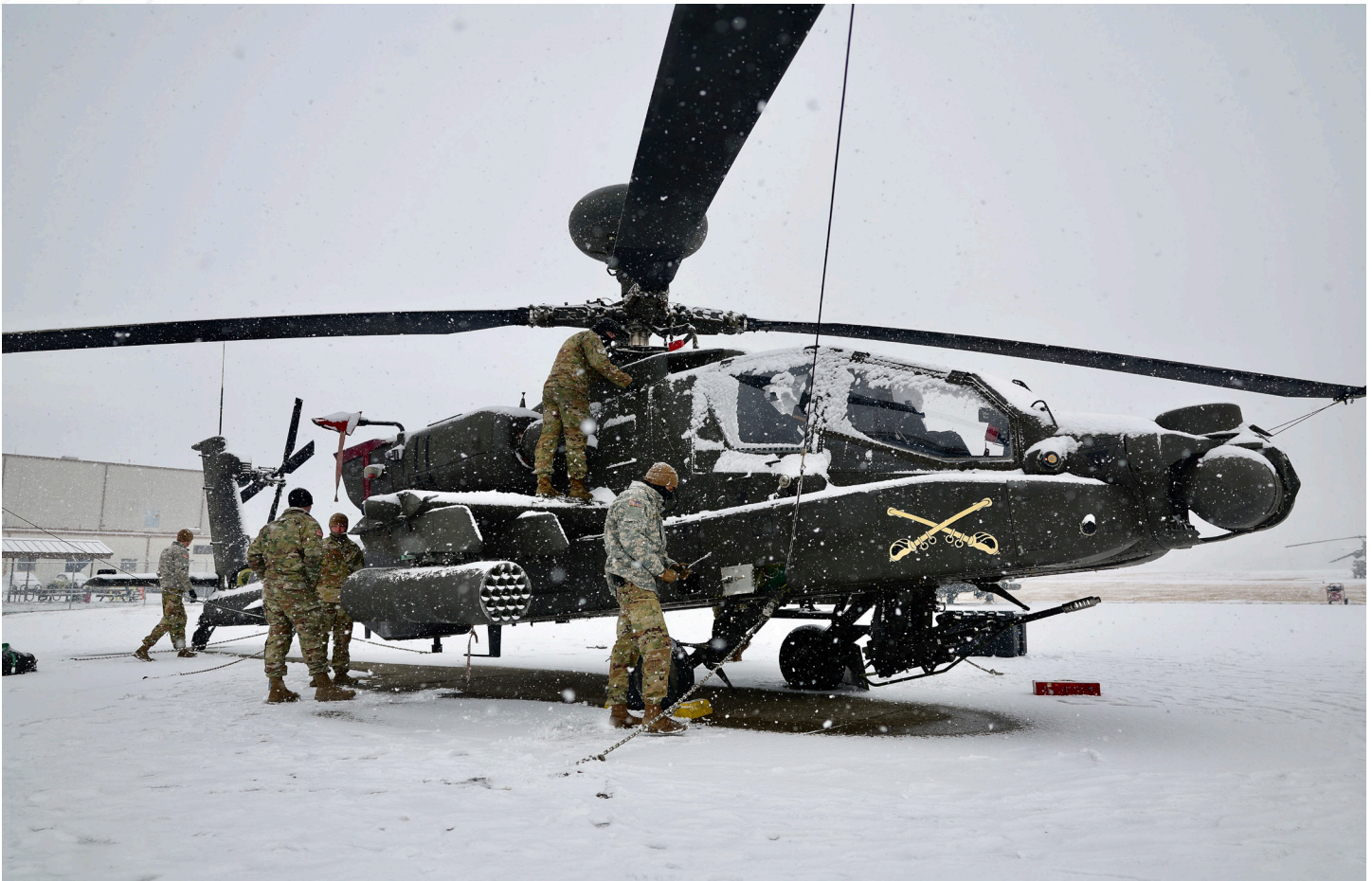
Soldiers assigned to 5th Squadron, 17th Cavalry Regiment, 2nd Combat Aviation Brigade, 2nd Infantry Division, perform maintenance on an AH-64E Apache helicopter moments after a snow storm passed through Camp Humphreys, South Korea on Dec. 6, 2022. Regardless of the weather condition, Soldiers in Korea must be ready to perform their assigned missions.