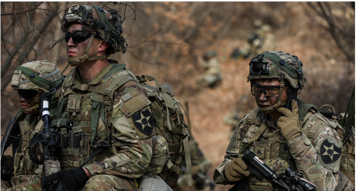
Soldiers from 4th Battalion, 23rd Infantry Regiment "Tomahawks", 2nd Stryker Brigade Combat Team, 2nd Infantry Division, conduct situational training exercises, March 14, 2023, at Goldmine training area during exercise Warrior Shield. Warrior Shield is a 2nd Infantry Division exercise that showcases and employs Fight Tonight fundamentals and capabilities.