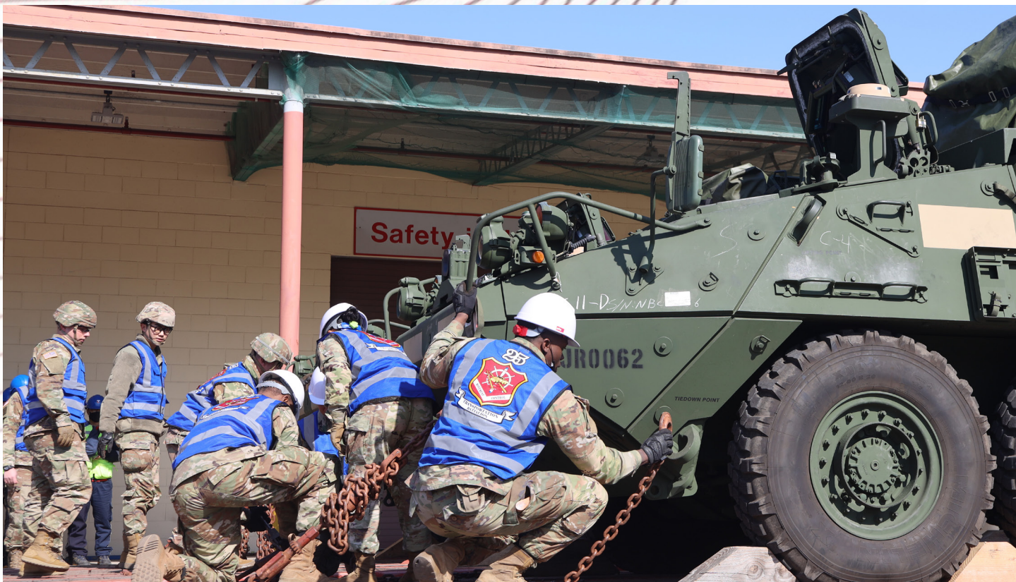
Troops in the 25th Transportation Battalion train at Camp Carroll to support movement control operations throughout Korea. The ability to safely and effectively move personnel and equipment is a necessity in military operations.