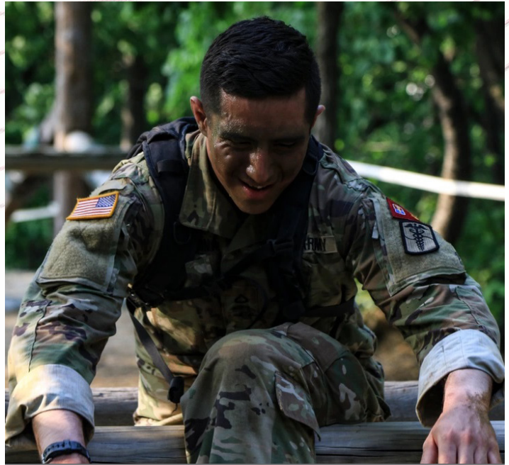
Soldiers assigned to Korea must be able to work in humid and hot conditions during the summer months and bitter cold during winter months. In the picture above, a Soldier assigned to the 65th Medical Brigade works his way through an obstacle course at Camp Casey during an individual skills competition during late spring.

Eighth Army works in a complex and demanding environment. Summer months in Korea are often hot and humid. Significant rainfall poses a unique planning consideration for Eighth Army units. In winter months, Soldiers accomplish their missions in windy and frigid cold weather. Regardless of the conditions, Eighth Army stands ready to Soldier On and accomplish its missions during peacetime, crisis, or conflict.