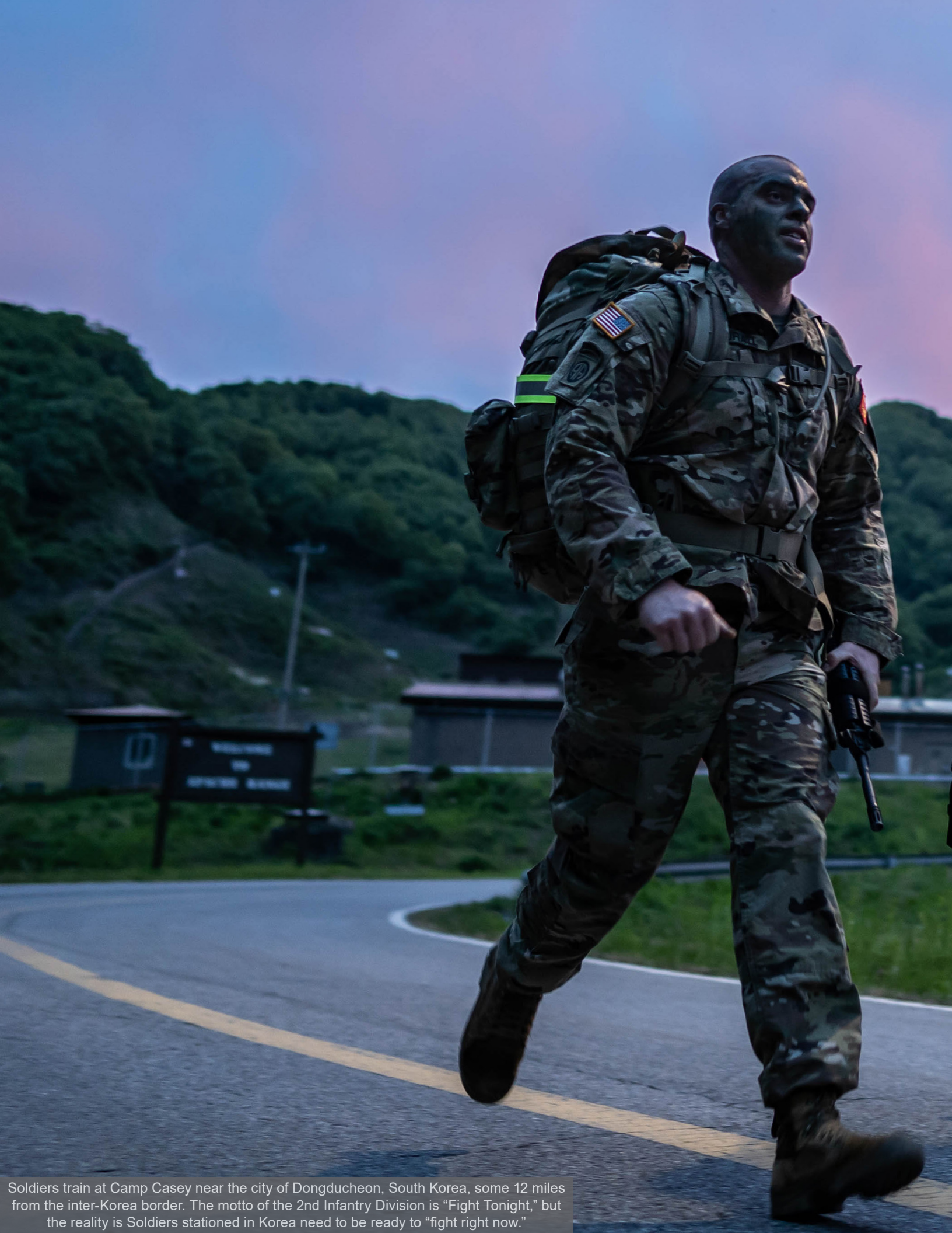
Soldiers train at Camp Casey near the city of Dongducheon, South Korea, some 12 miles from the inter-Korea border. The motto of the 2nd Infantry Division is "Fight Tonight," but the reality is Soldiers stationed in Korea need to be ready to "fight right now."