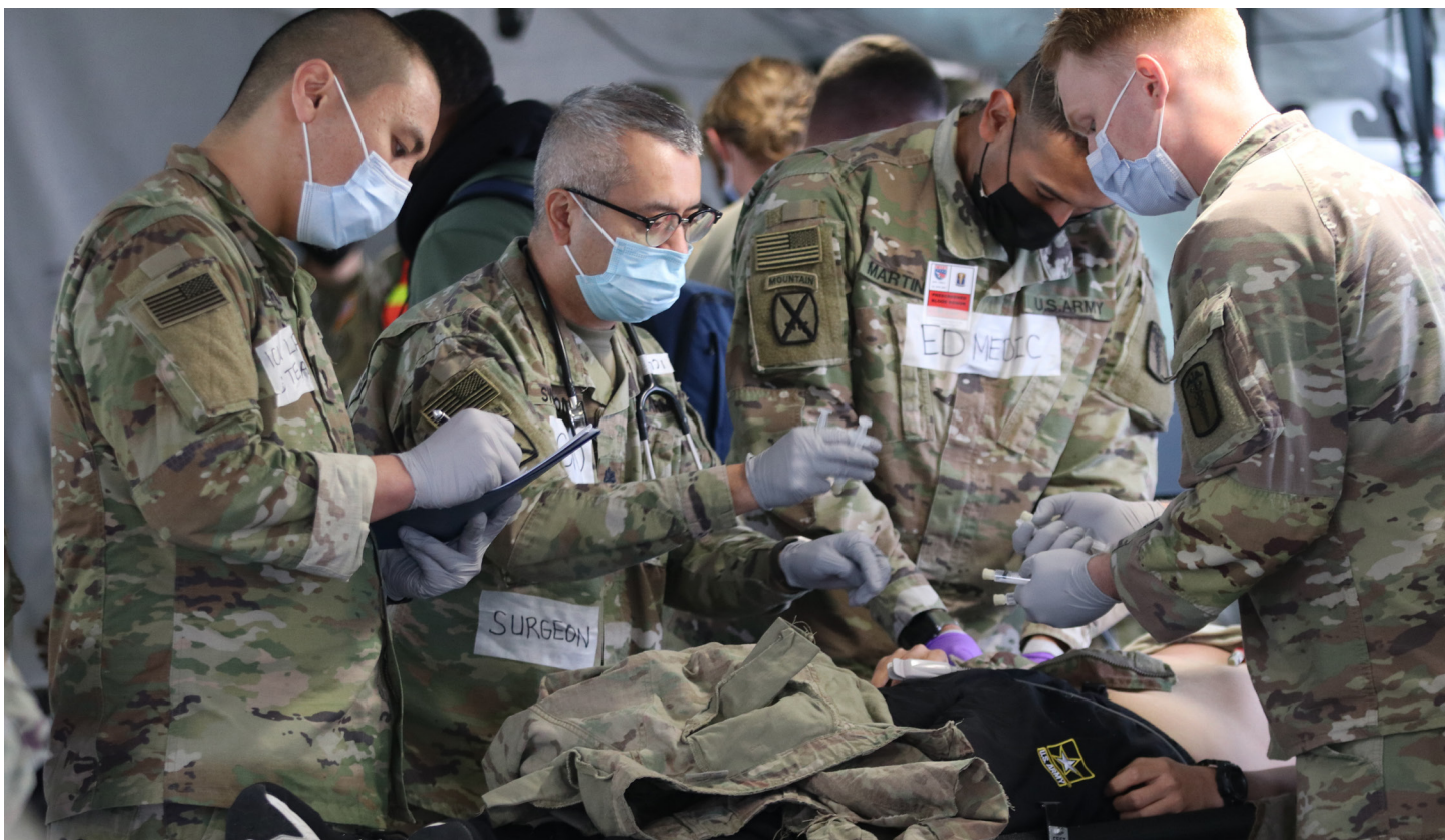
Ensuring medical care for people is a top priority for Soldiers in the 502nd Field Hospital. Sustaining and improving their talents requires medical professional to train in various settings, including in austere and non-permanent structures, as seen above.