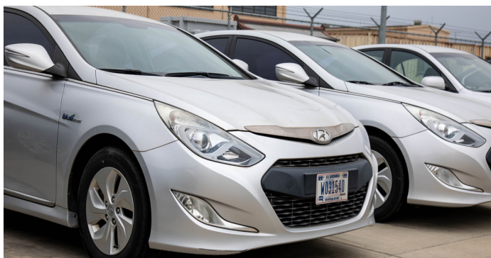
Replacement of gasoline-powered non-tactical vehicles with electric vehicles is part of Eighth Army's contributions toward the U.S. Army's Climate Strategy and mitigating effects of climate change.