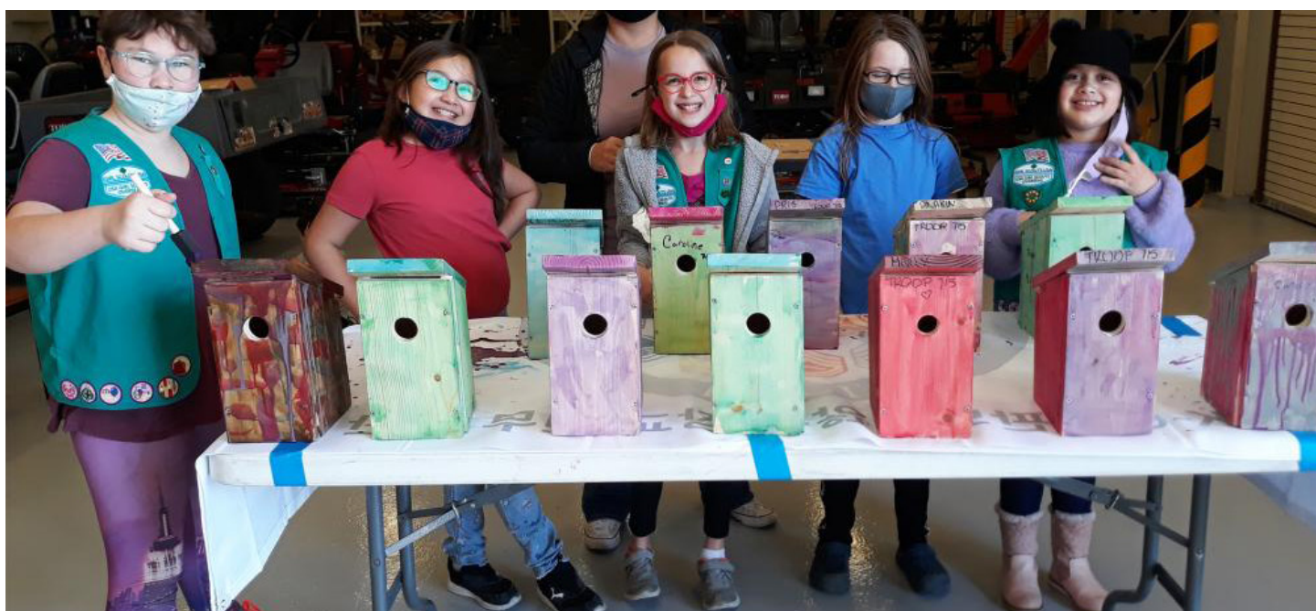
Members of USA Girl Scouts Overseas Troop 715 display bird houses built in cooperation with River Bend Golf Course at U.S. Army Garrison Humphreys Feb. 20, 2021. The bird houses were constructed to combat mosquitos and other pests naturally. River Bend Golf Course was designated a Certified Audubon Cooperative Sanctuary by Audubon International on Nov. 28, 2022.