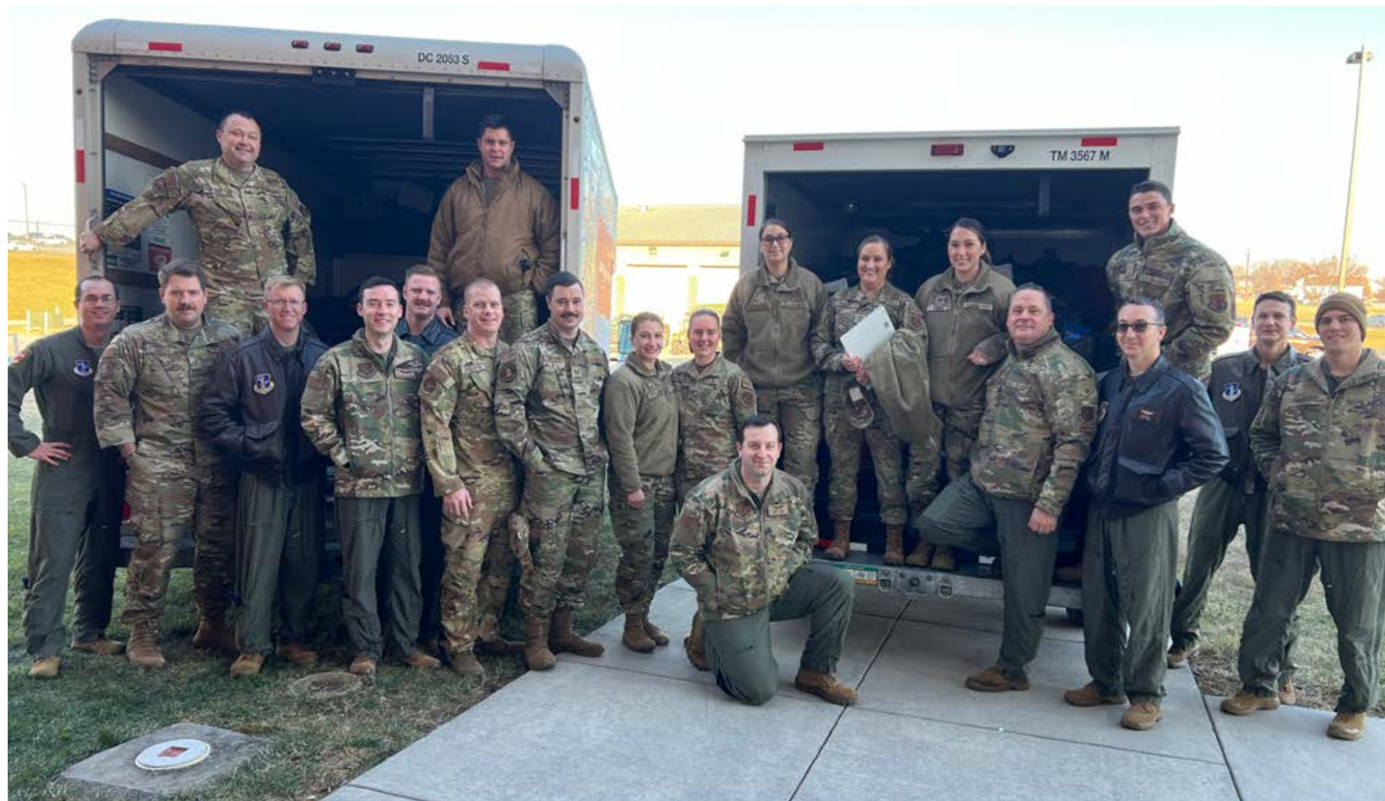
167th Operations Group personnel stand with delivery trucks full of donated Christmas gifts for 143 children of 55 families from 7 local schools, as part of the annual Ops Adopts program. 167th OG personnel coordinate with teachers and guidance counselors to identify families in need and members from around the Wing donate gifts in support of the program. The gifts are delivered to the schools wrapped and tagged.

Merry Christmas! I have a third grader who has been missing a lot of days and it had been very difficult getting her mother to return our calls. When I finally reached her, she apologized and said she (mother) has not been feeling well. Since her daughter was one of the weekly food bag recipients, I asked her if they needed assistance for Christmas. She was relieved and appreciative of the offer since her health issues and related expenses have prevented her from getting gifts for her kids. When she came to pick up the gifts she did not look well. It was then she told me she had stage 4 liver cancer, and this would probably be the last Christmas she gets to spend with her kids. She was very appreciative of the gifts. I think your unit's generosity certainly made a difference to this family.