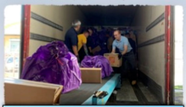
Members assigned to Naval Supply Systems Command Fleet Logistics Center Sigonella and members belonging to Naval Air Station Sigonella's (NASSIG) All Officers Spouses Club volunteer time December 21, 2022 to assist the command's fleet mail center staff in processing mail and packages during the holiday season at NASSIG, Italy.

Besides augmenting their FMC workforce, another way NAVSUP FLCSI postal teams prepared for the 2022 holiday mail season was to perform a continuous process improvement (CPI) review in early December with the command's mail control activity (MCA) team operating at Rome Fiumicino International Airport.