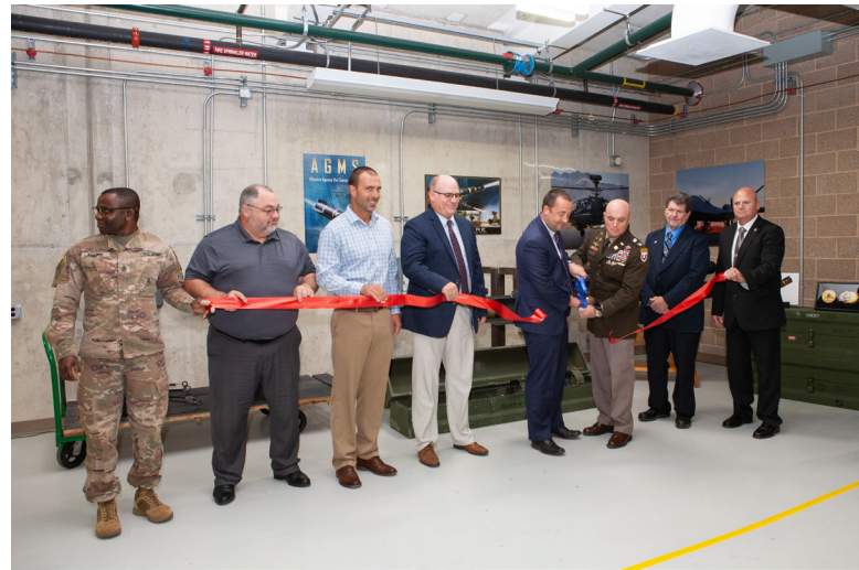
Members from the Tactical Aviation and Ground Munitions Program Office, TAGM, join Letterkenny Army Depot leadership to mark the transition of the Heliborne Laser Fire and Forget, also known as Hellfire, missile and Joint Air to Ground Missile, JAGM, program to Letterkenny Army Depot during a ribbon cutting ceremony Oct. 20.

The equipment shipments will continue through February 2023, and support will be provided by the Redstone Test Center and other stakeholders. LEAD’s production will begin in mid-2023.