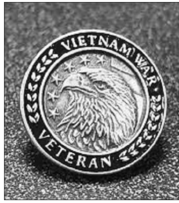
Vietnam veterans' lapel pin

Editor's note: This is the 361st in a series of articles about Vietnam veterans as the United States commemorates the 50th anniversary of the Vietnam War.