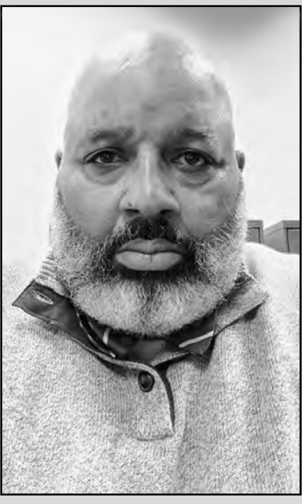
ing able to empathize.

Two people: my father and my maternal grandfather. They taught me every aspect of manhood, including being a gentleman, strong work ethic and be-