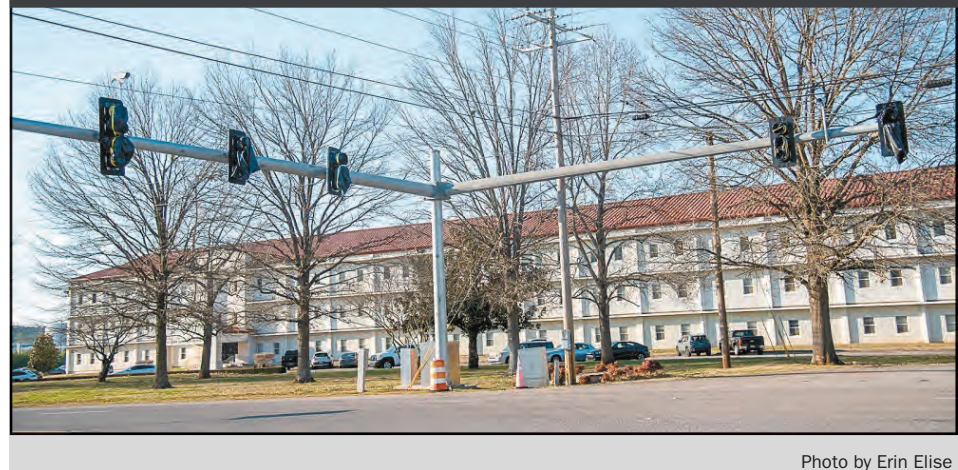
eral Center of Excellence